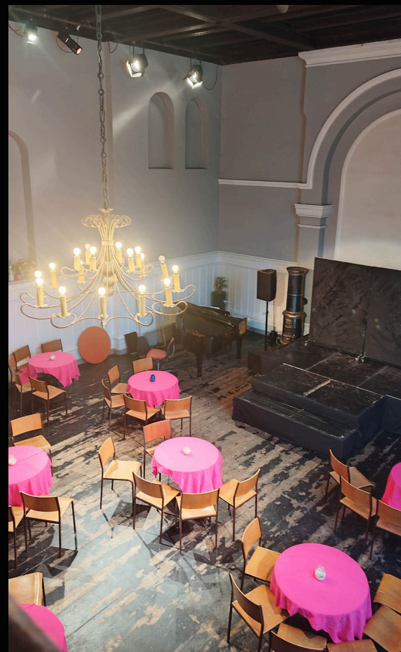
Examples of previous venues