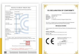
[KC 인증] R-R-min-MTC-ABSF-100W