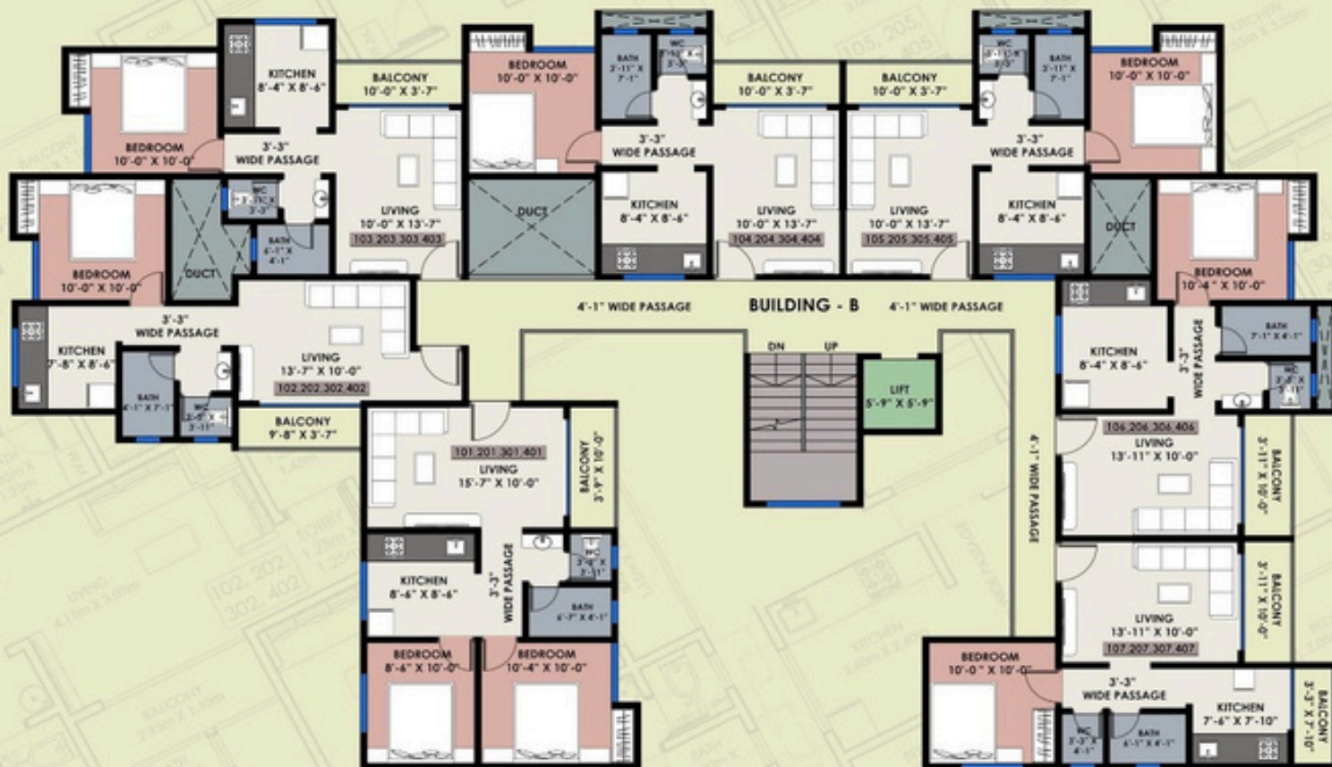
3D Floor Plan: Building B