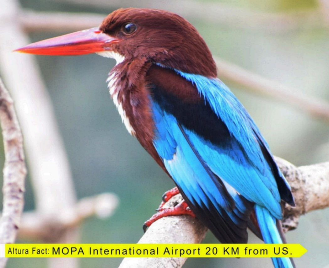
Altura Fact: MOPA International Airport 20 KM from US.