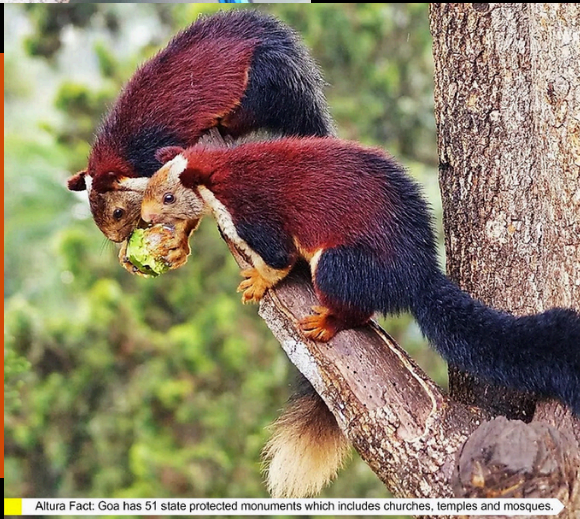
Altura Fact: Goa has 51 state protected monuments which includes churches, temples and mosques.