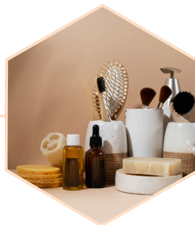
Personal Care & Cosmetics