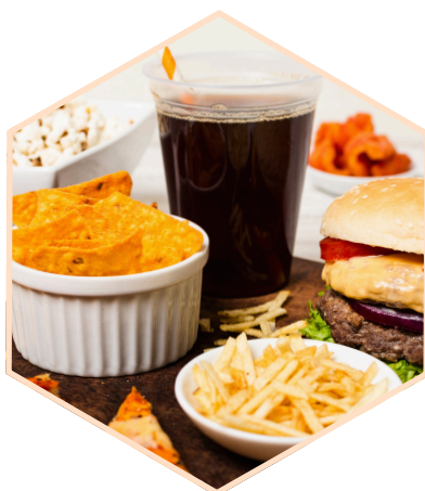
Food & Beverages