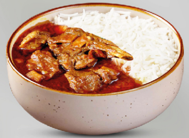
Mutton | AED 20 Rice Bowl