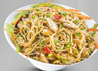
Hakka Beef Noodles 20.00