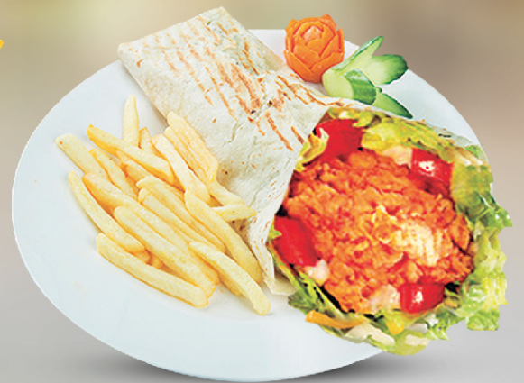
Spanish Wrap | AED 18