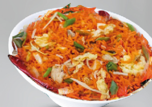
Shezwan Chicken Fried Rice 18.00