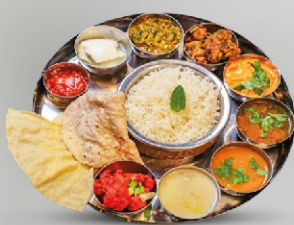
Non Veg Thali 18.00