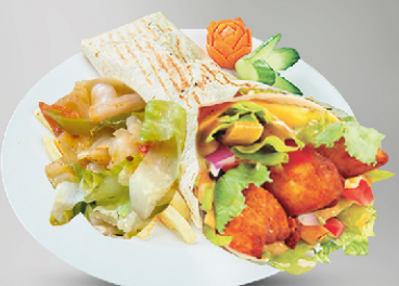
Nuggets Wrap | AED 16