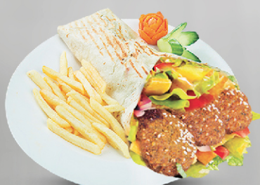
Falafel Wrap | AED 15