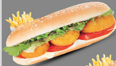
Jumbo Prawns Combo