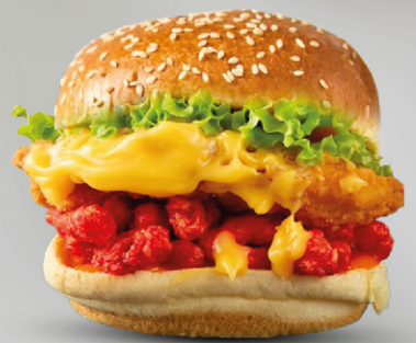
Grilled Cheetose Burger Chicken | AED 18