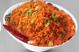
Shezwan Veg Fried Rice 16.00