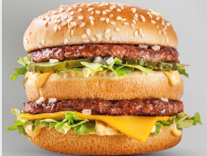
Beef Double Burger | AED 16