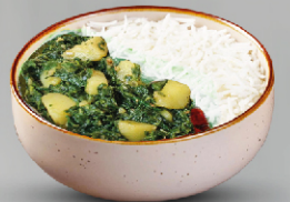
Alu Palak Rice Bowl AED 10