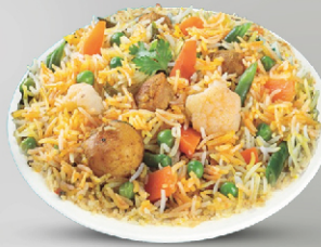
Veg Biryani 14.00