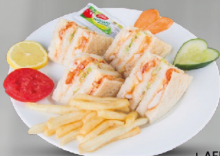
Fish Fillet Club