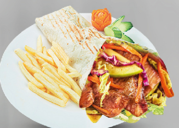
Tax Max Steak Wrap | AED 15