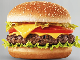
Beef Burger | AED 12