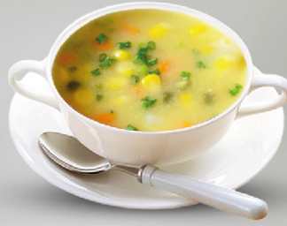
Veg Corn Soup 14.00