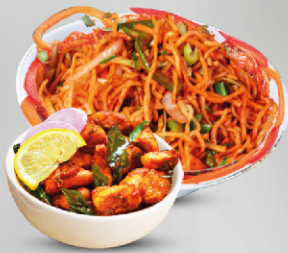
Chicken 65 Shezwan Noodles Combo AED 24