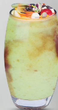
Green Apple Refresher | AED 15