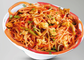
Shezwan Egg Noodles 15.00