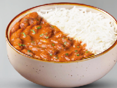
Rajma Rice Bowl AED 14