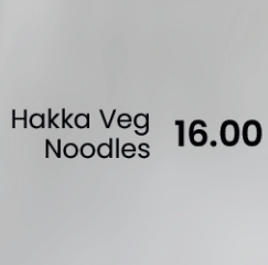
Hakka Veg Noodles 16.00