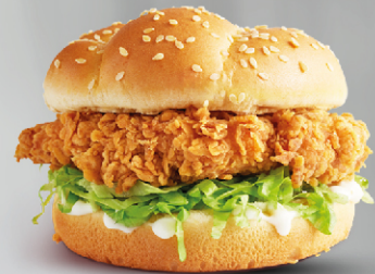
Zinger Burger | AED 14

One of the most beneficial aspects of burgers is their high protein content. Protein helps build muscle mass and keeps your energy levels up throughout the day. Each burger patty contains around 15-25g of quality protein that has been proven to keep you feeling fuller for longer periods of time.