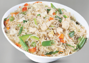
Chicken Fried Rice 15.00