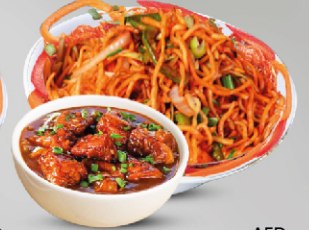
Chilli Paneer Shezwan Noodles Combo AED 22