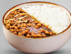
Chana Masala Rice Bowl AED 12