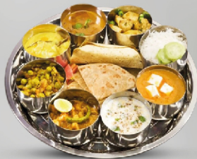
Veg Thali 15.00