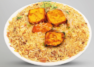
Paneer Tikka Biryani 16.00