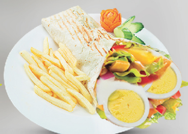
Egg Wrap | AED 15