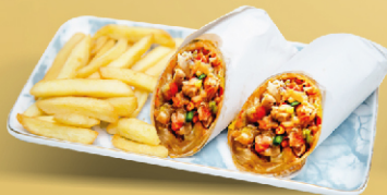
Egg Burji Roll | AED 10