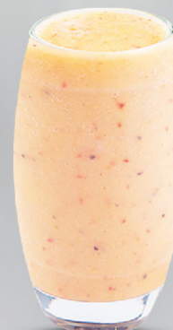
Cashew Velvet | AED 18