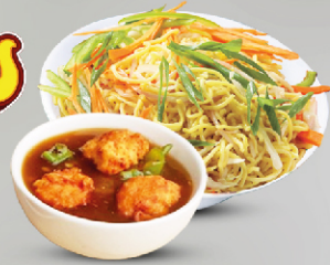
Veg Munchurian Noodles Combo AED 18

Many people like to eat noodles. Noodles play an irreplaceable role in the diet of people in the north of China.