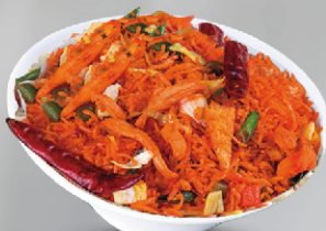
Shezwan Egg Fried Rice 18.00