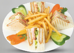
Chicken Fillet Club