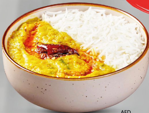
Dal Tadka Rice Bowl AED 10