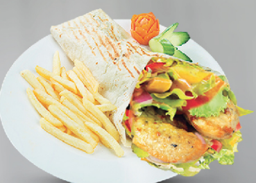
Smoked Chicken Wrap | AED 15

These healthy wraps are a perfect packed lunch! Flavorful and satisfying, they're stuffed with greens, avocado, and a honey-Dijon chickpea salad. Versatile and convenient, serving as a base for a variety of healthy fillings like vegetables, lean proteins, and healthy fats. Can be high in fiber if made from whole grains, supporting digestive health and promoting regular bowel movements