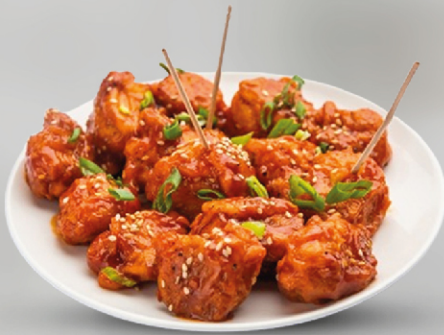
Chicken 65 16.00

The appetizers have many advantages as they are not just useful for taking the time until the main dishes are ready. To begin with, they are most useful in assisting to jump-start your digestion process in the body. If you take a small, tasty snack before dinner.