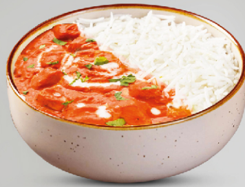
Butter Chicken | AED 18 Rice Bowl