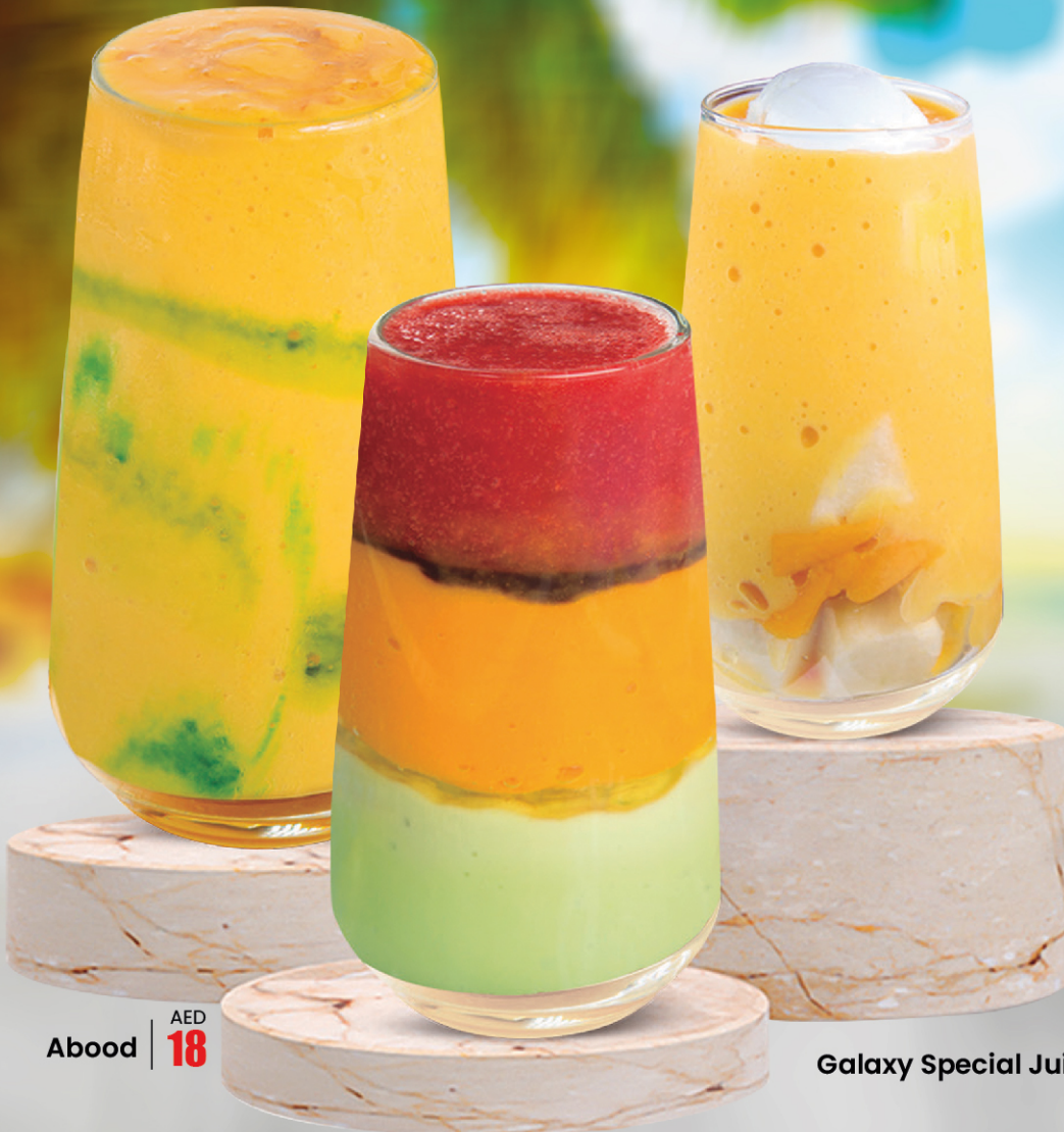
Abood | AED 18