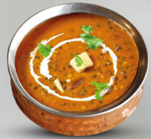
Dal Tadka 10.00