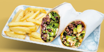
Beef Roll | AED 14