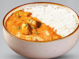
Paneer Tikka Rice Bowl AED 18