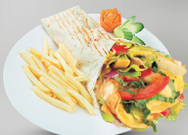
Omlet Wrap | AED 15