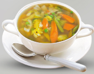
Veg Clear Soup 12.00