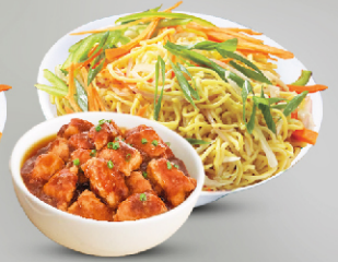
Chicken Munchurian Noodles Combo AED 22