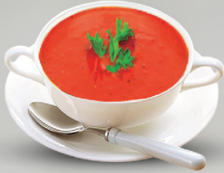
Tomato Soup 14.00