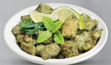
Coriander Chicken Dry 20.00