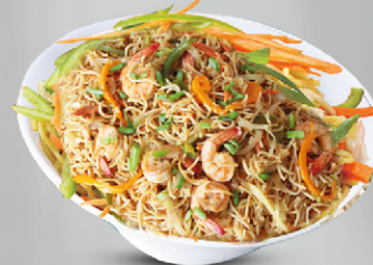
Hakka Prawns Noodles 20.00