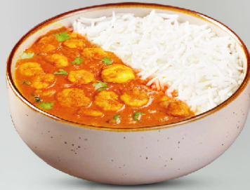
Prawns Masala | AED 22 Rice Bowl