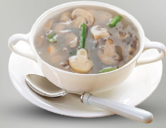
Mushroom Soup 14.00