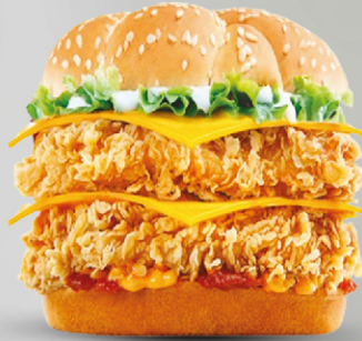
Zinger Double Burger | AED 18