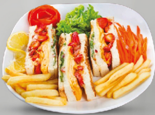
Jumbo Prawns Club