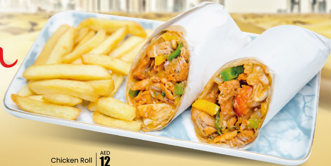
Chicken Roll | AED 12

Sandwiches are easy to prepare and can be made in advance, even the night before. Plus, they are a convenient platform to supply energy, fiber, calcium, iron, protein, and B vitamins to your child's diet.