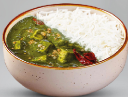
Palak Paneer Rice Bowl AED 15