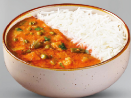
Mix Veg Rice Bowl AED 15