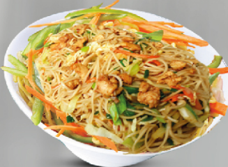
Hakka Chicken Noodles 18.00