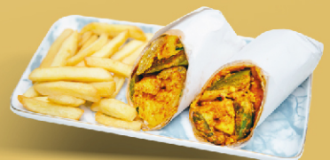
Paneer Roll | AED 14