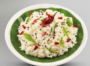
Curd Rice 12.00

LUNCH TIME • LUNCH TIME • LUNCH TIME • LUNCH TIME • LUNCH TIME • LUNCH TIME • LUNCH TIME • LUNCH TIME • LUNCH TIME • LUNCH TIME • LUNCH TIME