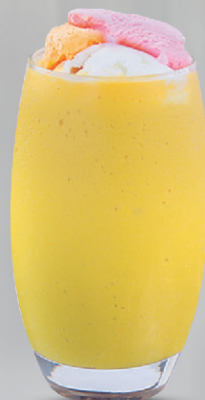
Aboodh | AED 18