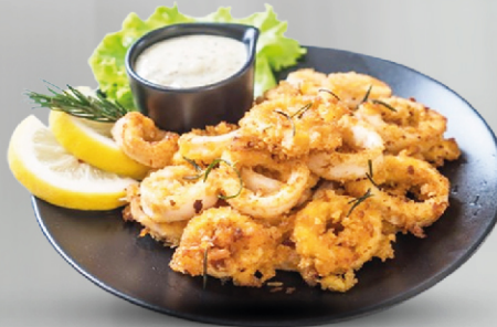
Calamari (Salt & Pepper) 22.00