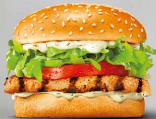
Grilled Chicken Burger | AED 17