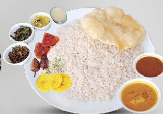
Plain Rice 8.00