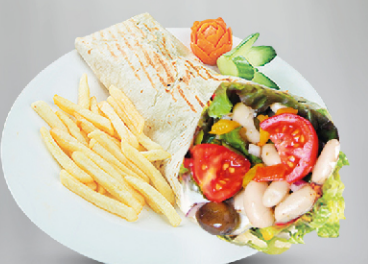
Verdure Wrap | AED 13