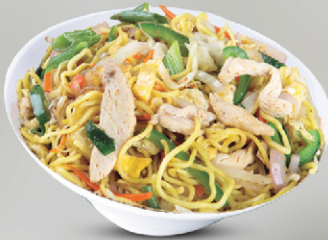
Chicken Noodles 16.00