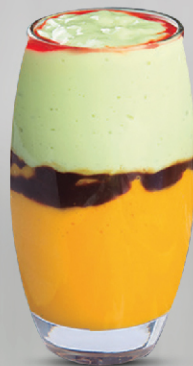
Burj Al Arab | AED 18

Adding fresh juice to your daily routine is a tasty and easy way to give your health a boost. Fresh juice, especially when made from a variety of fruits and veggies, delivers a powerful dose of vitamins, minerals, and antioxidants to help you feel your best. At Refresh Juice, we're all about the transformative power of fresh juice, and we're excited to share the top 10 health benefits you can enjoy by sipping on a bottle every day.