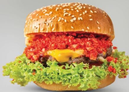
Grilled Cheetose Burger Beef | AED 18