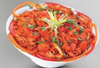
Shezwan Chicken Noodles 18.00