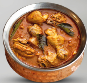
Chicken Masala 15.00

VEGETABLES • VEGETABLES • VEGETABLES • VEGETABLES • VEGETABLES • VEGETABLES • VEGETABLES • VEGETABLES • VEGETABLES • VEGETABLES • VEGETABLES •