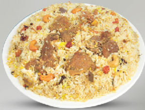
Mutton Biryani 20.00