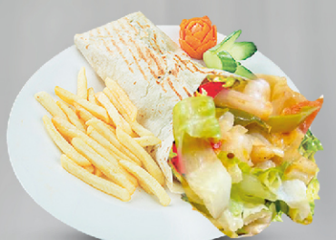
Chipotle Prawns Wrap | AED 15