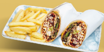
Mutton Roll | AED 16