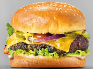
Grilled Beef Burger Spicy | AED 19