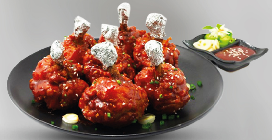
Chicken Lollipop 15.00