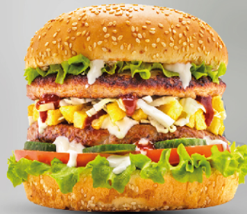
Chicken Double Burger | AED 15