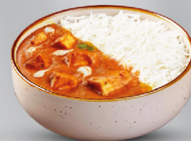
Paneer Makhni Rice Bowl AED 18

Is rice nutritious? Rice is a rich source of carbohydrates, the body's main fuel source. Carbohydrates can keep you energized and satisfied, and are important for fueling exercise. Brown rice, especially, is an excellent source of many nutrients, including fiber, manganese, selenium, magnesium, and B vitamins.