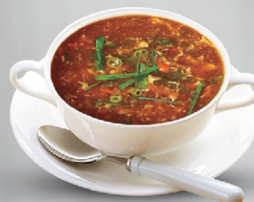
Chicken Hot & Sour Soup AED 16