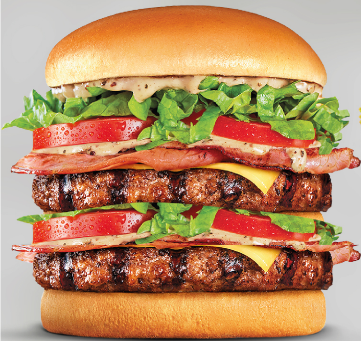
Grill Double Burger Spicy | AED 22