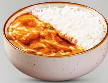
Chicken Tikka Masala | AED 18 Rice Bowl