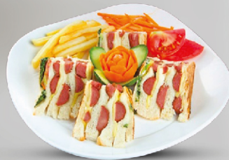
Hot Dog Club