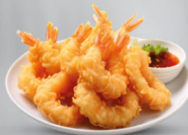
Golden Fried prawns 22.00