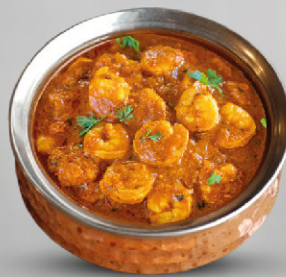
Beef Masala 22.00