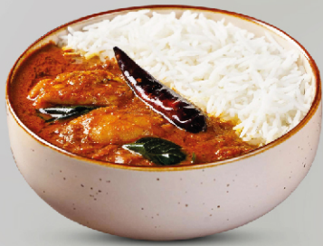
Chicken Curry | AED 15 Rice Bowl