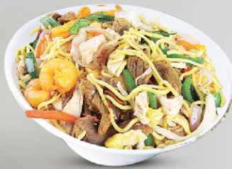
Mix Noodles 22.00