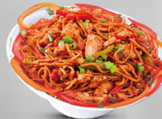
Shezwan Mix Noodles 22.00