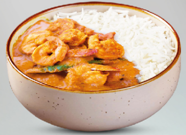
Prawns Curry | AED 22 Rice Bowl