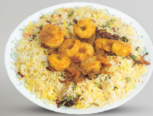
Prawns Biryani 22.00