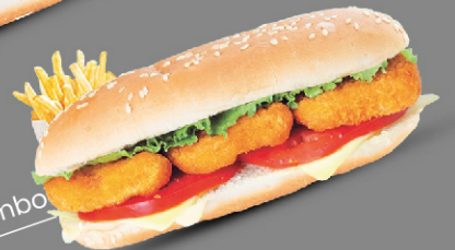
Chicken Nuggets Combo