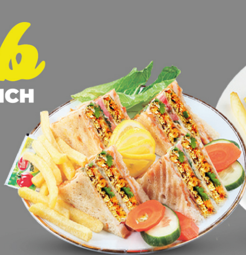
Cheese Sandwich | AED 12

Bread, especially wholemeal, is an important source of dietary fibre which helps to keep our digestive system healthy, helps control blood sugar and cholesterol levels and makes us feel fuller for longer. On average in the UK, bread provides 17-21% of fibre intake across all age groups. Sandwich bread is a staple in many households, available in numerous varieties to suit different dietary needs. Sandwich bread is a staple in many households, available in numerous varieties to suit different dietary needs. Understand the nutritional differences between types and discover the best storage practices to keep bread fresh longer.