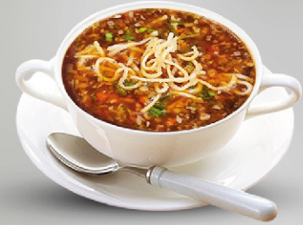
Veg Munchow Soup 14.00