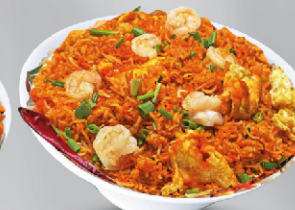
Shezwan Prawns Fried Rice 20.00