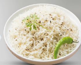
Jeera Rice 10.00