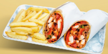
Chicken 65 Roll | AED 14