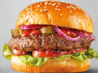
Grilled Beef Burger | AED 18