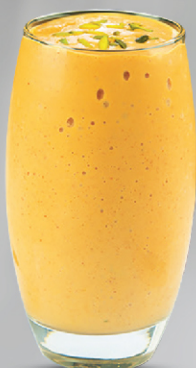
Citrus Cooler | AED 12