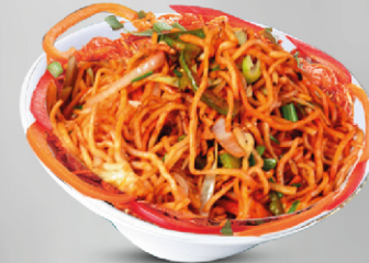
Shezwan Veg Noodles 16.00