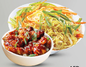
Honey Chicken Noodles Combo AED 24