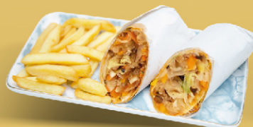
Vegetable Roll | AED 10