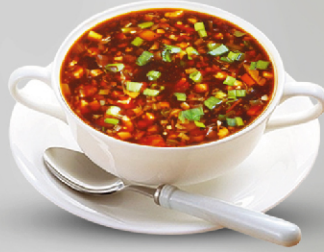
Veg Hot & Sour Soup 14.00