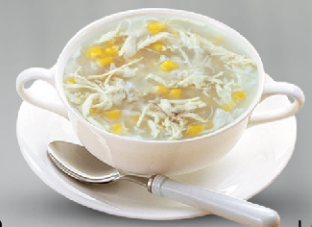
Chicken Corn Soup AED 16