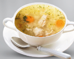
Chicken Clear Soup AED 14