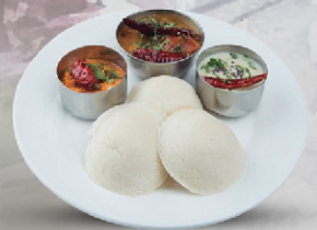
Idly Chutney Set