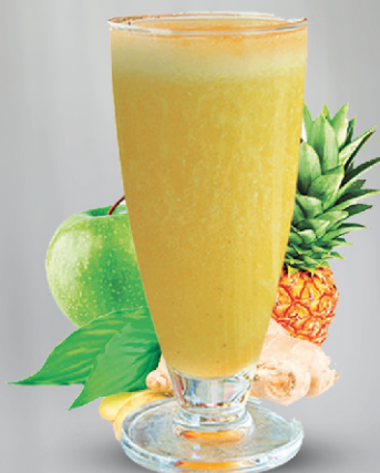
JUICE SALVATION Apple, Pineapple, Ginger | AED 15