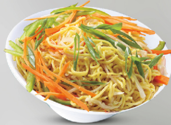
Veg Noodles 16.00