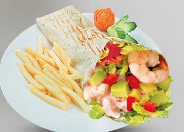
Prawns Wrap | AED 18