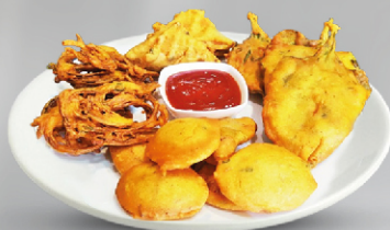
Mix Pakoda 10.00