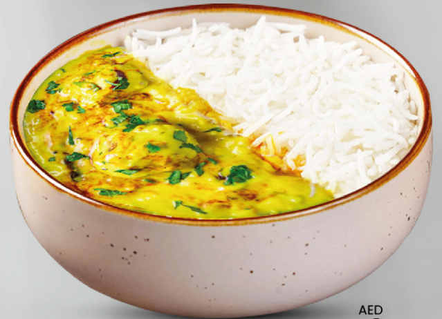
Cuddy Pakoda Rice Bowl AED 10