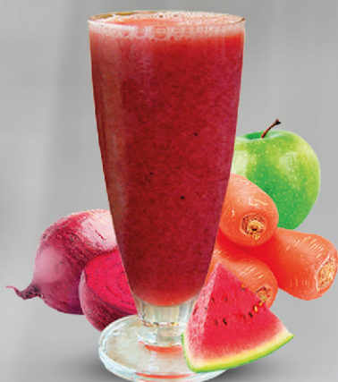
IRON BOOSTER Beetroot, Carrot, Apple, Watermelon | AED 15