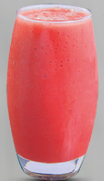
Red Velvet | AED 16