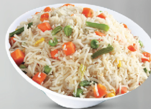
Veg Fried Rice 14.00

It contains carbohydrate, fat, calcium, phosphor, iron, Vitamin A, and Vitamin C. Fried rice is known for its high protein compounds, and it's recommended mostly for those who are involved in muscle formation programs. It helps in the development of muscle due to its richness in protein.