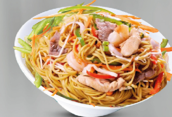
Hakka Mix Noodles 22.00