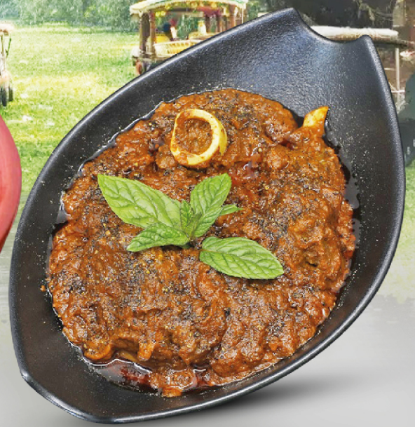
Mutton Kali Mirch | AED 18