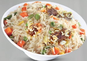
Beef Fried Rice 18.00