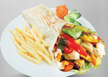
Vegetable Wrap | AED 14