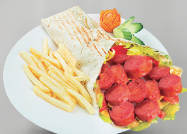
Hot Dog Wrap | AED 16