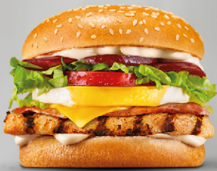
Grilled Chicken Burger Spicy | AED 18