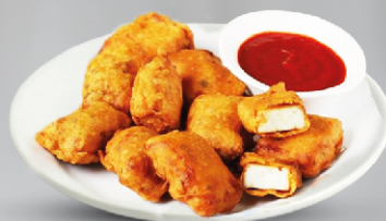
Paneer Pakoda 15.00