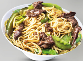
Beef Noodles 18.00