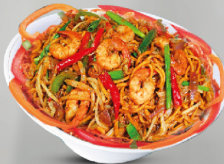
Shezwan Prawns Noodles 20.00