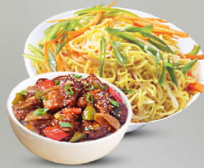
Chicken Chilli Noodles Combo AED 22