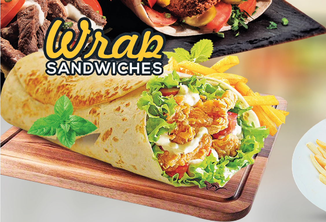
Zinger Wrap | AED 16