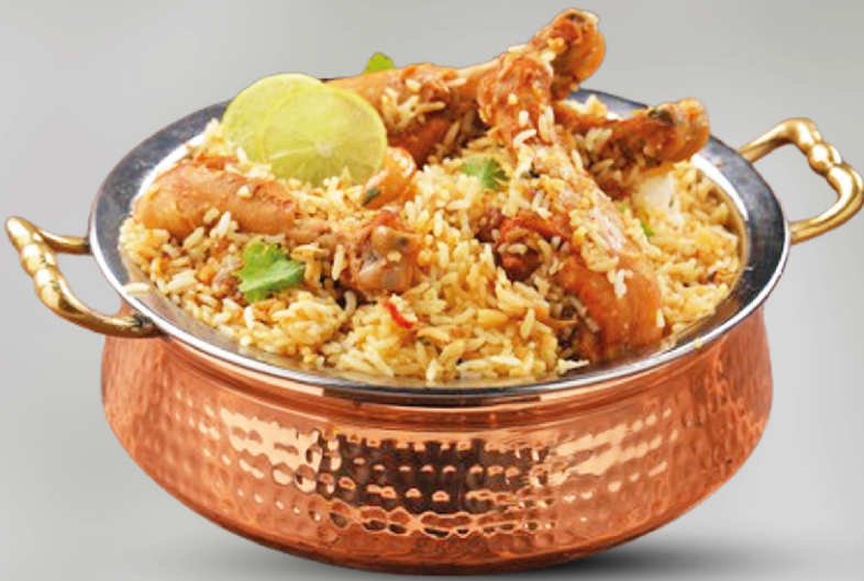
Chicken Biryani 15.00

Not only does your body love a healthy lunch each day, your mind, your sense of wellbeing, and your wallet can benefit too: Have a break. If you take time to eat your packed lunch away from your desk, you are letting your mind and body refresh for an afternoon of work.