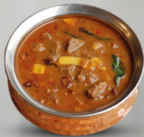
Prawns Masala 22.00