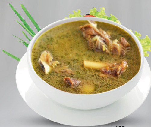
Mutton Soup AED 18