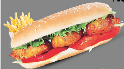
Chicken Fillet Combo