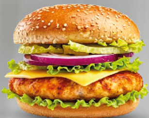
Chicken Burger | AED 12