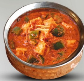
Paneer Kadai 16.00