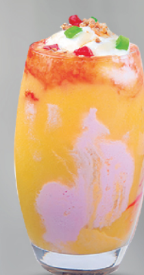
Cocktail Juice | AED 15