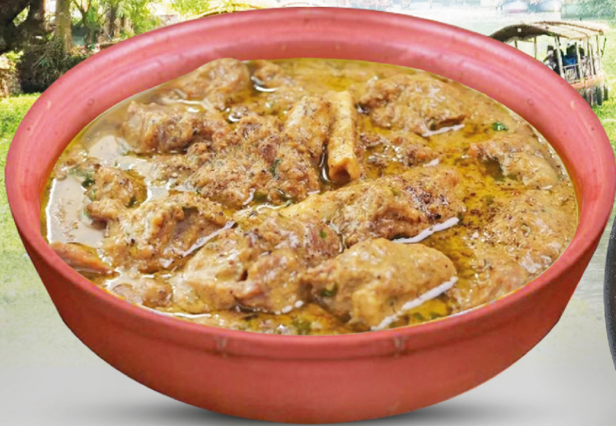
Mutton Kali Mirch Bowl | AED 22