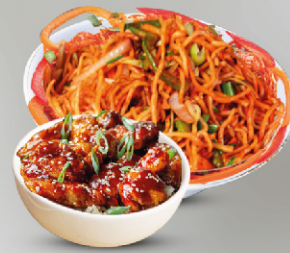
Honey Chicken Shezwan Noodles Combo AED 24