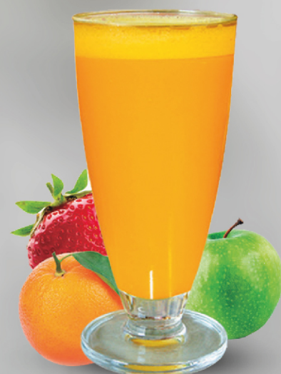
WEIGHT LOSS Strawberry, Orange, Apple | AED 15