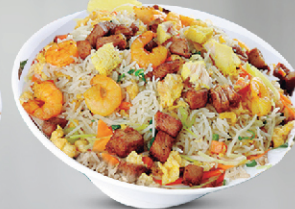
Mix Fried Rice 20.00