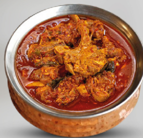
Mutton Masala 18.00