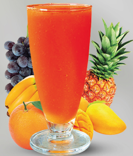
VITAMIN LOAD Pineapple, Mango, Grape, Banana, Orange AED 15