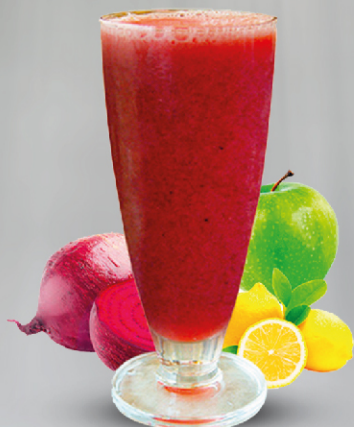
LIVER CURE Beetroot, Apple, Lime | AED 15