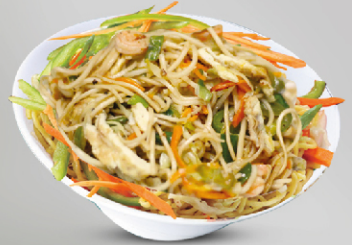
Egg Noodles 16.00