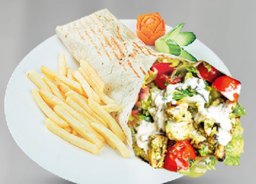
Chicken Avacado Pesto Wrap | AED 15