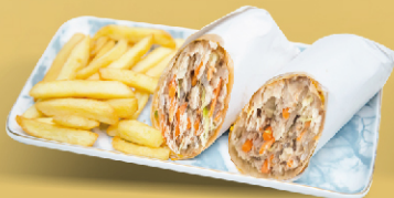
Egg Roll | AED 08