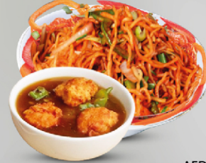
Veg Munchurian Shezwan Noodles Combo AED 22