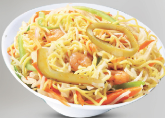
Prawns Noodles 22.00