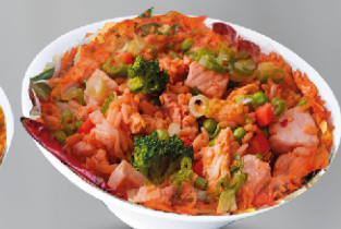
Shezwan Mix Fried Rice 22.00