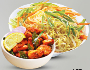
Chicken 65 Noodles Combo AED 24