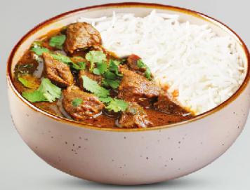
Mutton Kolapur | AED 22 Rice Bowl