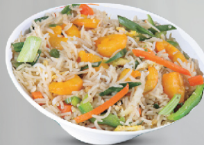
Prawns Fried Rice 18.00