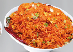
Shezwan Beef Fried Rice 20.00