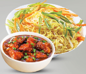
Chilli Paneer Veg Noodles Combo AED 18