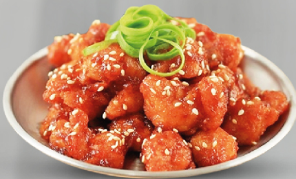
Crispy Honey Chicken 20.00