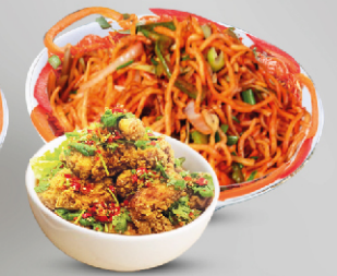
Crispy Corriander Chicken Shezwan Noodles Combo AED 25