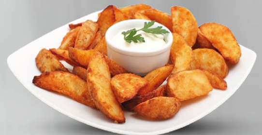
Potato Wedges Big 12.00 Small 8.00