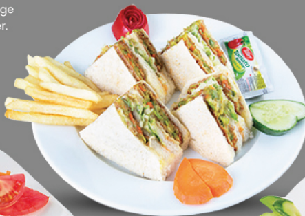
Omlet Sandwich | AED 10