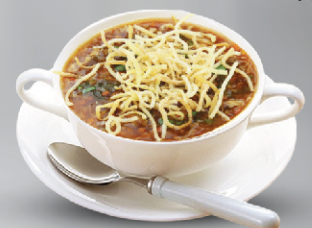
Chicken Munchow Soup AED 16