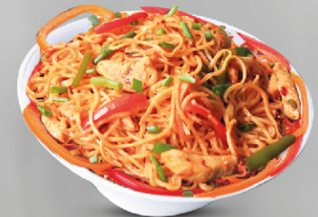
Shezwan Beef Noodles 18.00