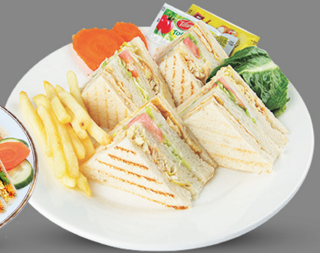
Chicken Sandwich | AED 12