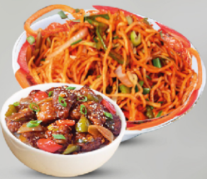
Chicken Chilli Shezwan Noodles Combo AED 24