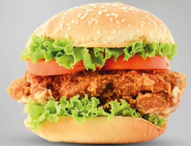
Chicken Fillet Burger | AED 14