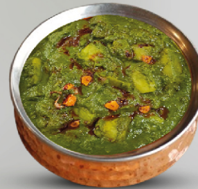
Alu Palak 12.00

Fruit and vegetables are a good source of vitamins and minerals, including folate, vitamin C and potassium. They're an excellent source of dietary fibre, which can help to maintain a healthy gut and prevent constipation and other digestion problems. A diet high in fibre can also reduce your risk of bowel cancer.