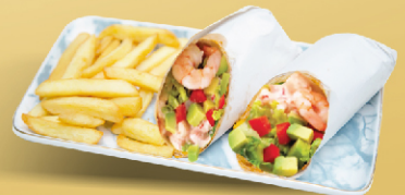
Prawns Roll | AED 14