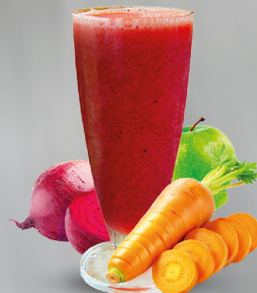
ABC Apple, Beetroot, Carrot | AED 16