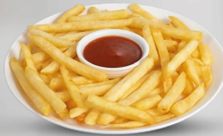
French Fries Big 12.00 Small 8.00