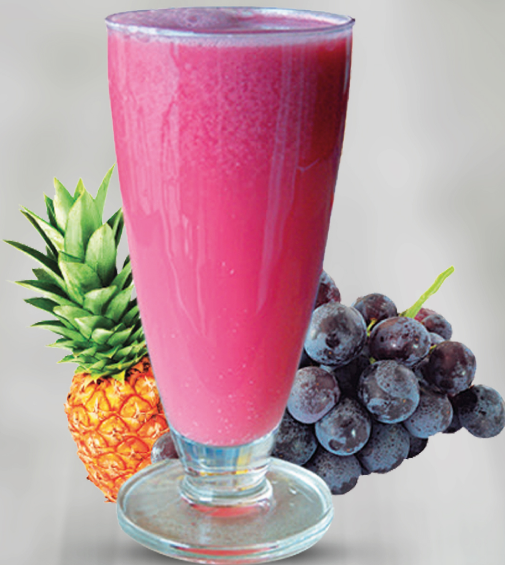
PURPLE PINE Pineapple, Black Grape | AED 15

Juicing can play a role in a balanced diet. For instance, it can help you get fruits and vegetables if you don't enjoy eating them. Juicing also can give the digestive system a rest from digesting fiber. This may help some people who have certain health conditions or who receive certain medical treatments.