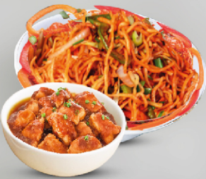
Chicken Munchurian Shezwan Noodles Combo AED 24