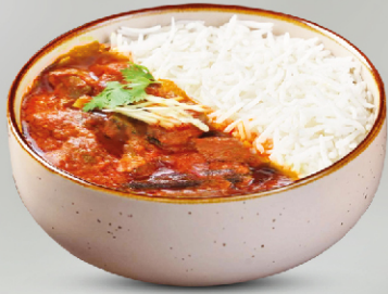
Mutton Kadai | AED 22 Rice Bowl