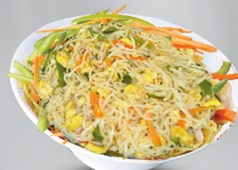
Hakka Egg Noodles 16.00