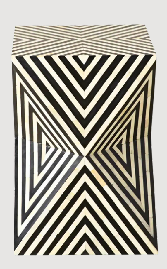
CRAFTED FOR DURABILITY