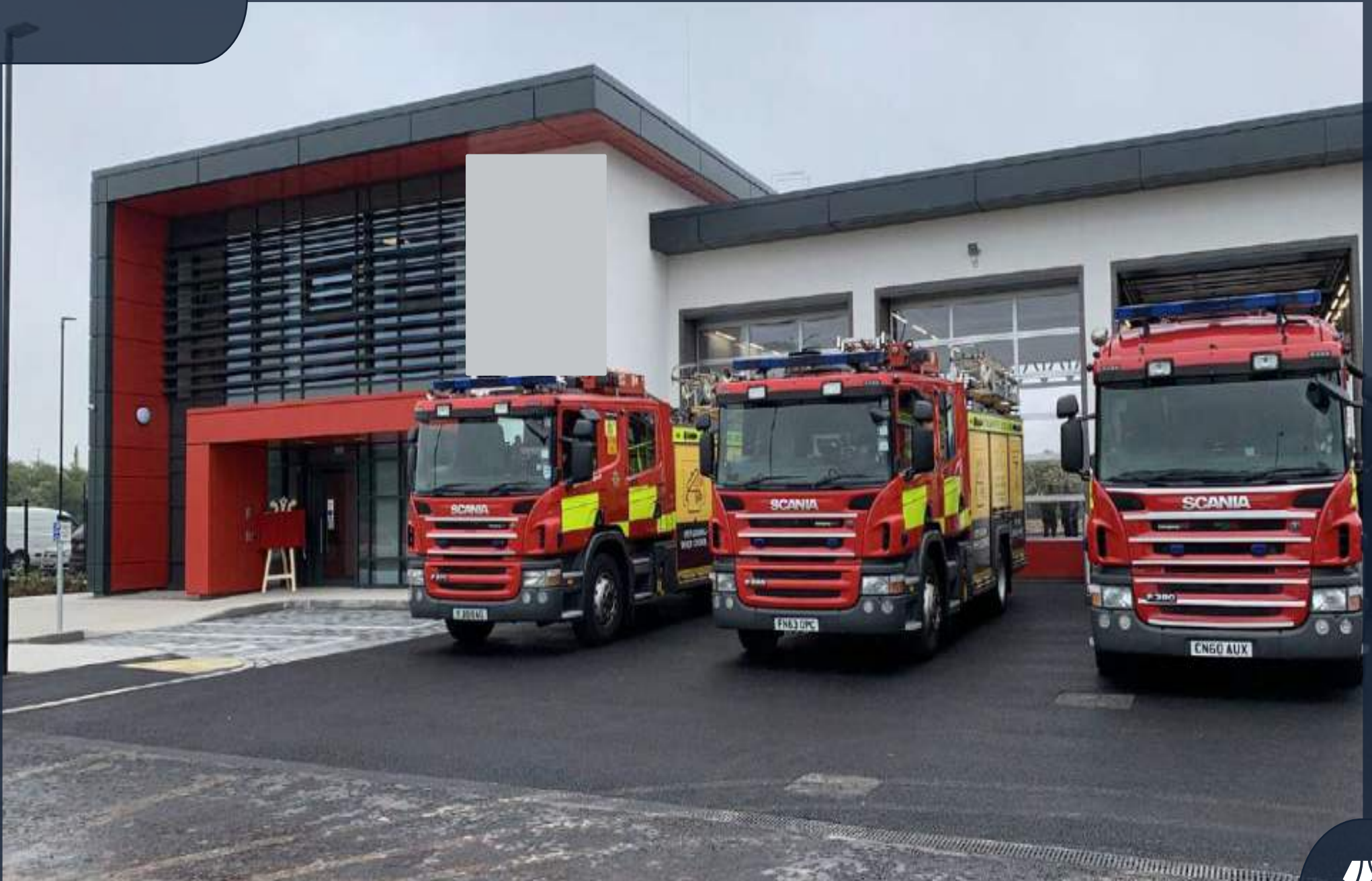
Oil & Gas Plant Fire Station