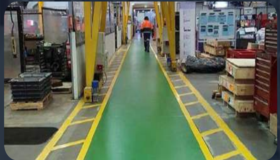
Repair Workshop Building