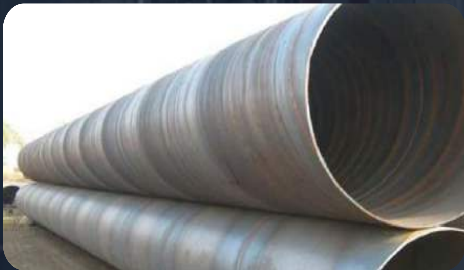
RTR Pipes Internal Lining