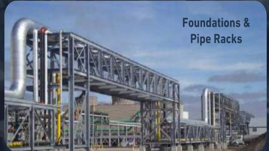
Foundations & Pipe Racks