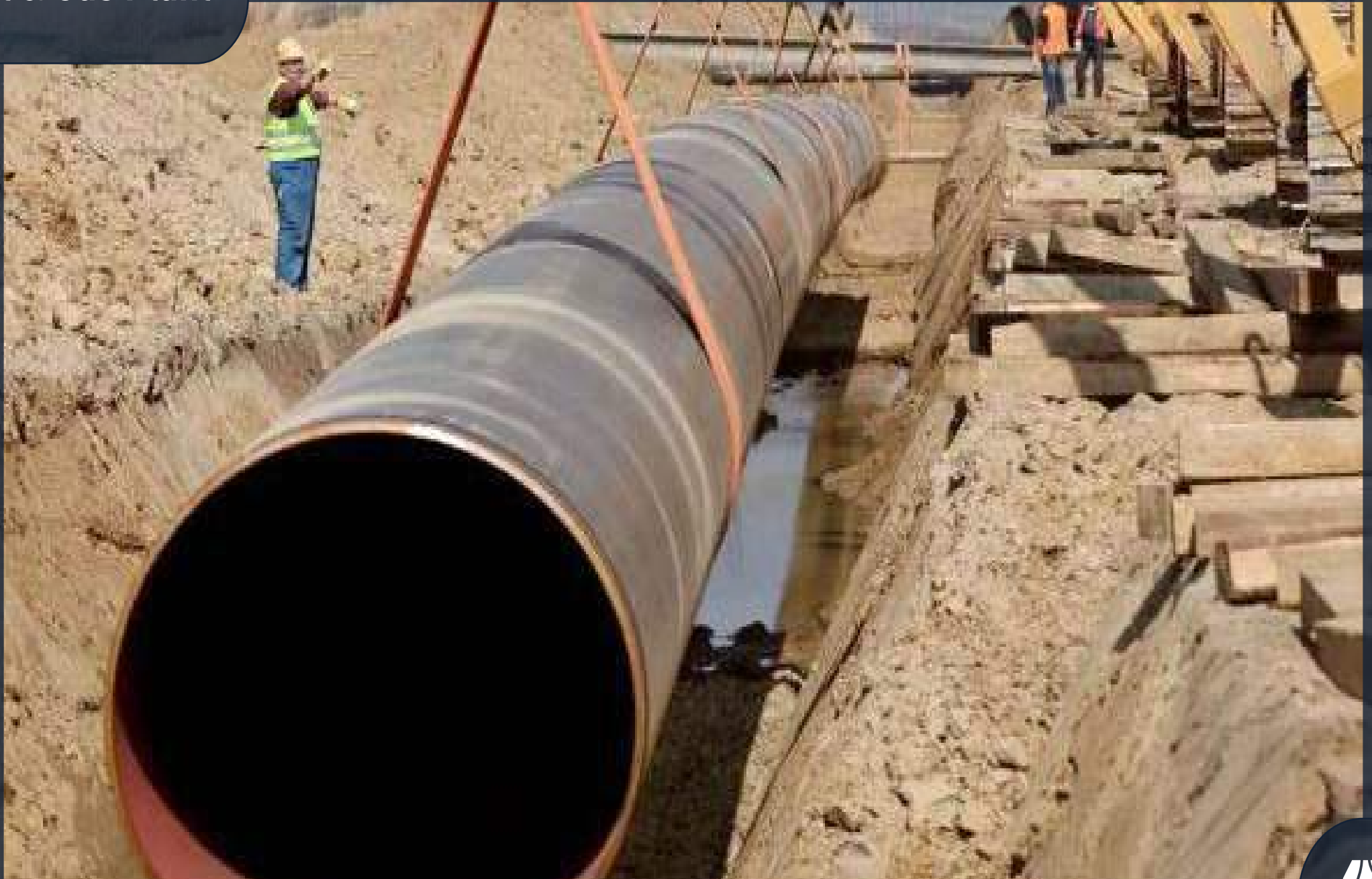
Oil Facilities 60" Dia. RTR Pipes.