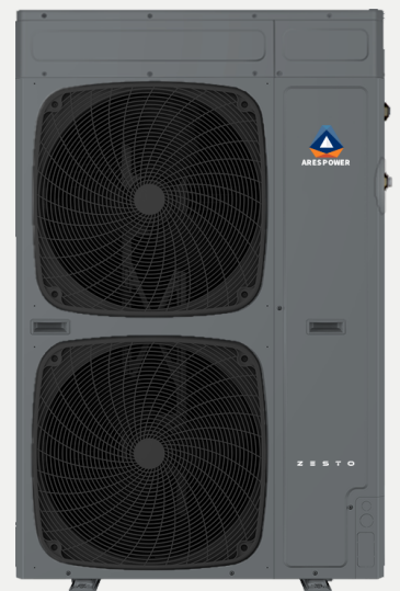
Model MB3 11-16kW