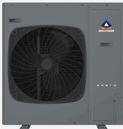
Model MB3 7/8kW