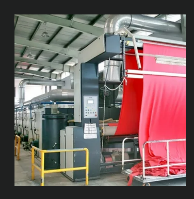
Custom Dyeing & Weaving (on demand)

Small batch samples for quality inspection and feel before large-scale commitment.