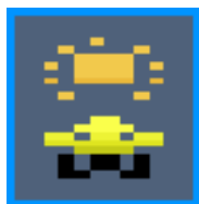
Alien Stealing Gold