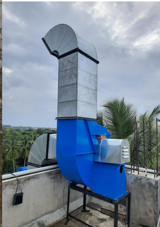
Blower with stand