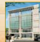
C & B Chambers Commercial, Topsia