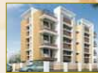
Residential Project, Vidyasagar Street