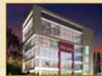
I-Space Mall, Dumdum