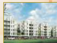
I Space, R B C Road