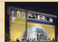
Esplanade Shopping Mall, Ranigang