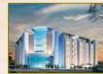
Three Star Hotel, Asansol