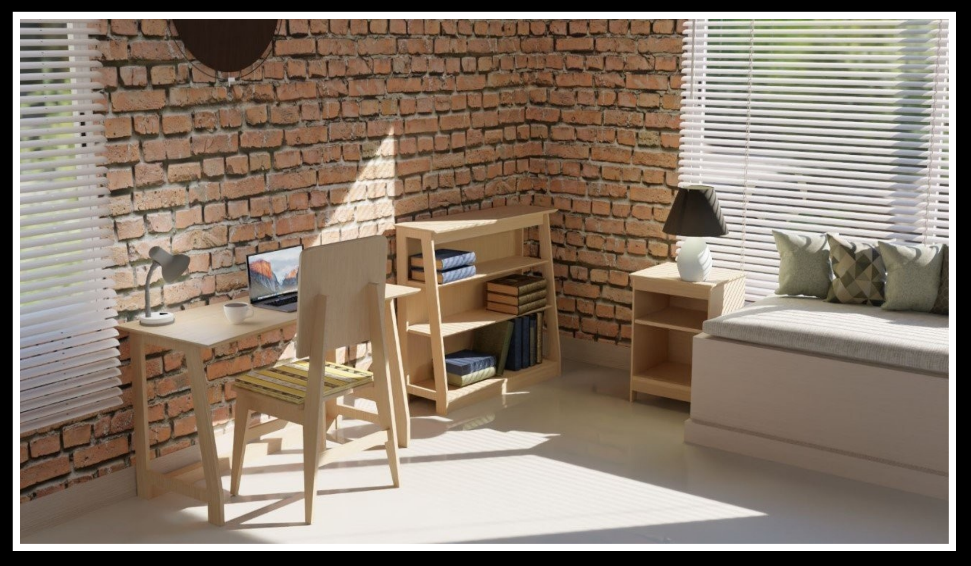
LEAF – Stylish and Assembly and Disassembly in Minutes No Tools Needed, Affordable and Sustainable