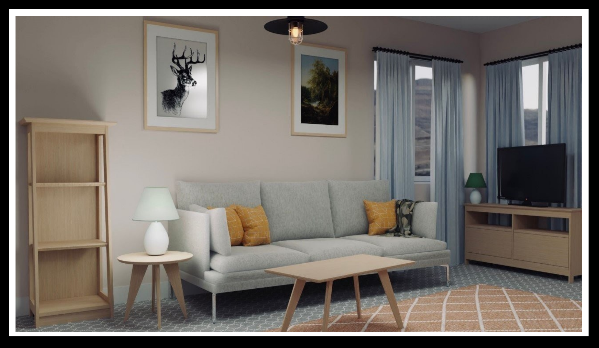
LEAF – Stylish and Assembly and Disassembly in Minutes No Tools Needed, Affordable and Sustainable