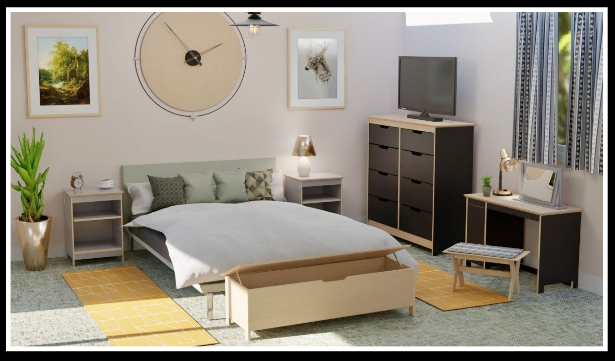
LEAF – Stylish and Assembly and Disassembly in Minutes No Tools Needed, Affordable and Sustainable