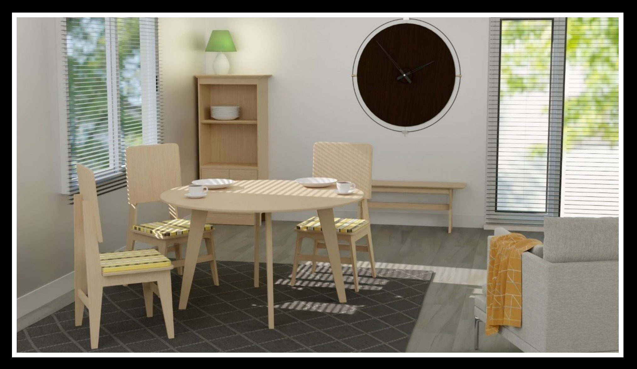
LEAF – Stylish and Assembly and Disassembly in Minutes No Tools Needed, Affordable and Sustainable