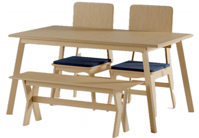
The ALPINE Bench Dining Set: Style Number: LBS/001/25/BB Average Assembly Time: 15 minutes

* The full range of LEAF GREEN designs are available upon request