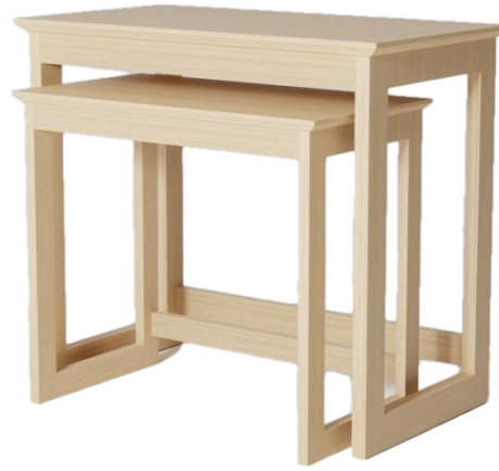
The CORTONA Nest of 2 Tables: Style Number: LTB/003/25/BB Average Assembly Time: 3 minutes