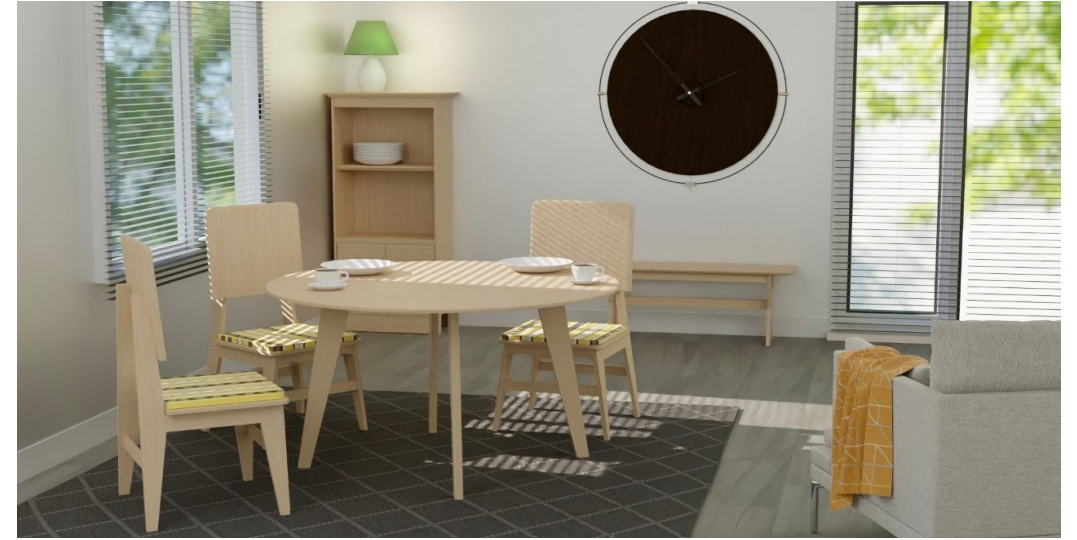
The Alpine Dining Room Range