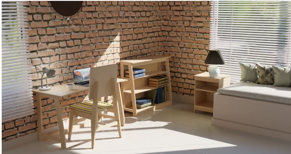
The Davenport Home Office Range