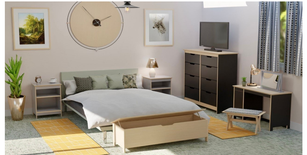
The Sintra Bedroom Range