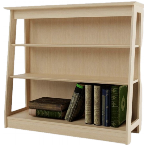
The DAVENPORT Low Style Bookcase: Style Number: LBK/001/25/BB Average Assembly Time: 4 minutes