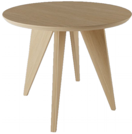
The CORTONA Round Top Side Table: Style Number: LTB/001/25/BB Average Assembly Time: 45 seconds