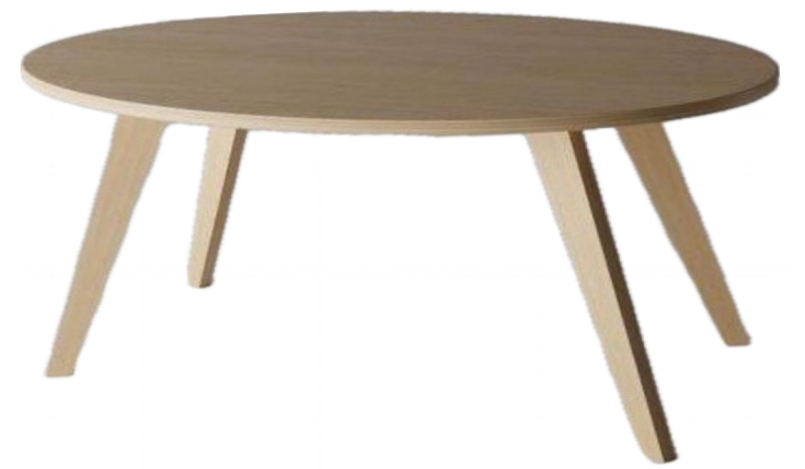
The CORTONA Oval Top Coffee Table: Style Number: LTB/006/25/BB Average Assembly Time: 3 minutes