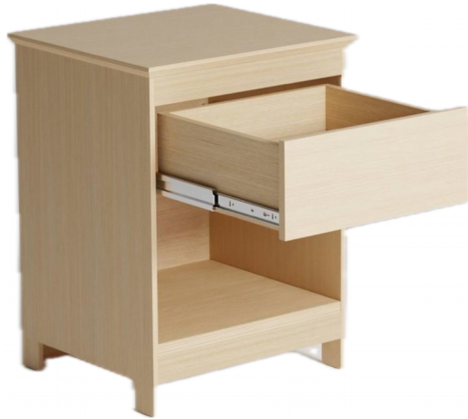
The SINTRA Top Drawer Bedside Cabinet: Style Number: LBC/001/25/BB Average Assembly Time: 7 minutes