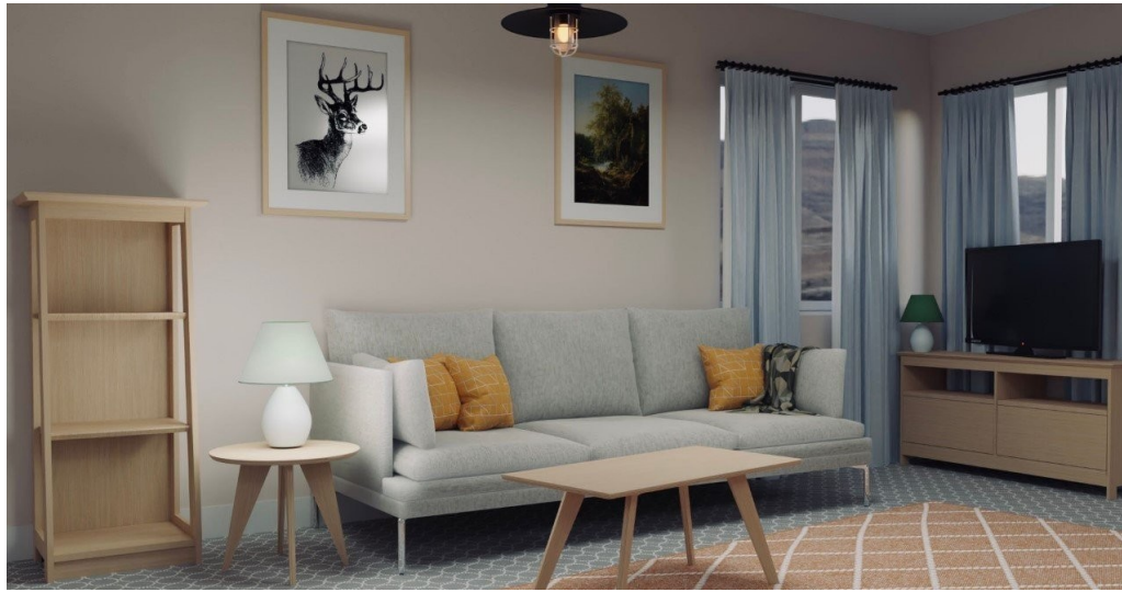
The Cortona Sitting Room Range