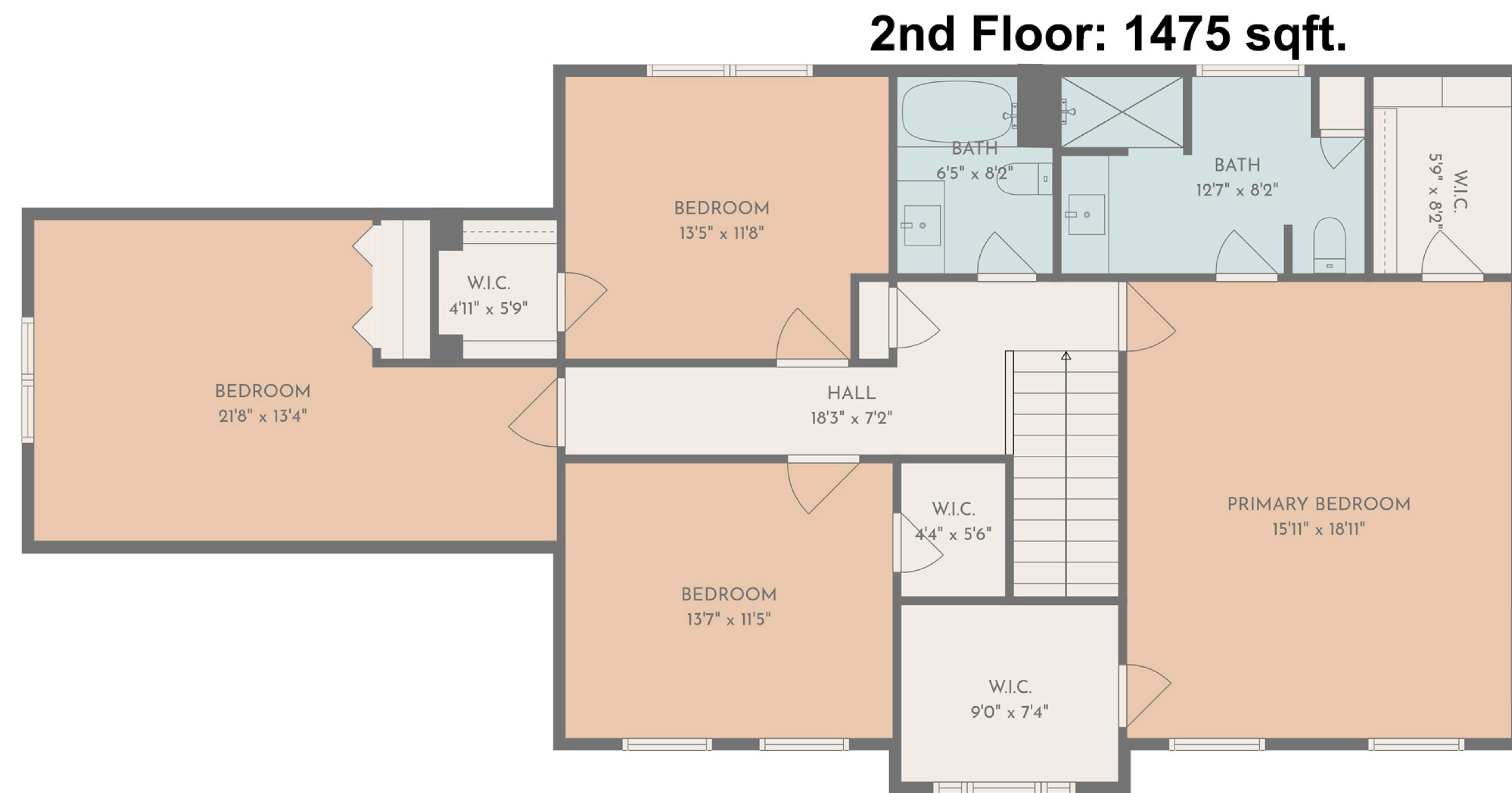
2nd Floor: 1475 sqft.