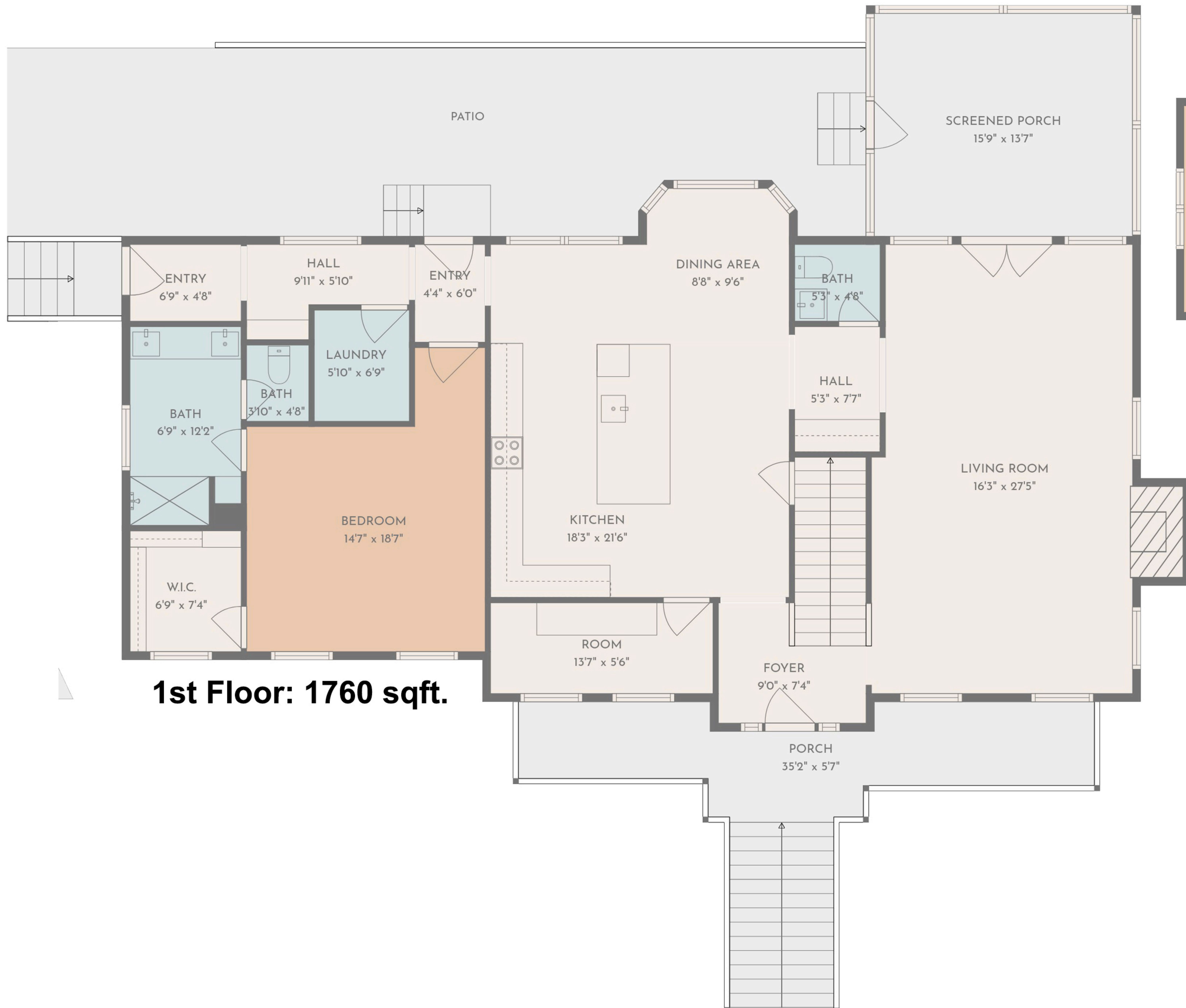
1st Floor: 1760 sqft.