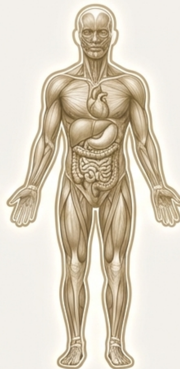
DEVELOPED THROUGH GROWTH