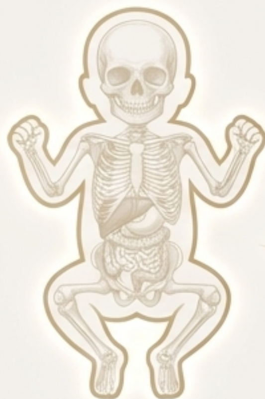
COMPLETE AT BIRTH