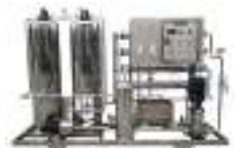
1000 LPH FULLY SS RO PLANT