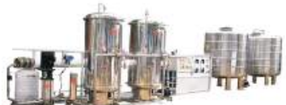
PACKAGED DRINKING WATER PLANT

Water is the most important & useful element on Earth. Human being can not remain fit & healthy without pure & safe drinking water. With rising of Industrialization and growing population, the purity of the drinking water is at threat. As People became more and more health conscious and taking extra precautions for water born diseases, demand for mineral water is increasing at very fast pace. Bottled water Industry, colloquially called, the mineral water industry, is a symbol of new life style of emerging India. Packaged mineral water is the perfect and economical solution. Here comes the need for mineral water plant. Mineral water industry has tremendous potential to grow and has very bright future (currently growing at 30% a year).