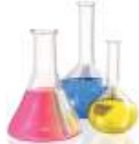
RO PLANT CHEMICALS Anti-Scalant, PH & Membrane Wash