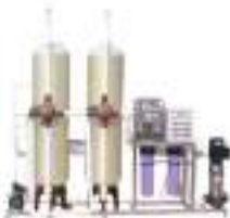
RO PLANT UPTO 10000 LPH