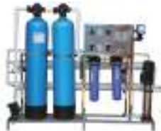
1000 LPH FRP RO PLANT