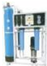
250 LPH RO