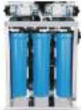
50 LPH RO