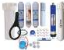
DOMESTIC RO SPARES