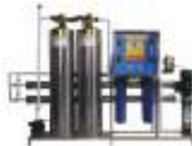
1000 LPH SEMI SS RO PLANT