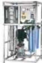
100 LPH RO