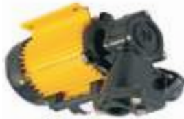
ROW WATER PUMP