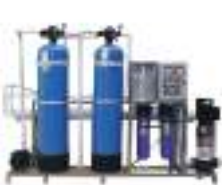
500 LPH RO PLANT