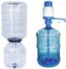
PET JAR & DISPENSER