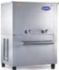
COOL & NORMAL WATER DISPENSER