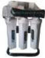
25 LPH RO