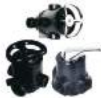
MULTI PORT VALVE