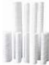
MICRON FILTER SPUN