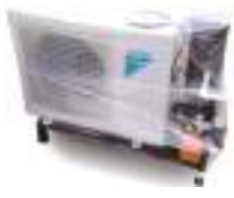
ONLINE & OFFLINE WATER CHILLER