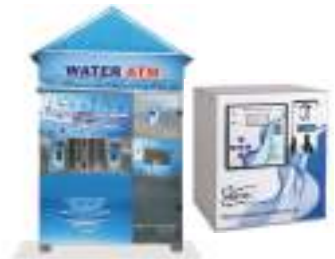
WATER VENDING MACHINE