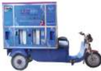
MOBILE WATER ATM