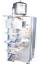
POUCH PACKAGING MACHINE