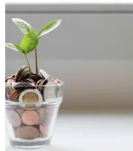
Resource mobilisation and fundraising