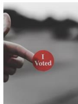
Healthy and participatory democracy