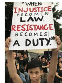
Advocacy, local governance and community mobilising