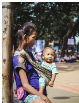
Women's health, rights and empowerment

Addressing the most important development priorities identified by and with the NGOs, CBOs and communities in the global south, we work in 5 issue areas: