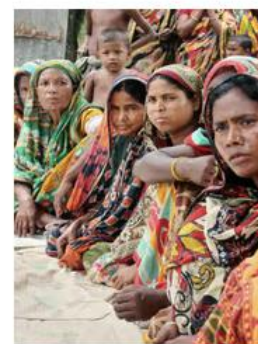
Using and generating research and data for evidence-based social norm change