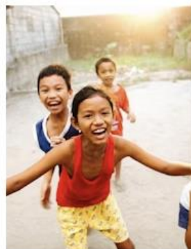
Violence-free households and communities