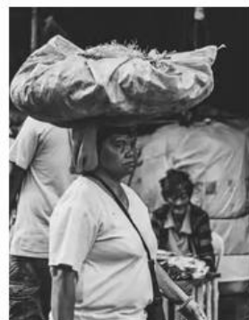
Community well-being and poverty alleviation