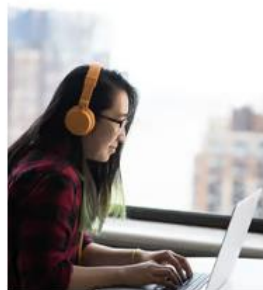
Project management, financial management and increasing organisation effectiveness

With a focus on women's rights organisations and community-based organisations (CBOs) in the global south, we aim to strengthen institutional capacities in 5 skill areas :