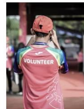
Community philanthropy and volunteerism