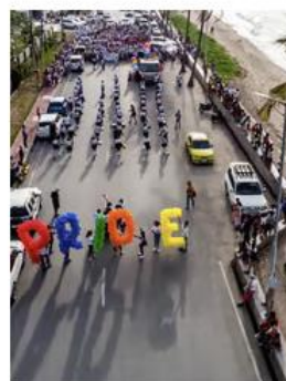
Gender analysis, mainstreaming and inclusion strategy development