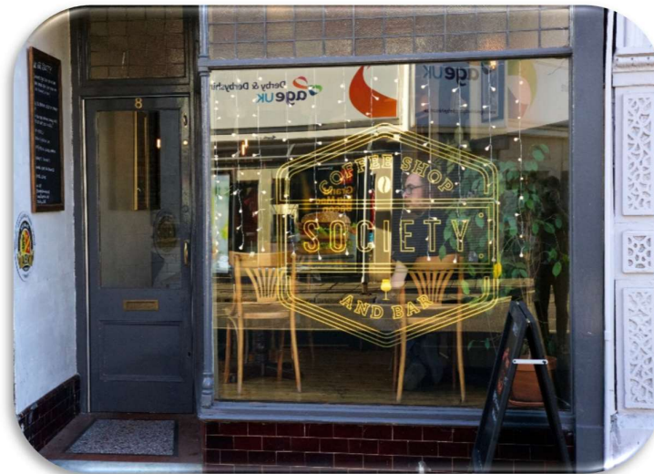
Society Coffee Shop and Bar

Society Coffee Shop and Bar | www.facebook.com/societychesterfield