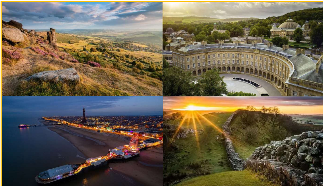
TL Clockwise: Curbar Edge, Buxton Spa Town, Hadrian's Wall, Blackpool

During your visit you can take in the breathtaking walks and views of the Peak District, from the scenery of Curbar Edge to the ancient spa town of Buxton.