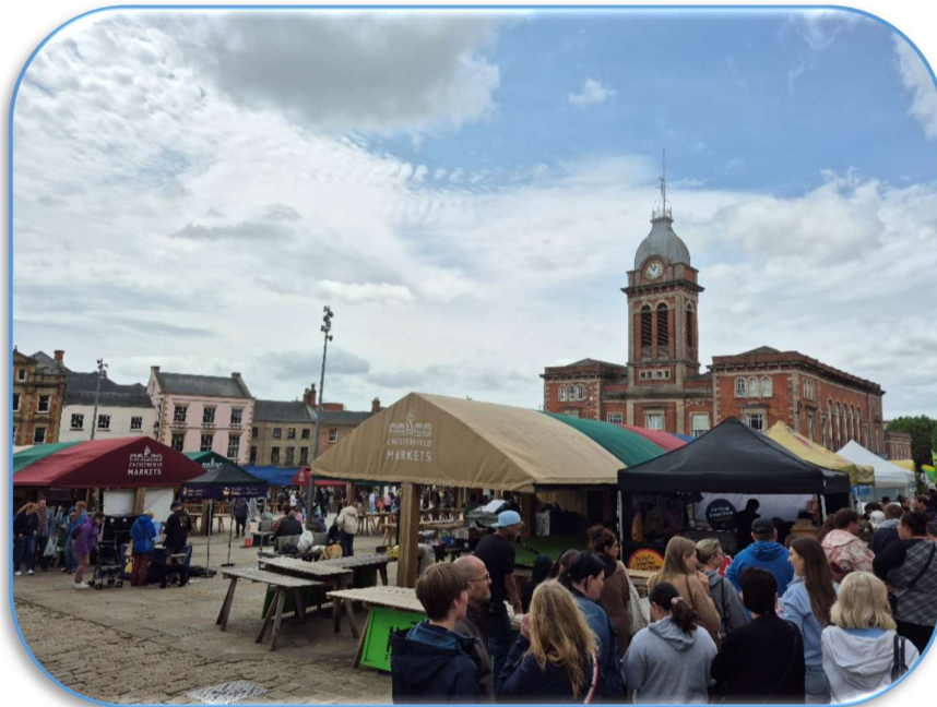
Chesterfield Market Square

Chesterfield itself has a rich history dating back to its market charter in 1594 and then all the way back to the construction of the 'Crooked Spire' church in 1234. Archaeologists have even found buildings forming a crossroads dating back to a few years BC underneath what is now the town centre.