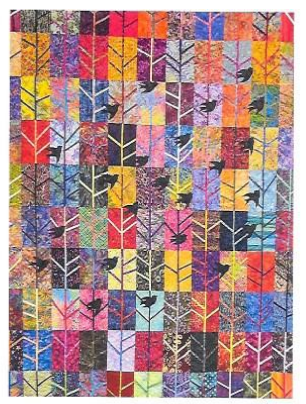
"Enchanted Forest" Size 90" x 94"