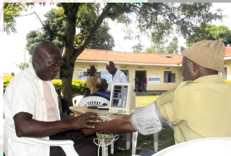
SCREENING FOR HYPERTENSION