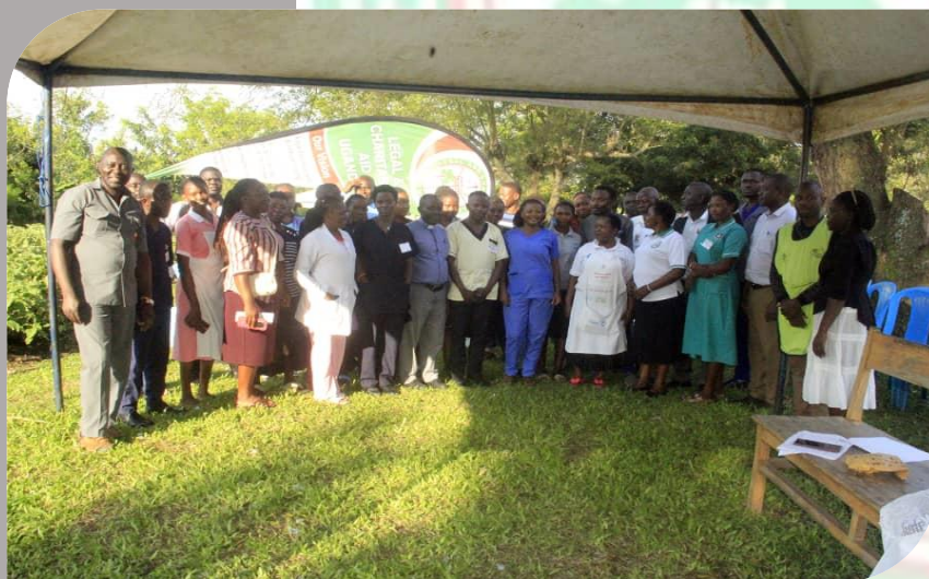
TEAM OF HEALTH WORKERS DURING THE CAMP