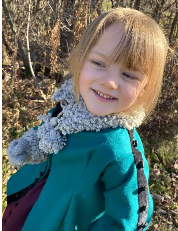
Look into the Historical Pattern