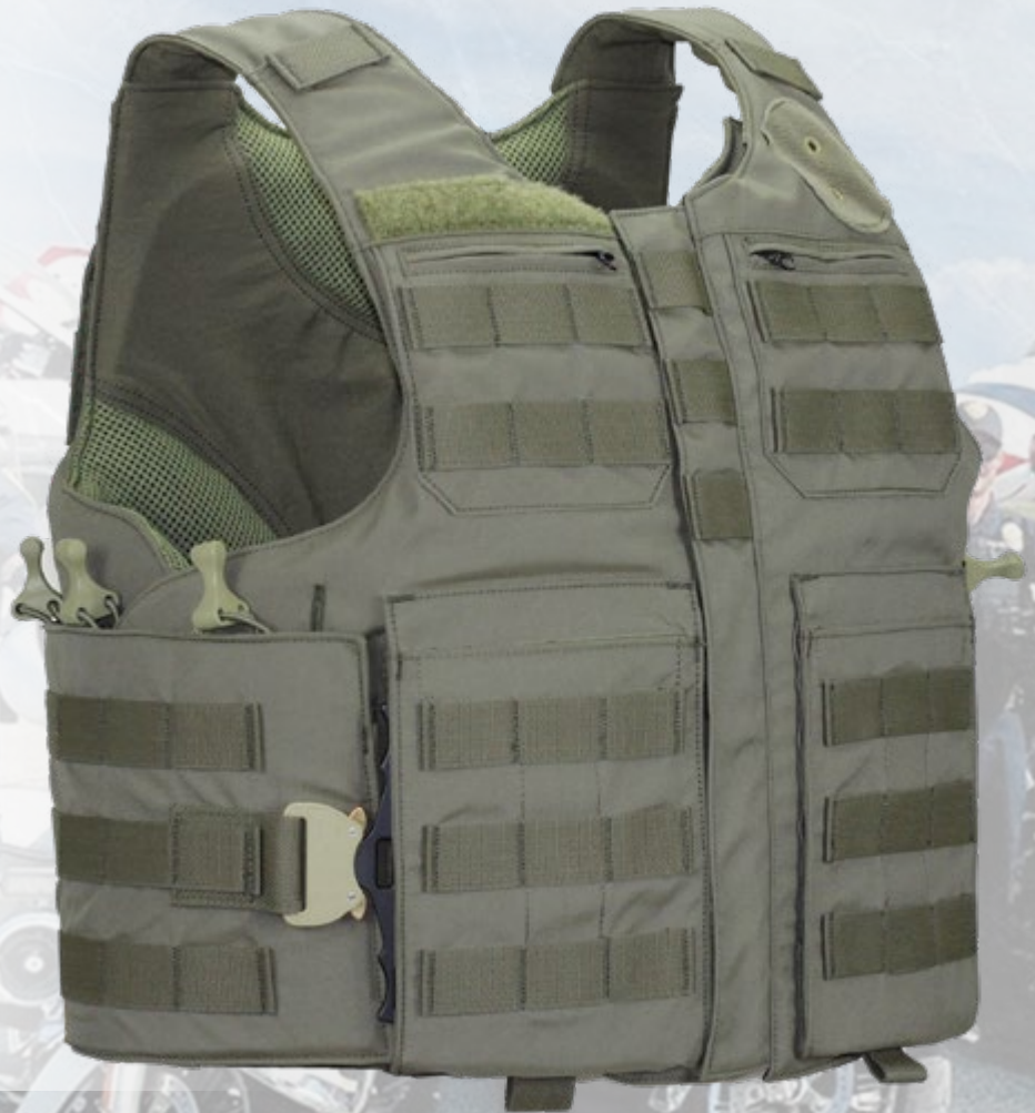
U-ZIP MOLLE WITH AUSTRIALPIN BUCKLE