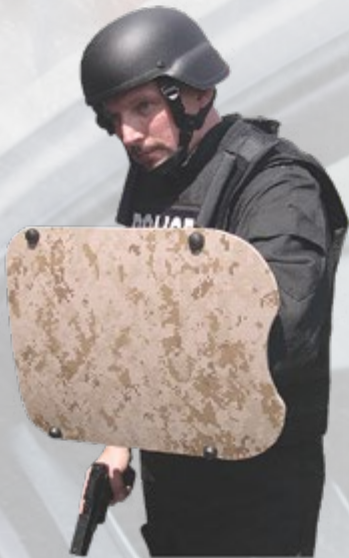
Military Combat Shield IIIA Size: 14" x 16" Pistol rated option only Click Here to Learn More