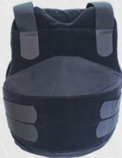
Six Point Adjustable Concealable