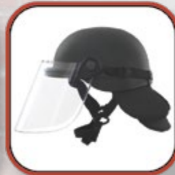
Riot Nape Protector