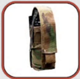
Single Flash Bang Pouch

Our extensive line of load bearing pouches are unparalleled in craftsmanship and are superior in construction. United Shield pouches are designed to optimize longevity, durability, weight, and comfort, while ensuring equipment stability under the most severe conditions.