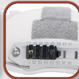
Picatinny Rail Adapter