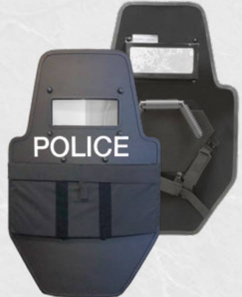
Pistol rated IIIA ERT 24"x 36" with viewport, ERT handle and Level III Upgrade Panel