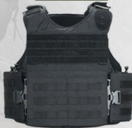
UPT MOUNTAIN CAC WITH DUAL AUSTRIALPIN BUCKLES