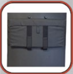
Rifle Upgrade Panel