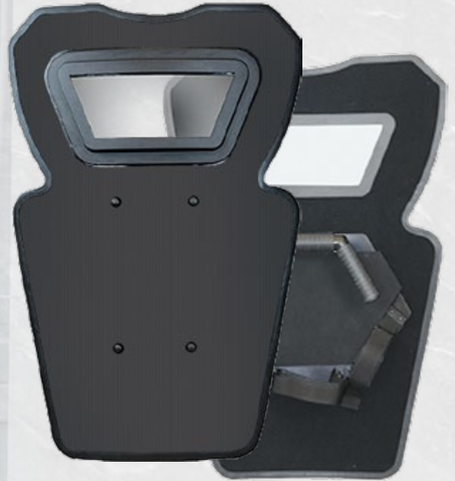
Pistol rated LW IIIA RRS 24" x 36" MXV viewport and ERT handle