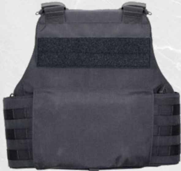
UPT MOODY REAR *

* All UPT Moody carriers utilize the same rear design