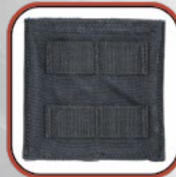
MOLLE Camera Mount