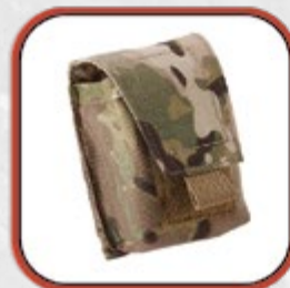
Stacked Handcuff Pouch