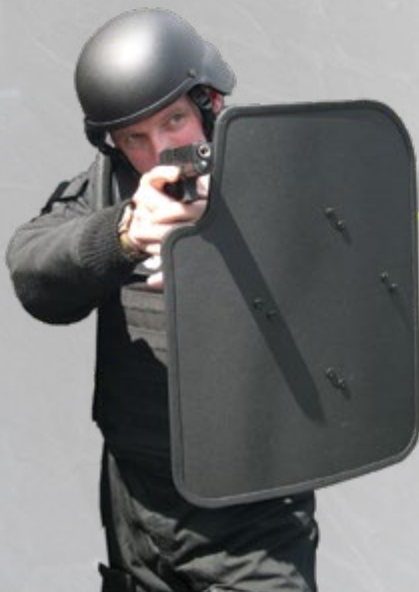
Police Tactical IIIA Size: 16" x 20" Pistol and rifle rated options Click Here to Learn More