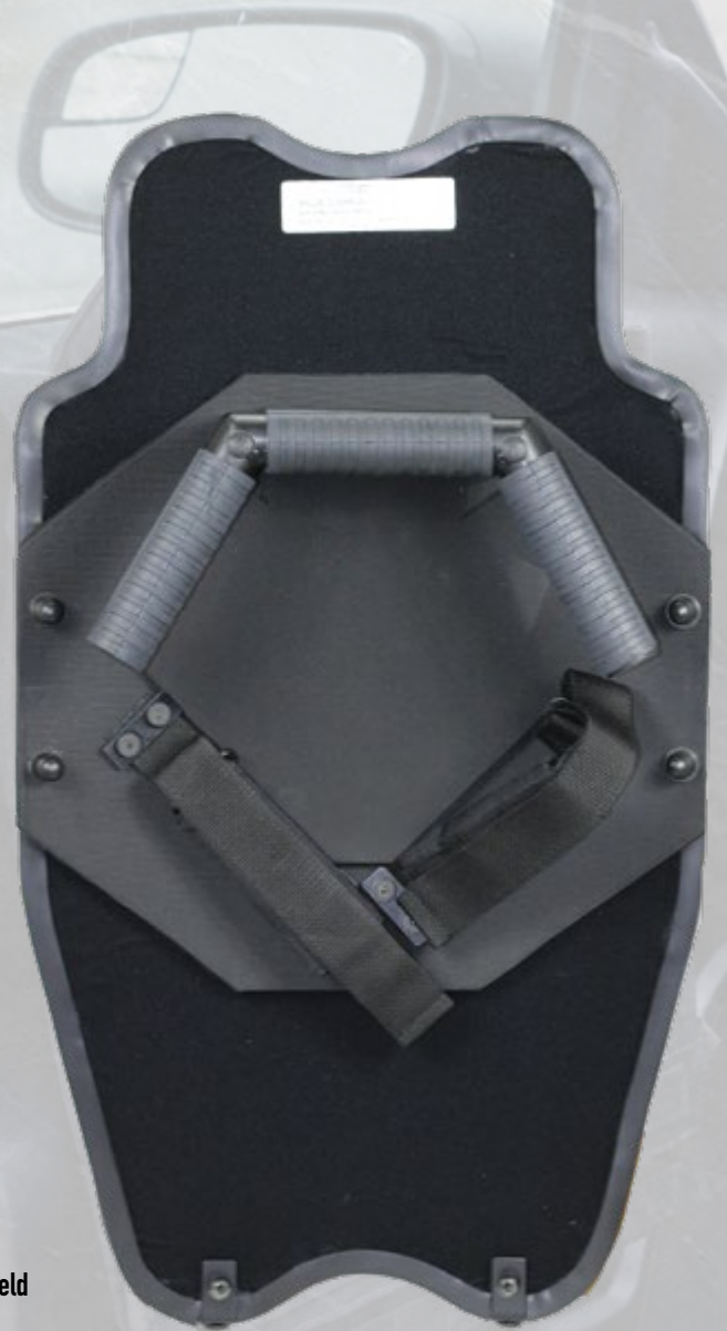
Rifle rated LW III+ 15.75" x 27.5" RDS shield and ERT handle