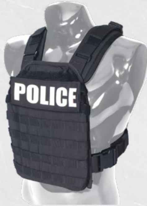
United Shield Plate Rack