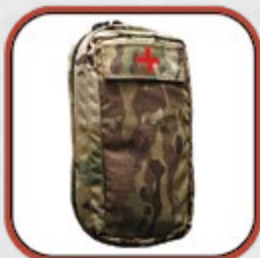
Zipper Medical Pouch