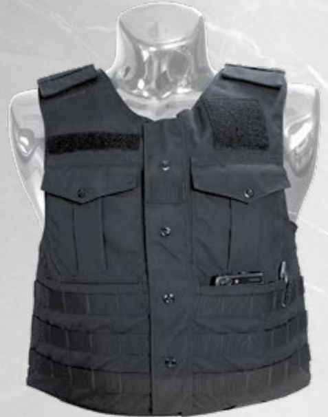
Uniform Zip Carrier