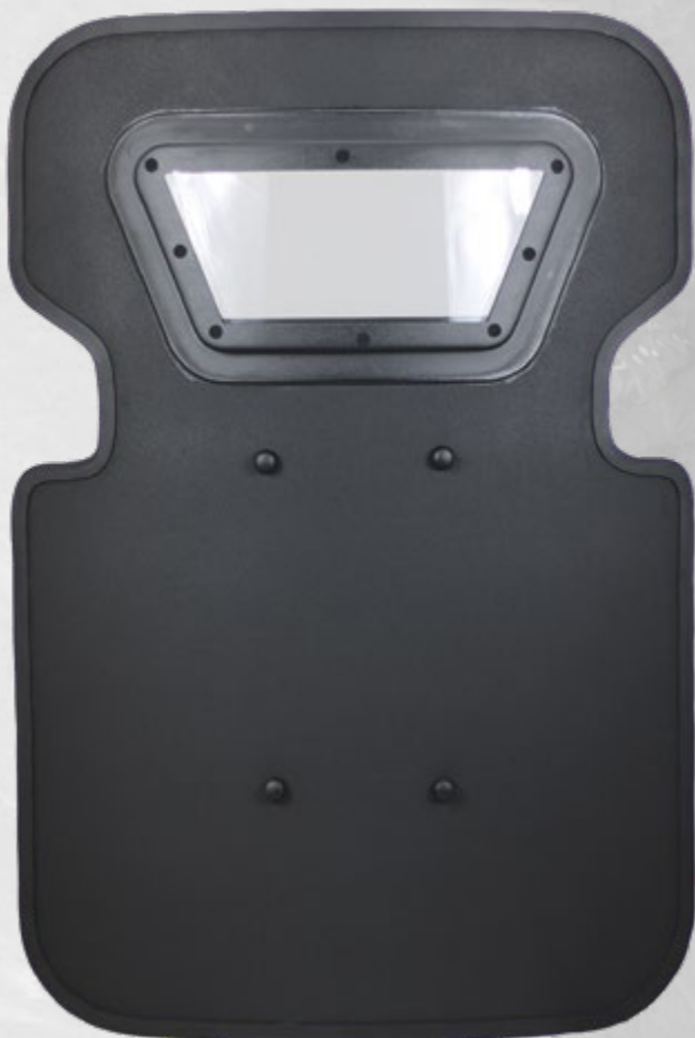
Pistol rated LW IIIA Assault 24"x 36" with MXV viewport and ERT handle