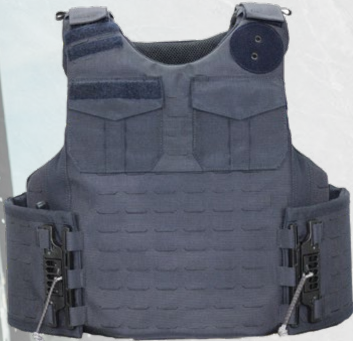
UPT PATROL LASER CUT SHOWN WITH ASPETTO BUCKLES