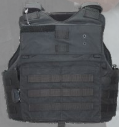
UPT MOODY LC SHOWN WITH SINGLE AUSTRIALPIN BUCKLE WITH MAZ