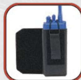
UPT Radio Pouch