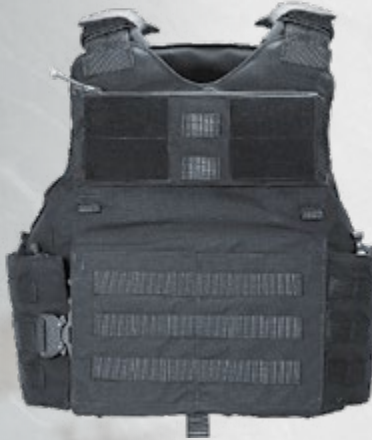
UPT MOODY BC SHOWN WITH SINGLE AUSTRIALPIN BUCKLE WITH MAZ