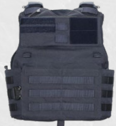
UPT MOODY SV SHOWN WITH SINGLE AUSTRIALPIN BUCKLE WITH MAZ