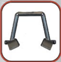
New York Tri-Grip Handle