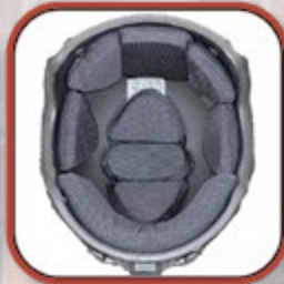
4D Rogue Pad Set