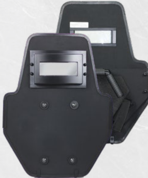
Rifle Rated LW III+ ERT Mini 24"x 30" with viewport and ERT handle