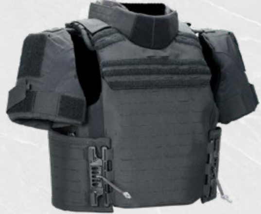
UPT MOLLE LASER CUT SHOWN WITH DUAL ASPETTO BUCKLES