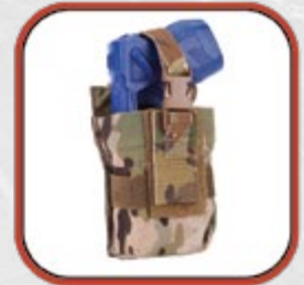
SR Buckle x 2 Taser® Holster