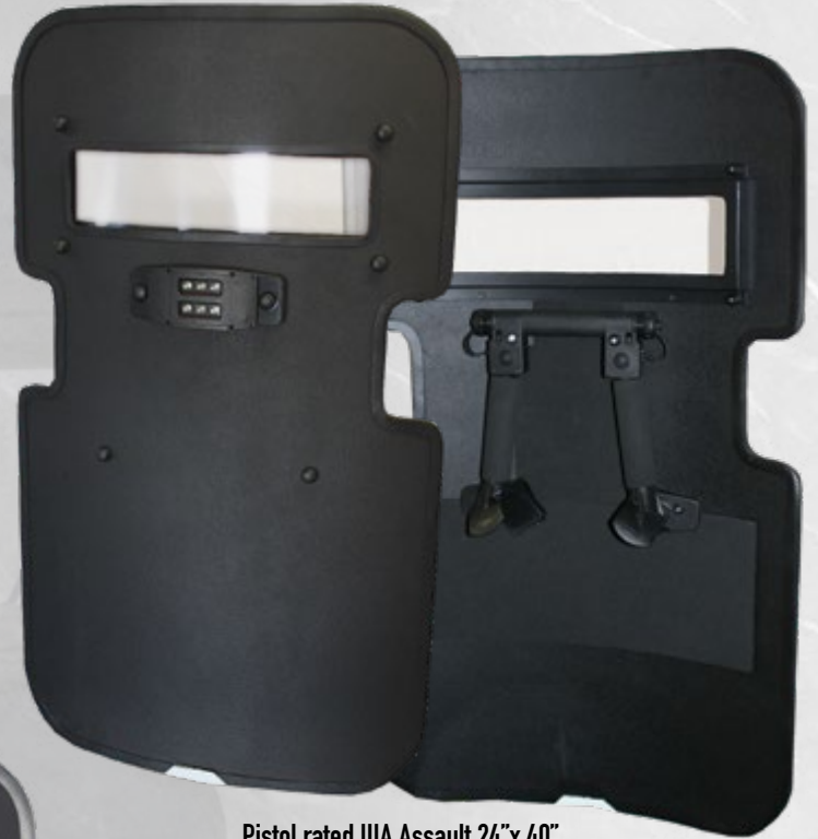
Pistol rated IIIA Assault 24" x 40" with viewport Assault handle and LCOA light assembly