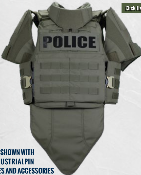
ARK PC SHOWN WITH DUAL AUSTRIALPIN BUCKLES AND ACCESSORIES