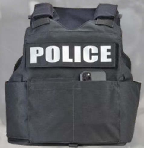
UPT SLICK SHOWN WITH HOOK AND LOOP CLOSURE