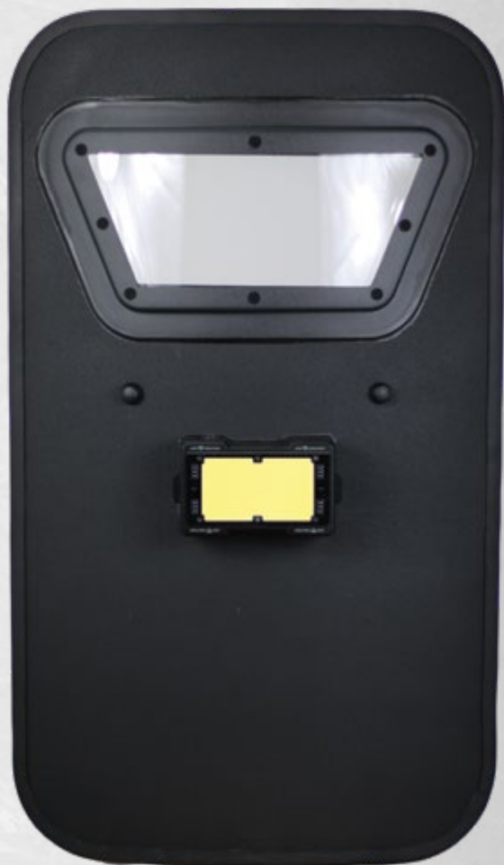
Pistol rated Level IIIA Standard 20" x 34" with MXV viewport Horizontal handle and wireless Specter Gen II LED