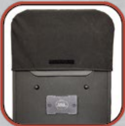
Half Shield Cover