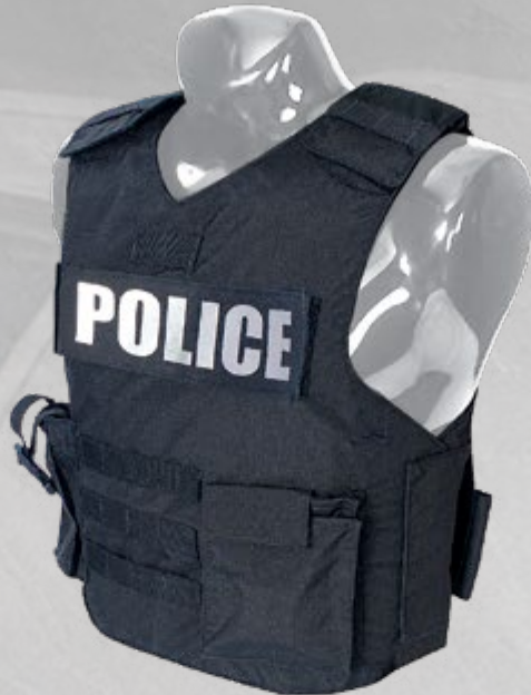
Standard Crossover Carrier