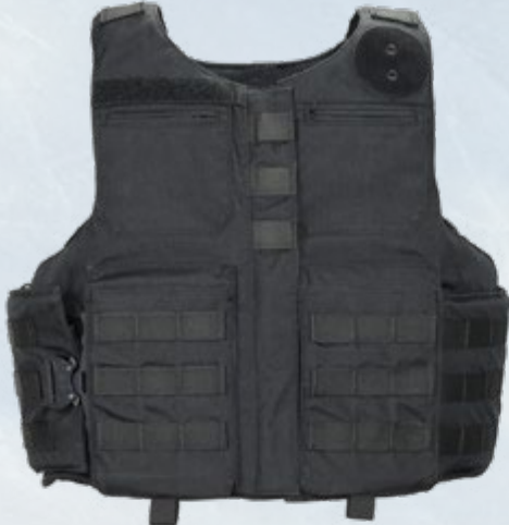
U-ZIP HIGHLAND SHOWN WITH SINGLE AUSTRIALPIN BUCKLE