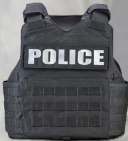
UPT MOLLE SHOWN WITH HOOK AND LOOP CLOSURE