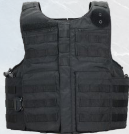
U-ZIP MOLLE SHOWN WITH SINGLE AUSTRIALPIN BUCKLE