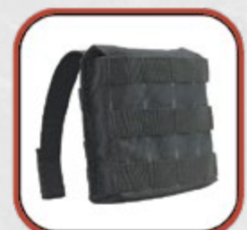
MOLLE Side Rifle Plate Pocket