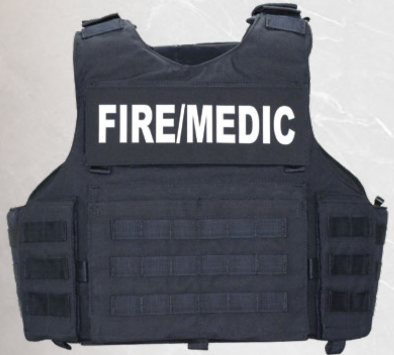
UPT TURNOUT G-HOOK ADJUSTMENT EXPANDED TO 72" SHOWN WITH HOOK AND LOOP CLOSURE