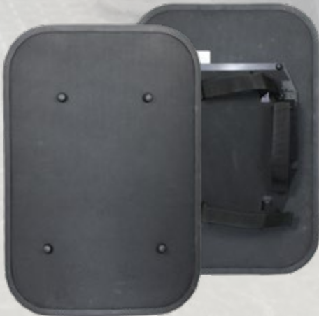
Pistol rated IIIA Standard Micra 18"x 26"