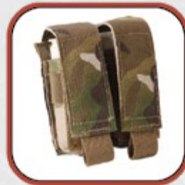
Double 37-40mm Pouch