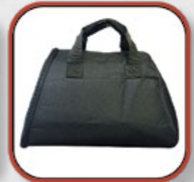
Helmet Carry Bag