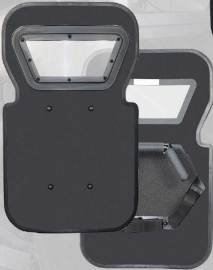
Pistol rated LW IIIA Assault 20" x 34" with MXV viewport and ERT handle