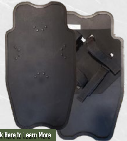
Click Here to Learn More Rapid Deployment Shield (RDS) LW IIIA Size: 15.75" x 27.5" Pistol and rifle rated options