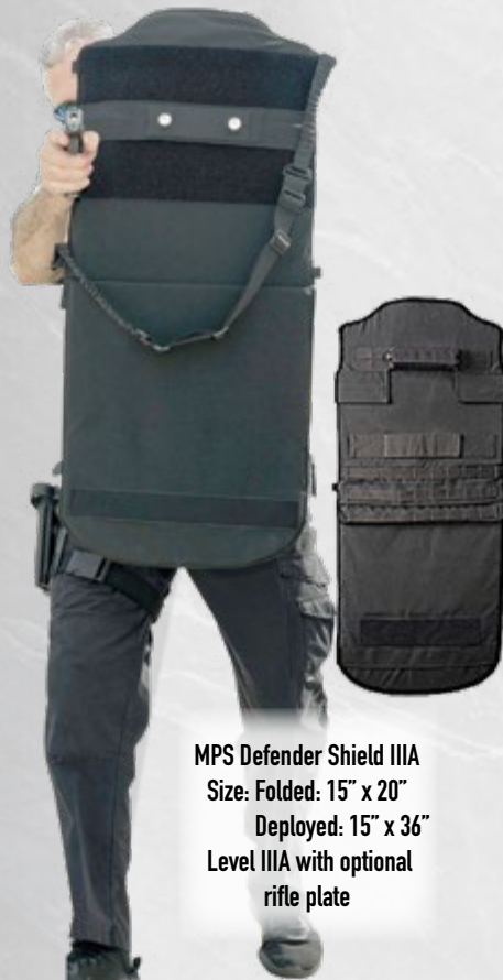
MPS Defender Shield IIIA Size: Folded: 15" x 20" Deployed: 15" x 36" Level IIIA with optional rifle plate Click Here to Learn More