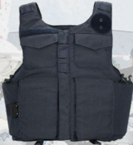
U-ZIP UNIFORM SHOWN WITH SINGLE AUSTRIALPIN BUCKLE