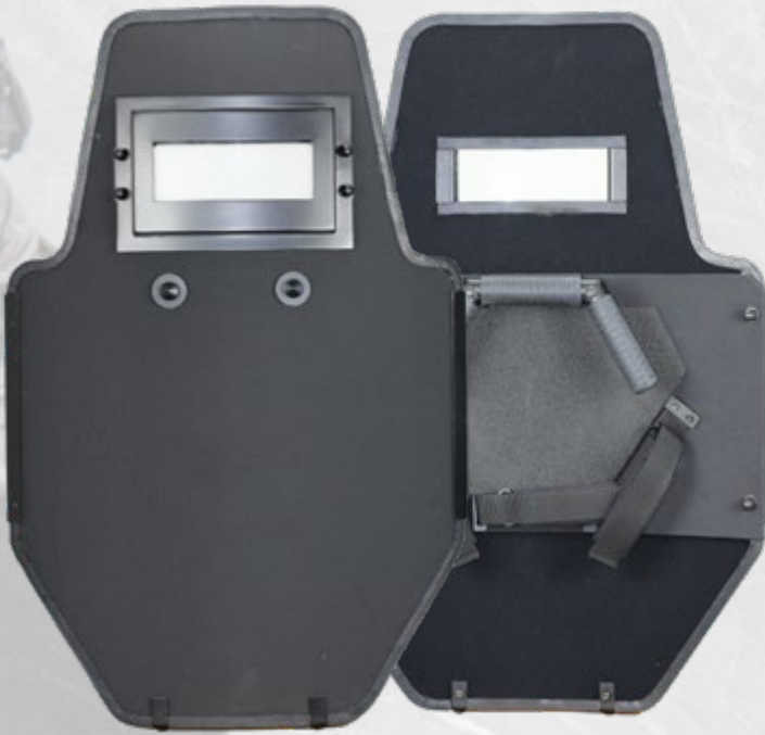
Rifle rated LW III+ ERT 24"x 36" with viewport and ERT handle