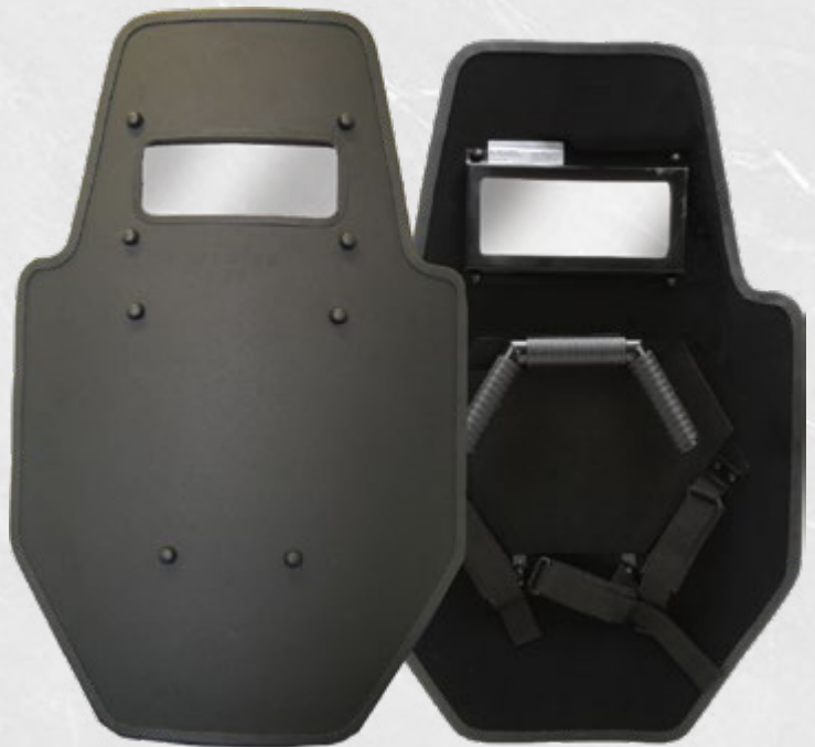
Pistol rated LW IIIA ERT 24"x 36" with viewport and ERT handle