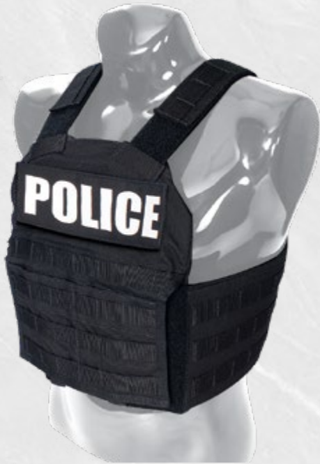
US Plate Carrier