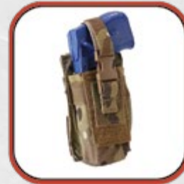
SR Buckle Taser® Holster