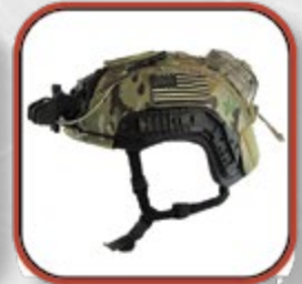
Gen4 Helmet Cover