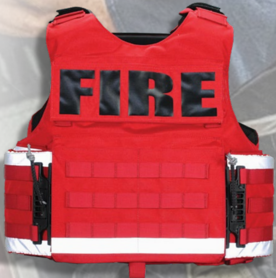
UPT TURNOUT HI-VIS OPTION SHOWN WITH DUAL ASPETTO BUCKLES