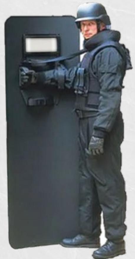
Pistol rated IIIA Standard 24"x 48" with viewport and International handle