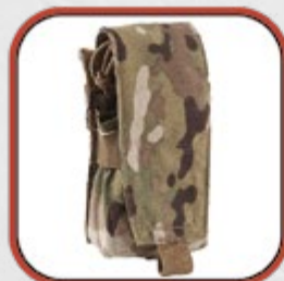
Tiered Rifle Mag Pouch