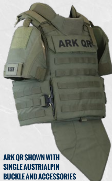
ARK QR SHOWN WITH SINGLE AUSTRIALPIN BUCKLE AND ACCESSORIES