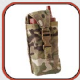
Single Buckle Radio Pouch