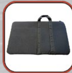
Shield Carry Bag