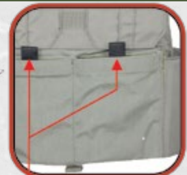
Easy Open Pockets (EOP)