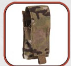
Single Rifle Mag Pouch