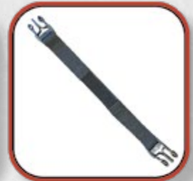
Gas Mask Extender Strap