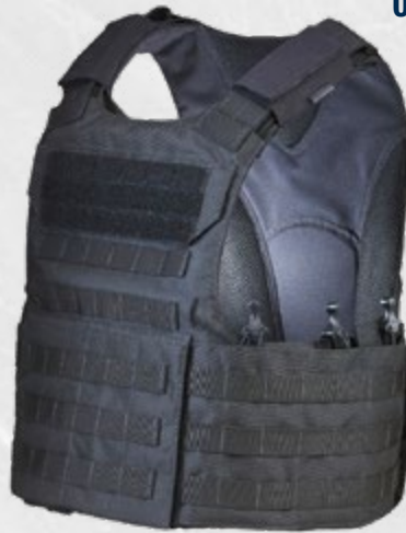
ARK TV SHOWN WITH HOOK AND LOOP CLOSURE