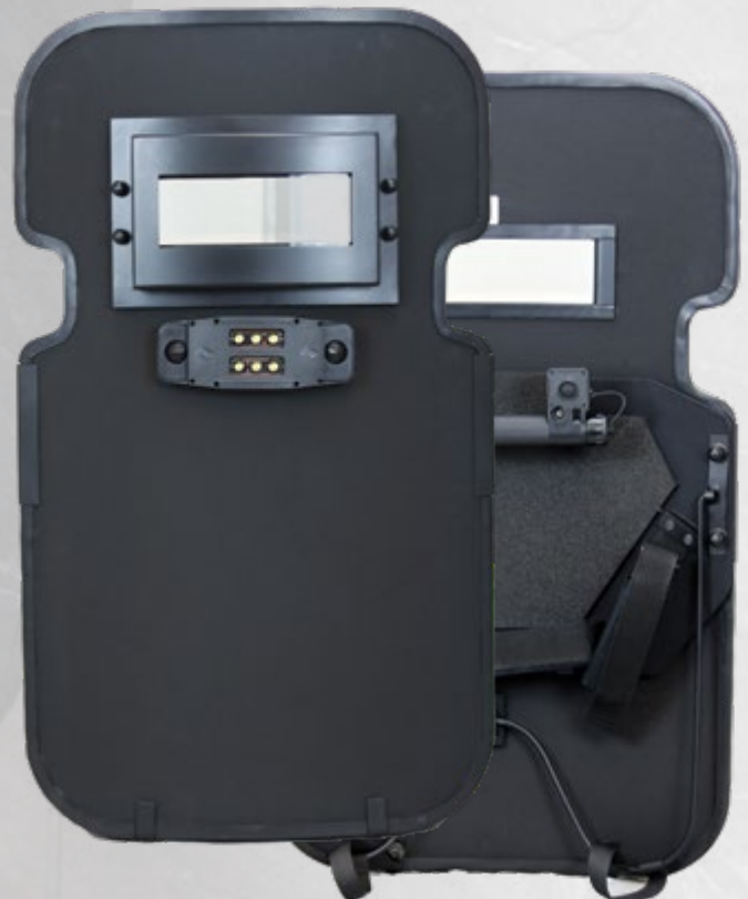
Rifle rated LW III+ Assault with viewport, Dual Discovery handle and LED