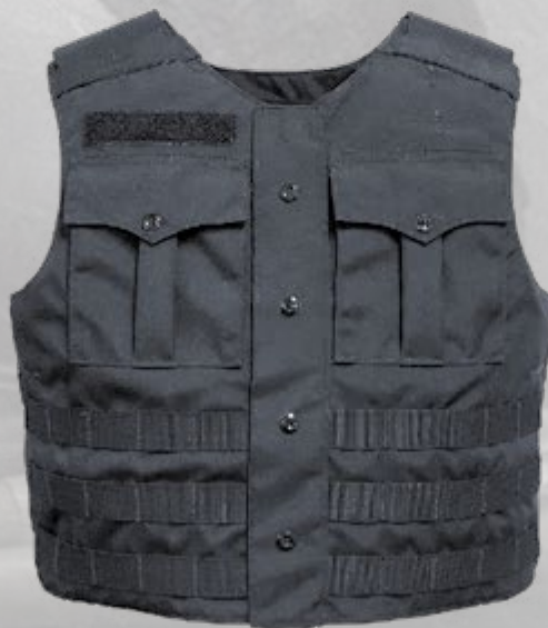
Uniform Shirt Carrier - MOLLE