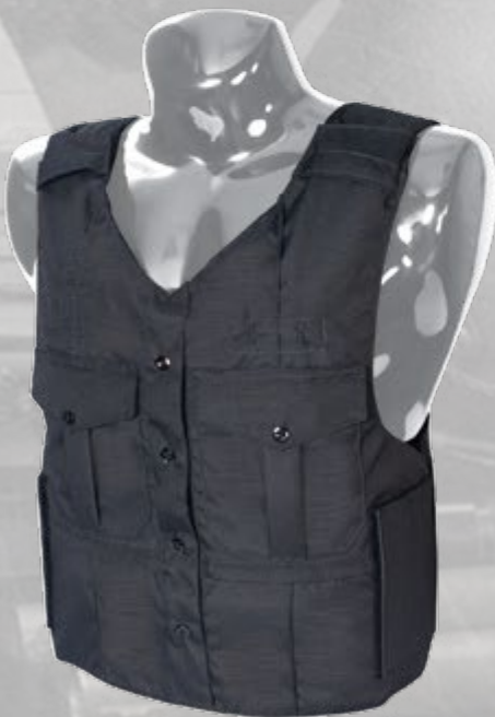
Uniform Shirt Carrier