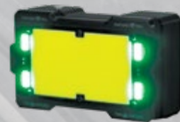
500 lumen green navigation mode detached from base plate