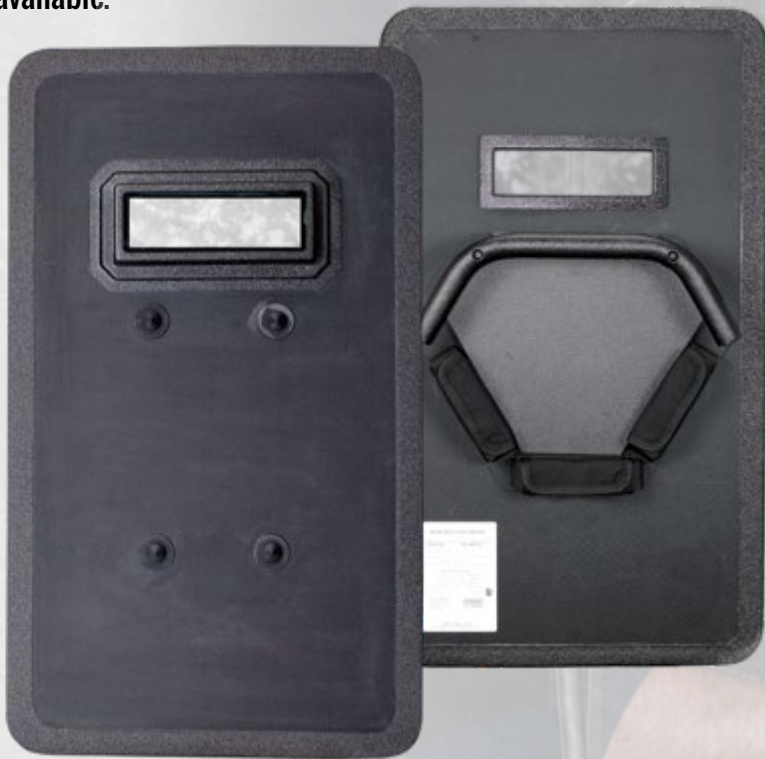
Lightweight Level III++ / RF2 with modified ERT handle

Leading your team into the most extreme conditions while offering maximum rifle rated coverage, our trolley mounted shields are available in multiple ballistic options and our Lightweight III++ is hand deployed. Multiple configurations available.