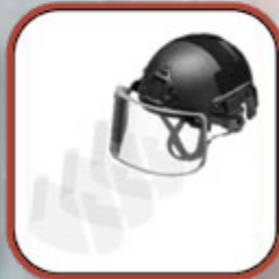
Clear Tear Off