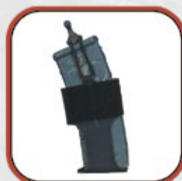
Skeleton Tension Mag Pouch