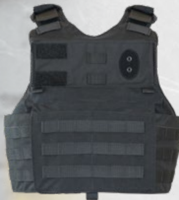
UPT MOODY RI SHOWN WITH HOOK AND LOOP CLOSURE