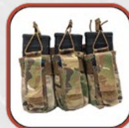
Triple Rifle / Pistol Mag Pouch