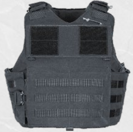
UPT MOODY AV SHOWN WITH SINGLE AUSTRIALPIN BUCKLE WITH MAZ