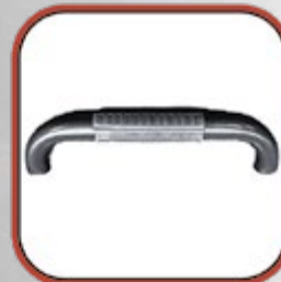
Wide Horizontal Handle 1" wider