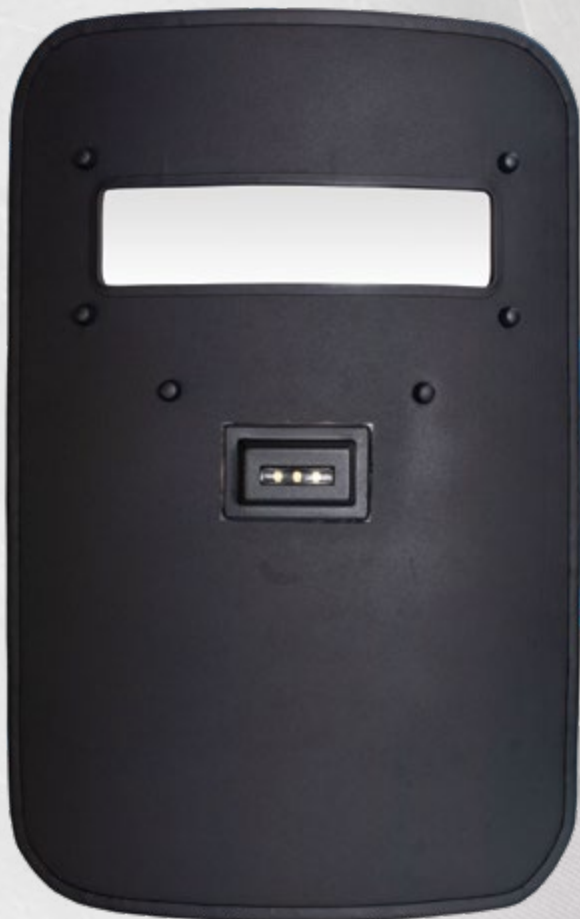
Pistol rated LW IIIA 24"x 36" with viewport, Horizontal handle and integrated B30