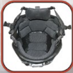
4D Combat Pad Set

Optional helmet accessories offer increased capabilities while providing comfort and protection.