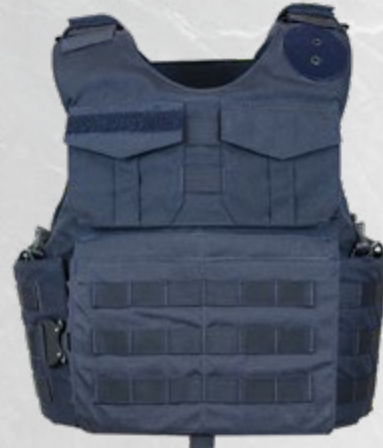
UPT MOUNTAIN HIGHLAND WITH SINGLE AUSTRIALPIN BUCKLE