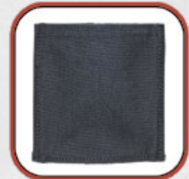
Slick Camera Mount