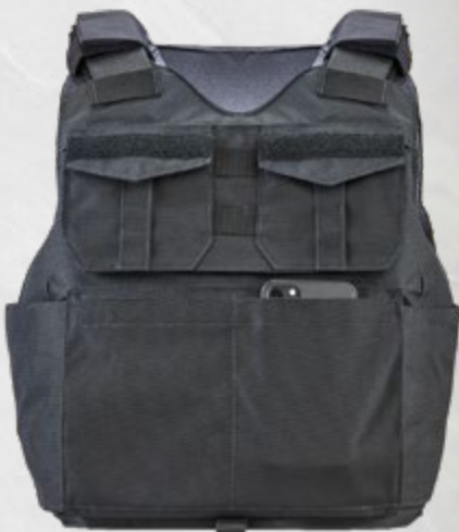
UPT UNIFORM SHOWN WITH HOOK AND LOOP CLOSURE