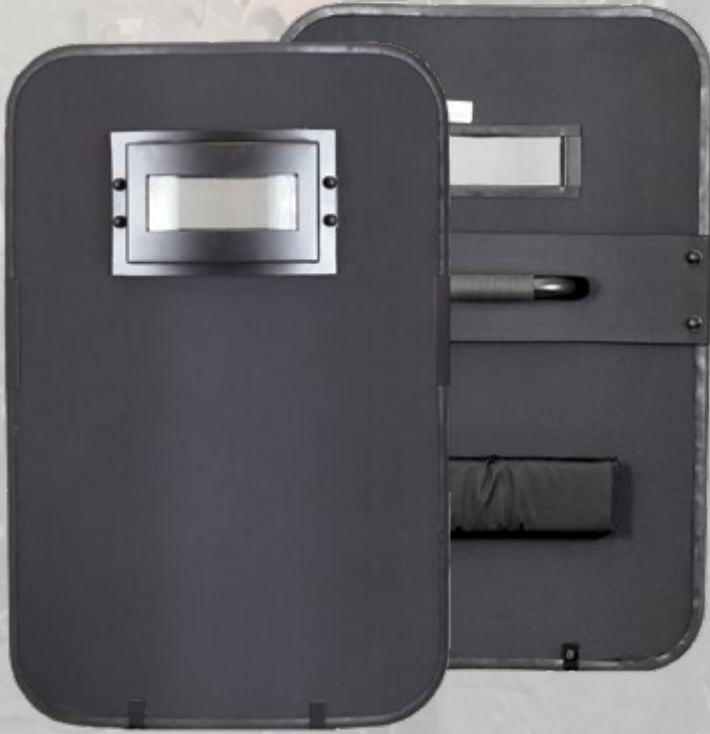
Rifle rated LW III+ Standard 24"x 36" with viewport and Horizontal handle