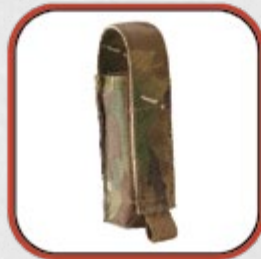
Single 4oz Spray Pouch