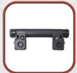
Dual Discovery Handle