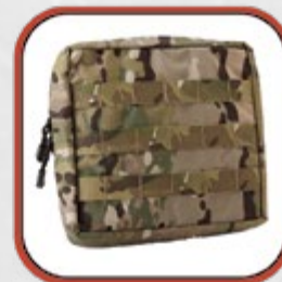
Zipper Large Misc Utility Pouch