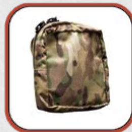
Zipper Small Misc Utility Pouch