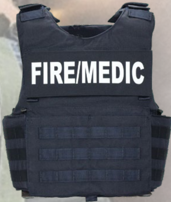
UPT TURNOUT G-HOOK ADJUSTMENT SETTING - 30" SHOWN WITH HOOK AND LOOP CLOSURE