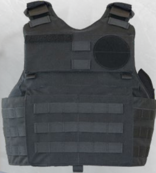
UPT MOODY SHOWN WITH HOOK AND LOOP CLOSURE