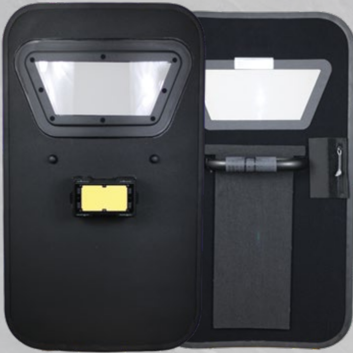
Pistol Rated LW IIIA Standard 20" x 34" with MXV viewport, Horizontal handle and Specter Gen II LED