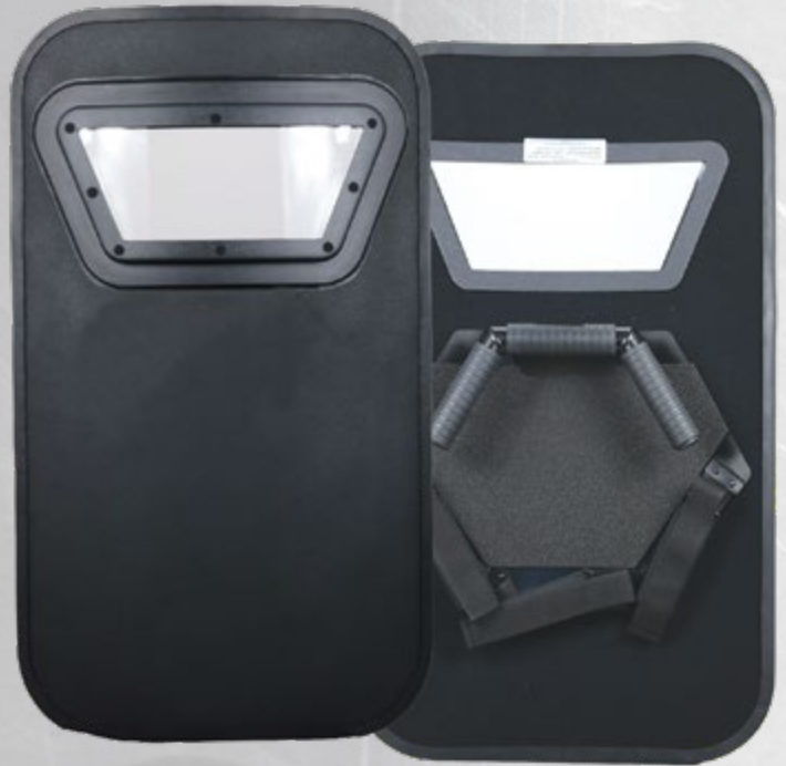
Pistol rated LW IIIA Standard 20" x 34" with MXV viewport and ERT handle