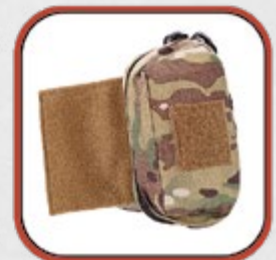
Medical Trauma Pouch