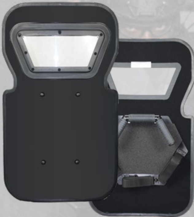
Pistol rated LW IIIA Assault 20" x 34" with MXV viewport and ERT handle