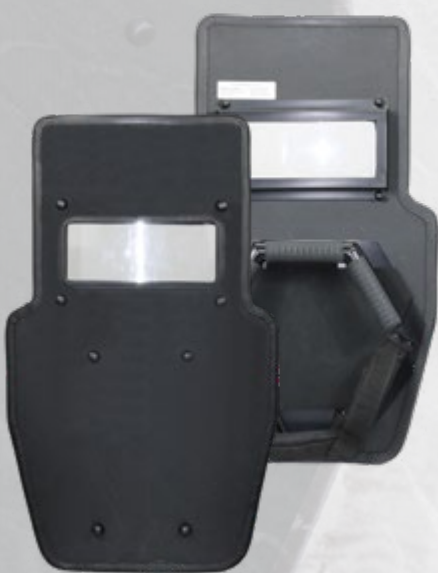
Pistol rated IIIA ERT Micro 18"x 30" with viewport and ERT handle