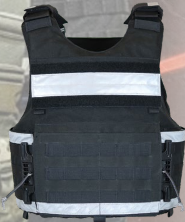
UPT TURNOUT HI-VIS OPTION G-HOOK ADJUSTMENT SETTING - 30" SHOWN WITH DUAL ASPETTO BUCKLES