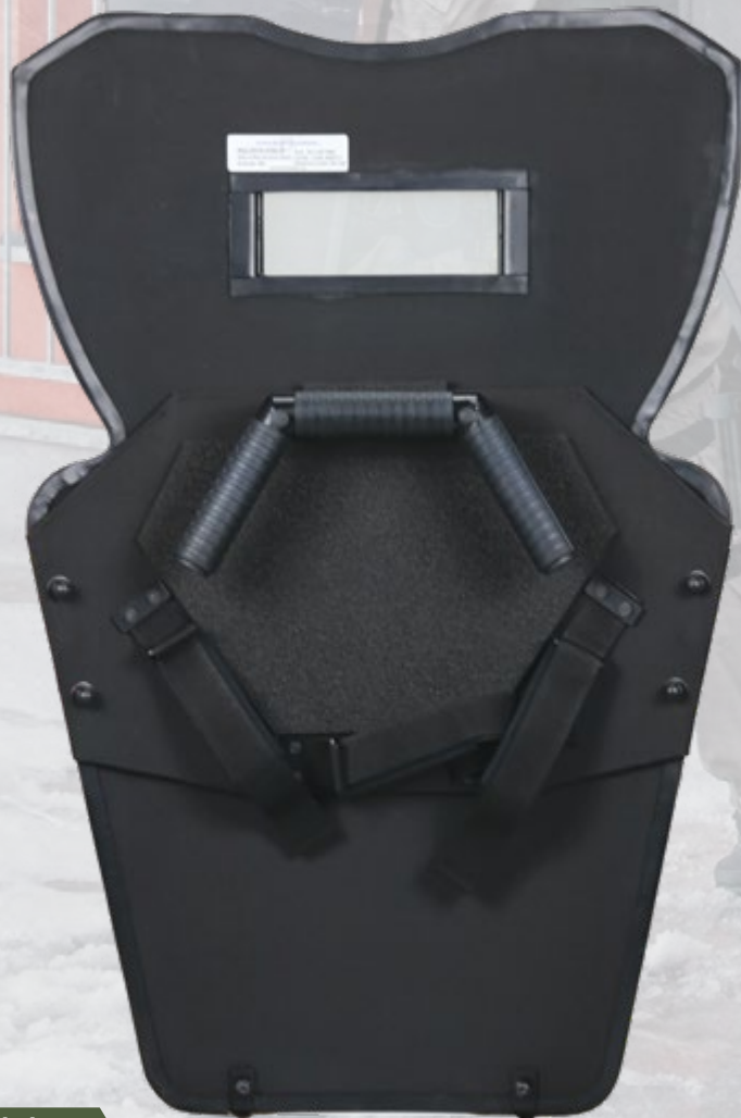
Rifle rated LW III+ RRS 24" x 36" with viewport and ERT handle