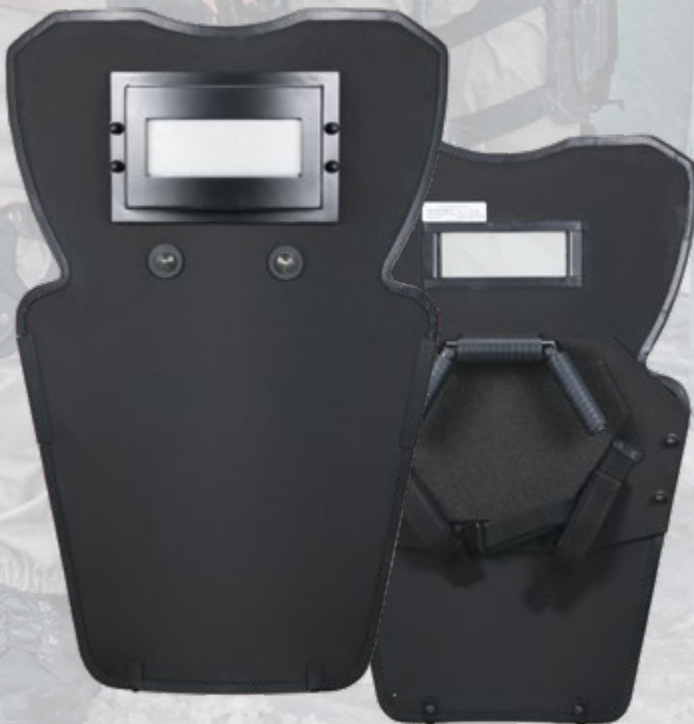
Rifle rated LW III+ RRS 24" x 36" with viewport and ERT handle