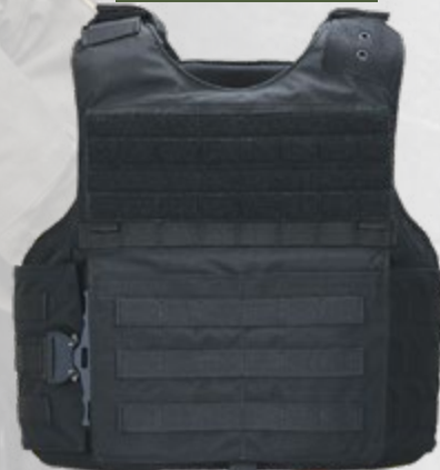
UPT MOUNTAIN CLC WITH SINGLE AUSTRIALPIN BUCKLE