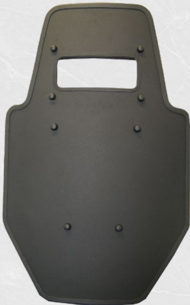
Pistol rated Level IIIA ERT 24" x 36" with viewport and ERT handle