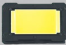
Light removed from base plate