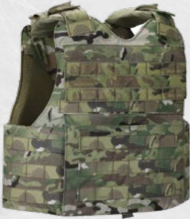
UPT MOLLE SHOWN WITH HOOK AND LOOP CLOSURE