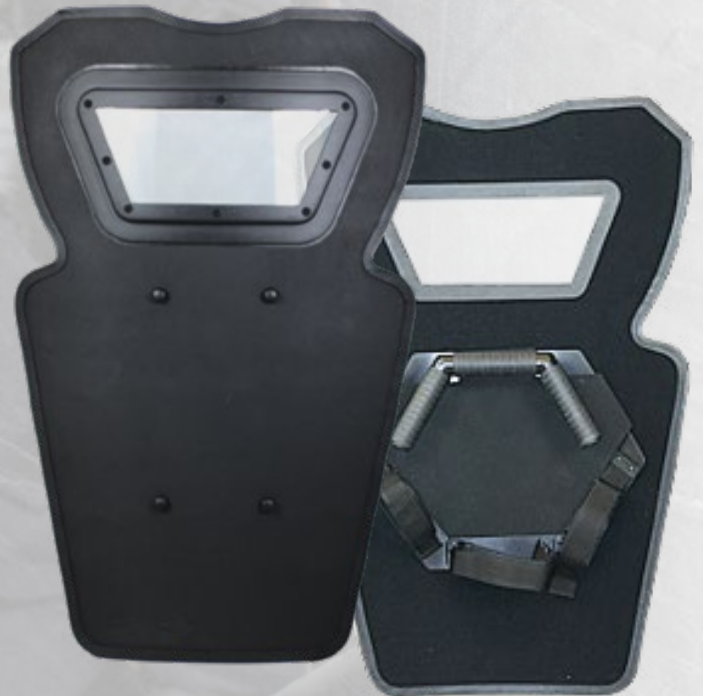
Pistol rated LW IIIA RRS 24" x 36" with MXV viewport and ERT handle