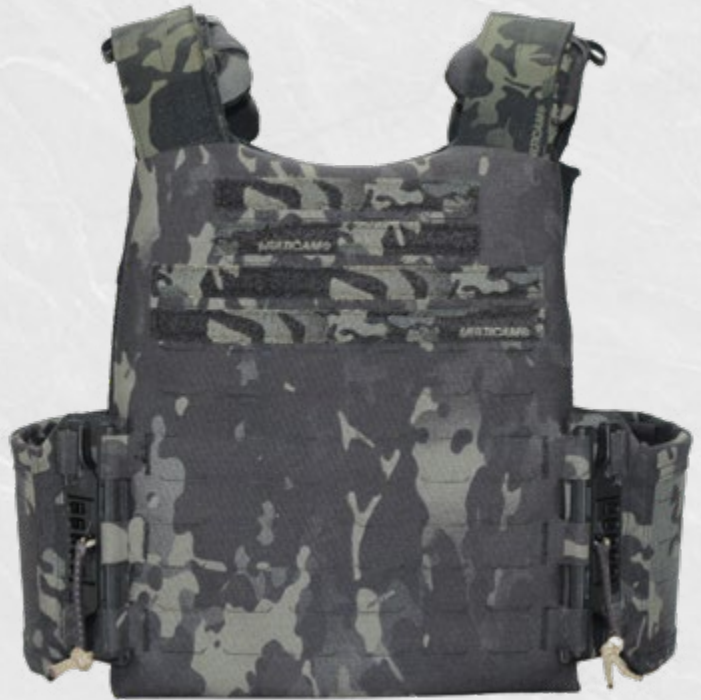
ARK TG SHOWN WITH ASPETTO BUCKLES