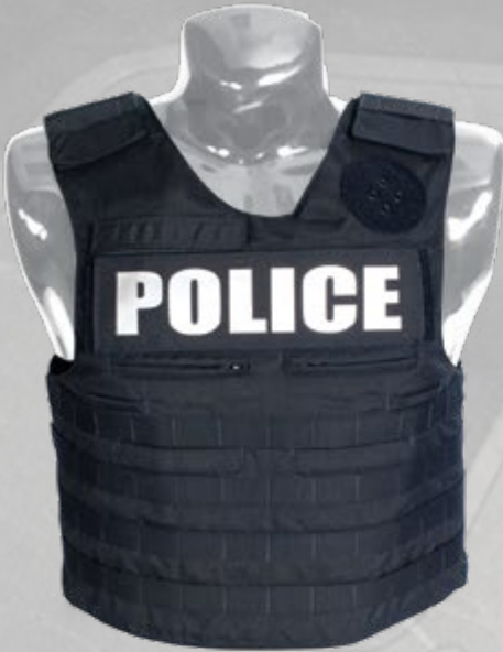
MOLLE Crossover Carrier