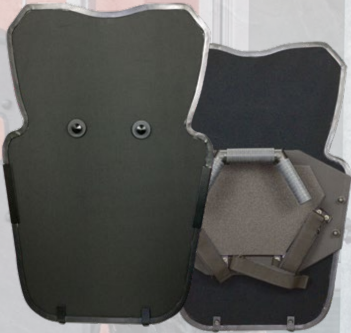
Rifle rated LW III+ RRS 21" x 30" no viewport and ERT handle