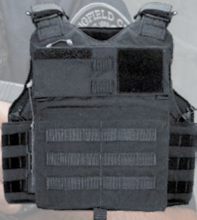
UPT MOODY EV SHOWN WITH SINGLE ASPETTO BUCKLE WITH MAZ

* All UPT Moody carriers utilize the same rear design