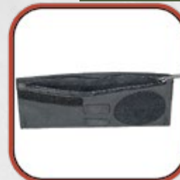
Moody Accessory Zipper