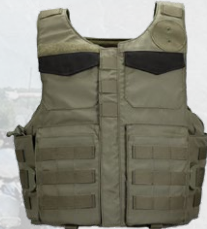
U-ZIP PATROL SHOWN WITH DUAL AUSTRIALPIN BUCKLES