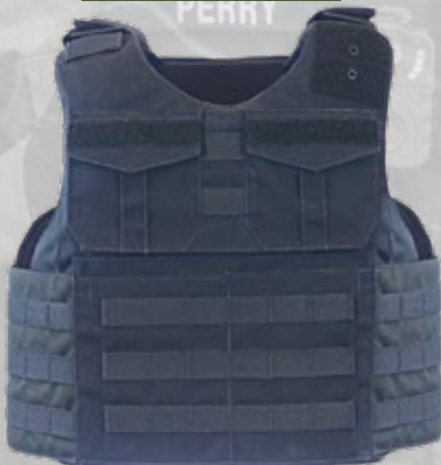
UPT MOUNTAIN PATROL WITH HOOK AND LOOP CLOSURE