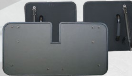
Sniper Shield IIIA Size: 21" x 42" Pistol and rifle rated options Click Here to Learn More