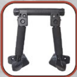
Assault Tri-Grip Handle