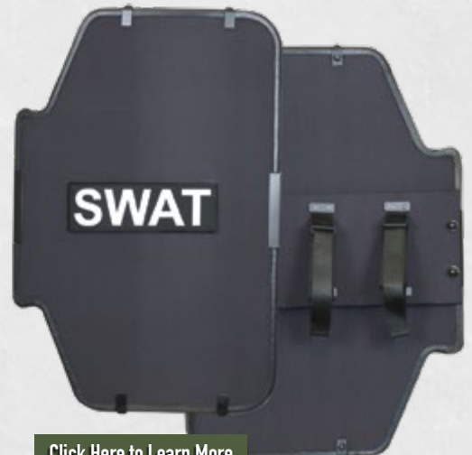
Click Here to Learn More KENT Shield LW III+ Size: 22" x 32" Pistol and rifle rated options