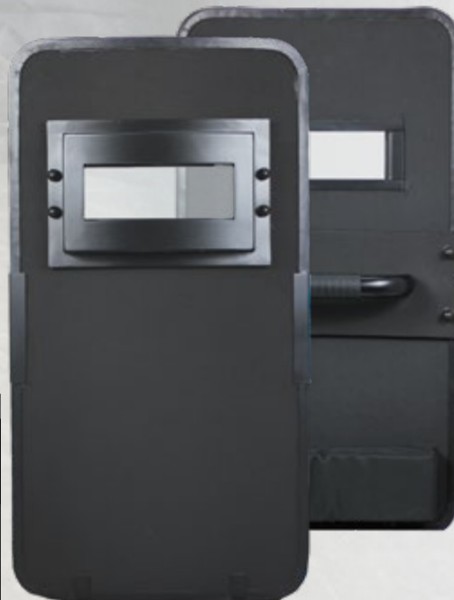
Rifle rated LW III+ Standard 16"x 30" with viewport and Horizontal handle