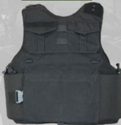
UPT MOUNTAIN UNIFORM WITH SINGLE AUSTRIALPIN BUCKLE