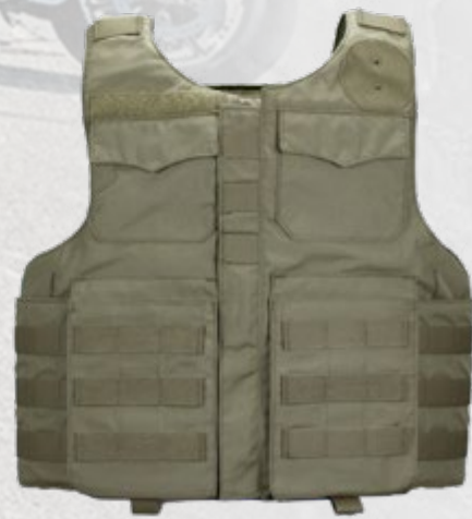
U-ZIP PATROL SCALLOPED POCKET SHOWN WITH HOOK AND LOOP CLOSURE