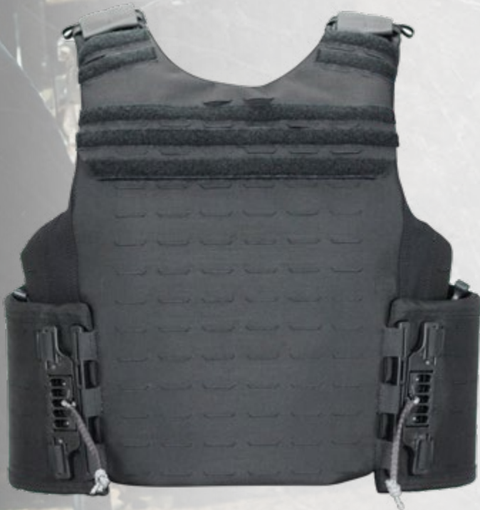
UPT MOLLE LASER CUT SHOWN WITH ASPETTO BUCKLES