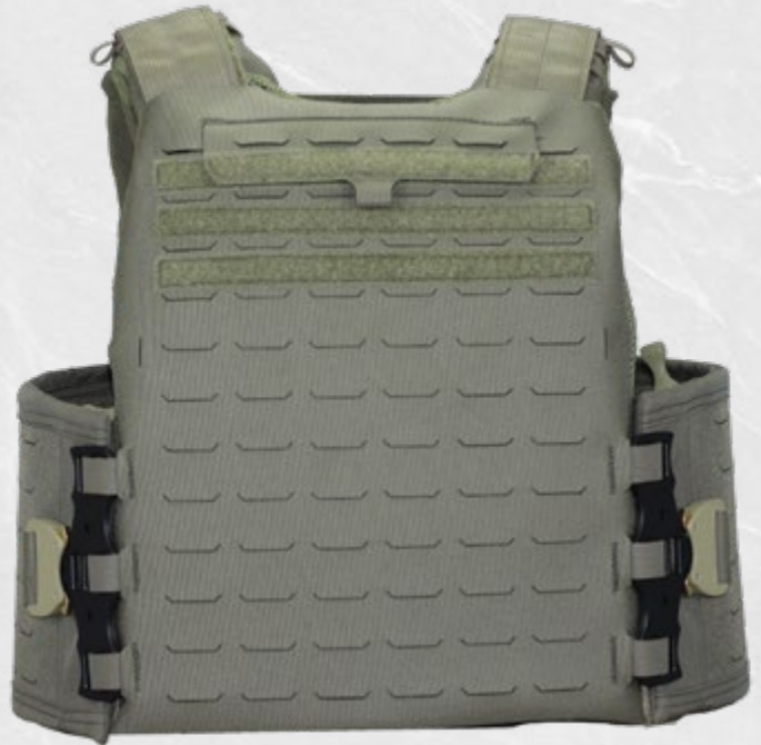
GRLC SHOWN WITH AUSTRIALPIN BUCKLES