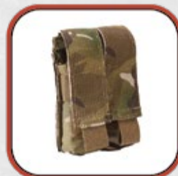
Double Pistol Mag Pouch