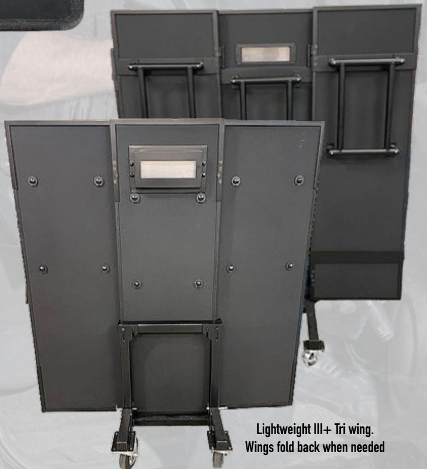
Lightweight III+ Tri wing. Wings fold back when needed

Click Here to Learn More Level IV Trolley