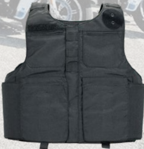
U-ZIP SLICK SHOWN WITH HOOK AND LOOP CLOSURE