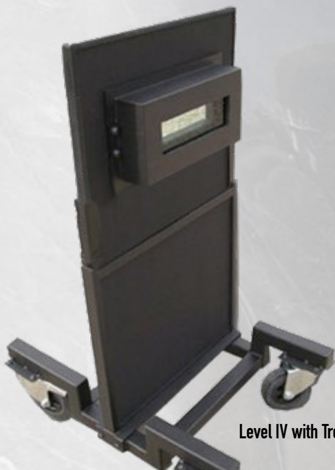
Level IV with Trolley