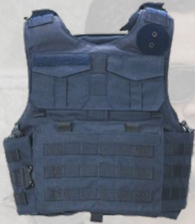
UPT MOUNTAIN GURNEE SHOWN WITH SINGLE AUSTRIALPIN BUCKLE

The UPT Mountain variants allow for badge placement on the upper left chest. Traditional uniform pleated pockets or MOLLE front give agencies the flexibility to decide on visual appearance. Both options provide performance and function exceeding the needs of the officer. UPT external carriers provide better overall officer health and wellness by allowing extra weight to be placed on shoulders and removing items from the duty belt.