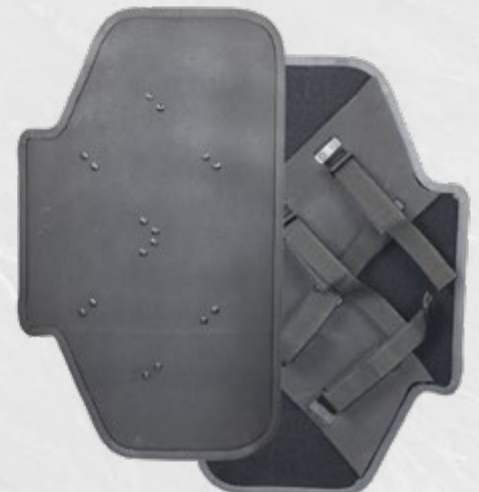
West York LW IIIA Size: 17" x 29" Pistol and rifle rated