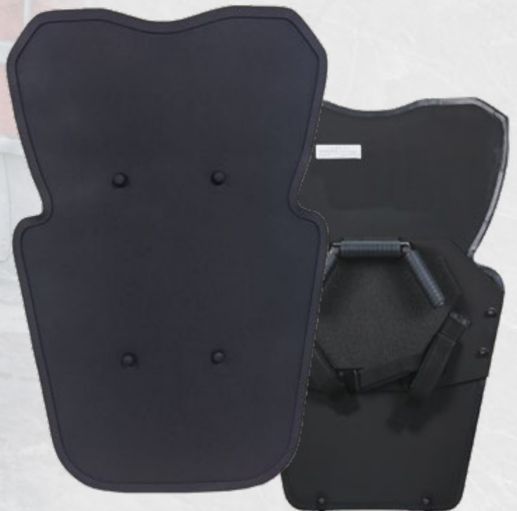
Pistol rated LW IIIA RRS 21" x 30" no viewport, and ERT handle