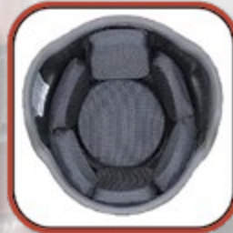
4D 7-Pad Set