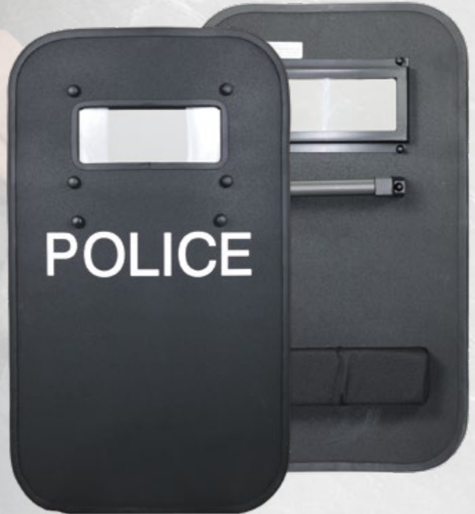
Pistol rated LW IIIA HMLP with viewport and Horizontal handle