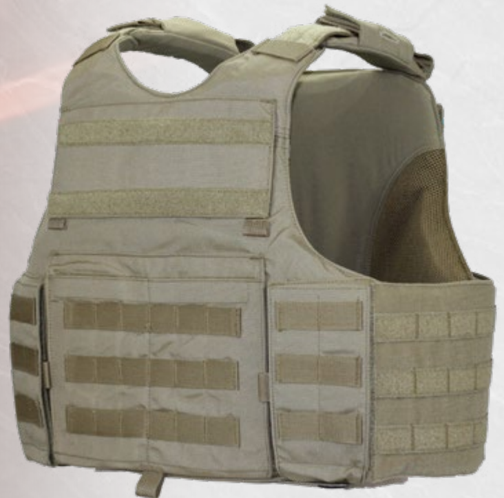
UPT TURNOUT WITH MESA CUMMERBUND G-HOOK ADJUSTMENT EXPANDED TO 72" SHOWN WITH HOOK AND LOOP CLOSURE