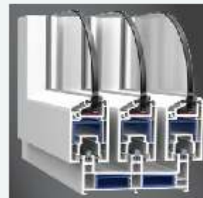
3-Track 3- Panel Door