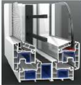
Casement Window with Grill & Mesh

The I-60 Series is designed for casement doors, windows, and windows with grill and mesh. It provides options of single and double glazing, ranging from 5 mm 32 mm. The system comes with co-extruded glazing beads for better finishing and easy installation.