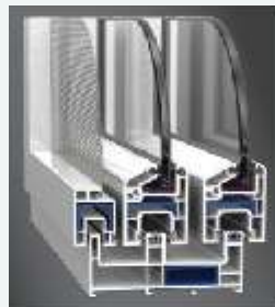
Double Rail With Screen Sash