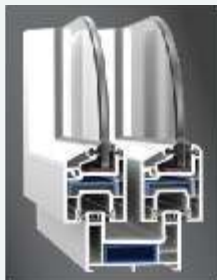
2-Track 2-Panel Window

The I-50, I-60, I-64 & I-75 Series are designed for sliding doors and windows. The wide range provides flexibility to fabricators and end-users. They are available in 2-track, 2-track with fly-screen, 3-track etc., to suit specific customer requirements, with options of single glazing and double glazing, ranging from 5mm 24 mm.