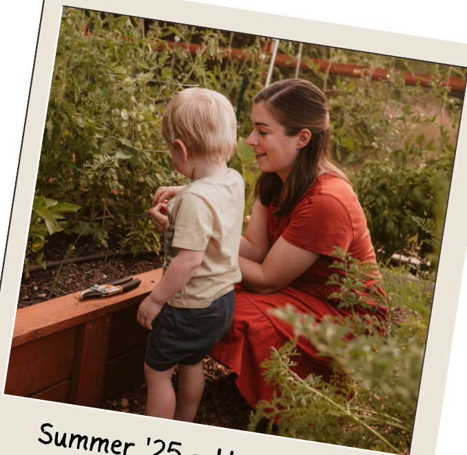
Summer '25 - Harvesting ground cherries. YUM!

For my nearly 3 year old, right now this looks like placing pea seeds in a trench I dig, helping with watering, and harvesting small fruits (especially ground cherries and cherry tomatoes).