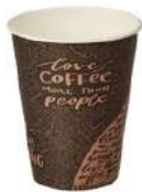
12oz Single Wall Paper Cup

Dimensions: Bottom Dia 58mm x Height 110mm, Upper Dia 90mm