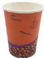
16oz Single Wall Paper Cup

Dimensions: Bottom Dia 58mm x Height 137mm, Upper Dia 90mm