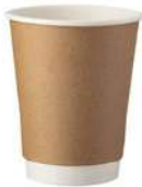
12oz Double Wall Paper Cup

Dimensions: Bottom Dia 58mm x Height 110mm, Upper Dia 90mm