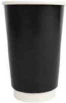
16oz Double Wall Paper Cup

Dimensions: Bottom Dia 58mm x Height 137mm, Upper Dia 90mm