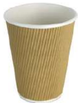
16oz Single Wall Paper Cup

Dimensions: Bottom Dia 58mm x Height 137mm, Upper Dia 90mm