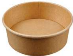
Paper Container 1000ml

Dimensions: Bottom Dia 112mm x Height 100mm, Upper Dia 140mm