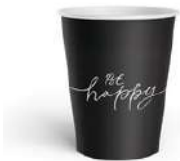
8oz Single Wall Paper Cup

Dimensions: Bottom Dia 54mm x Height 92mm, Upper Dia 80mm