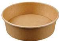
Paper Container 750ml

Dimensions: Bottom Dia 84.19mm x Height 110mm, Upper Dia 110mm