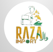
RAZA IMPORT WALA NOV 2023