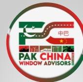
PAK CHINA WINDOW NOV 2021