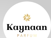
KYAAN PERFUME JULY 2020