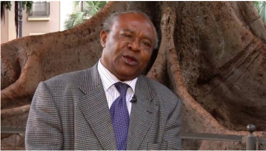
Don Donato Ndongo Biyogo, one of the main authors and referents of Equatoguinean and Hispano-African literature.

The voice of Equatorial Guinea in African literature is unmistakable because it is also the only Hispanic voice in black Africa, and the only bridge from Africa to America, a continent with millions and millions of children of Africa there abandoned to their fate because of the evils of destiny to which the Black People have been trapped.