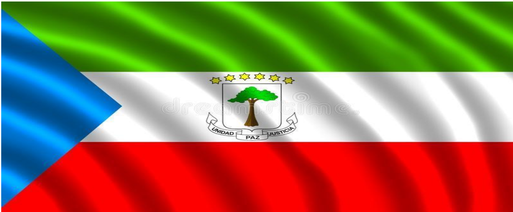
www.periodicodeguineaecuatorial.online , All the Reality of Equatorial Guinea in one place.

A young Chinese businesswoman was the first victim of the crime wave that the financial crisis is blatantly creating in Equatorial Guinea. The young woman was gagged, brutalized and raped by one of his national employees, in the Semu neighborhood of the Capital.