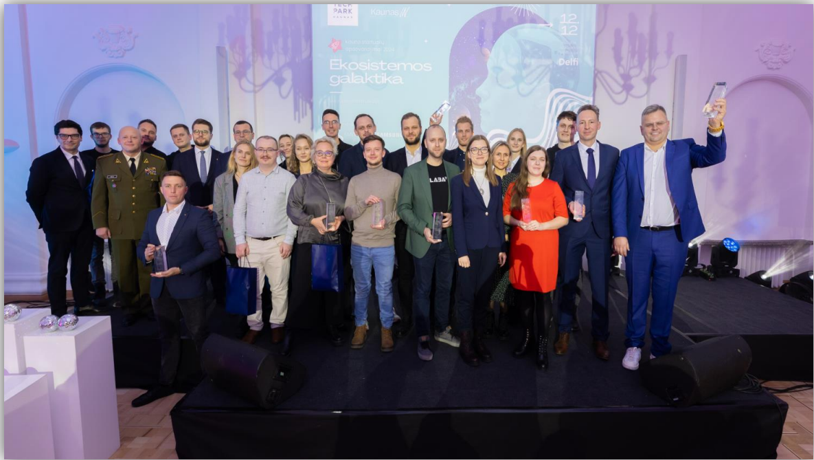
IN awards for startups