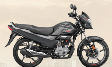
Matte Axis Grey