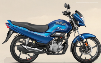
Matt Nexus Blue