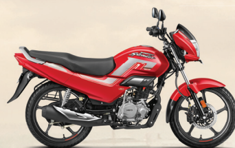
Candy Blazing Red