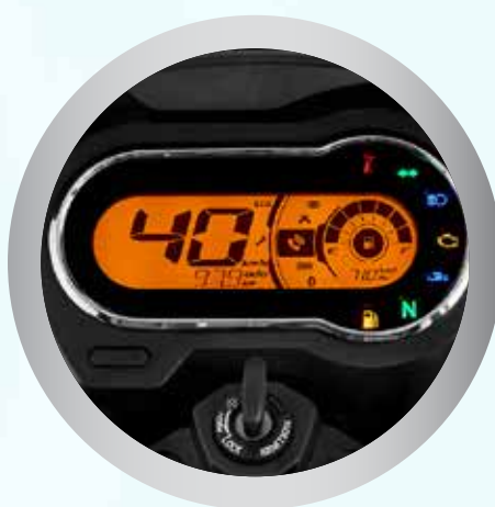
FULLY DIGITAL INSTRUMENT CLUSTER WITH RTMI