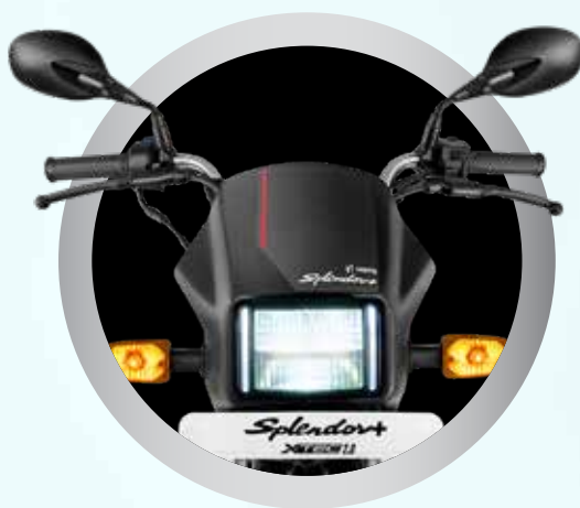
LED HEADLIGHT WITH HIPL