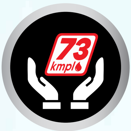
BEST-IN-CLASS MILEAGE 73 KM/L