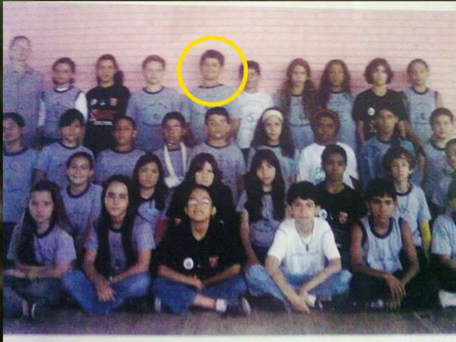
Me during the class photo, 2004