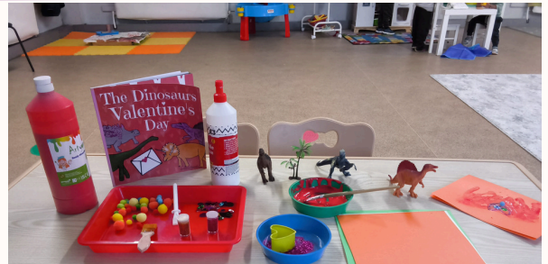
Valentines Day – Card Making