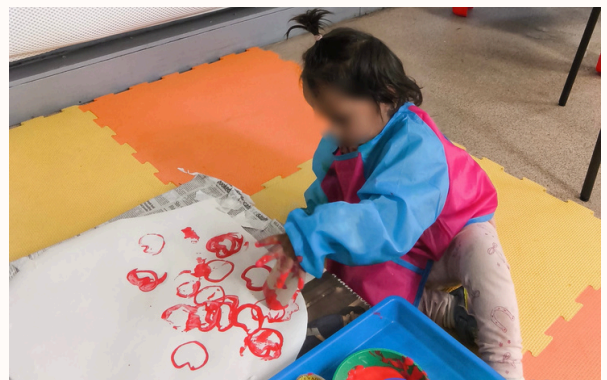
Heart Shaped Printing

The children thoroughly enjoyed the activity, and it was lovely to see them continuing to use kind and loving words with each other throughout the day. A beautiful way to celebrate Valentine's Day.