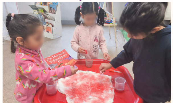
Practicing our Fine Motor Skills