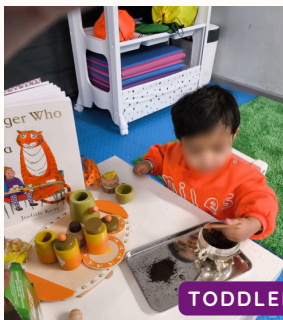
TODDLER TEA TIME!