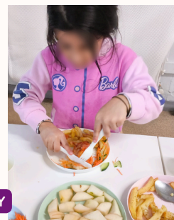
EATING USING CUTLERY