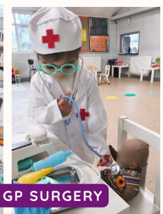
THE LITTLE LUMOS GP SURGERY