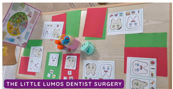
THE LITTLE LUMOS DENTIST SURGERY

WWW.LITTLELUMOSNURSERY.COM INFO@LITTLELUMOSNURSERY.COM