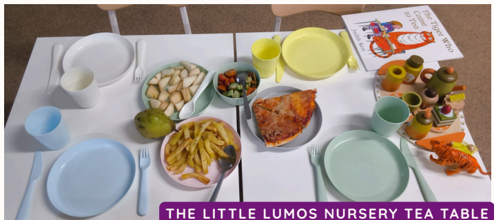
THE LITTLE LUMOS NURSERY TEA TABLE