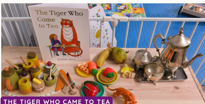
THE TIGER WHO CAME TO TEA