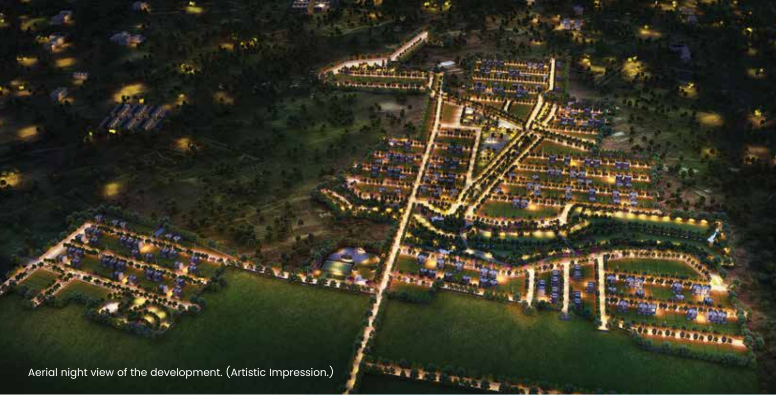
Aerial night view of the development. (Artistic Impression.)