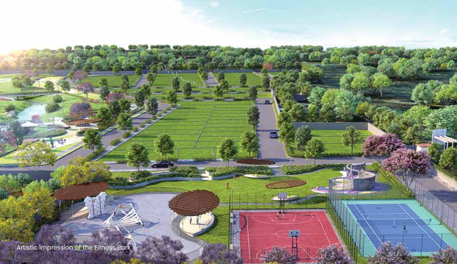
Artistic impression of the Fitness Park