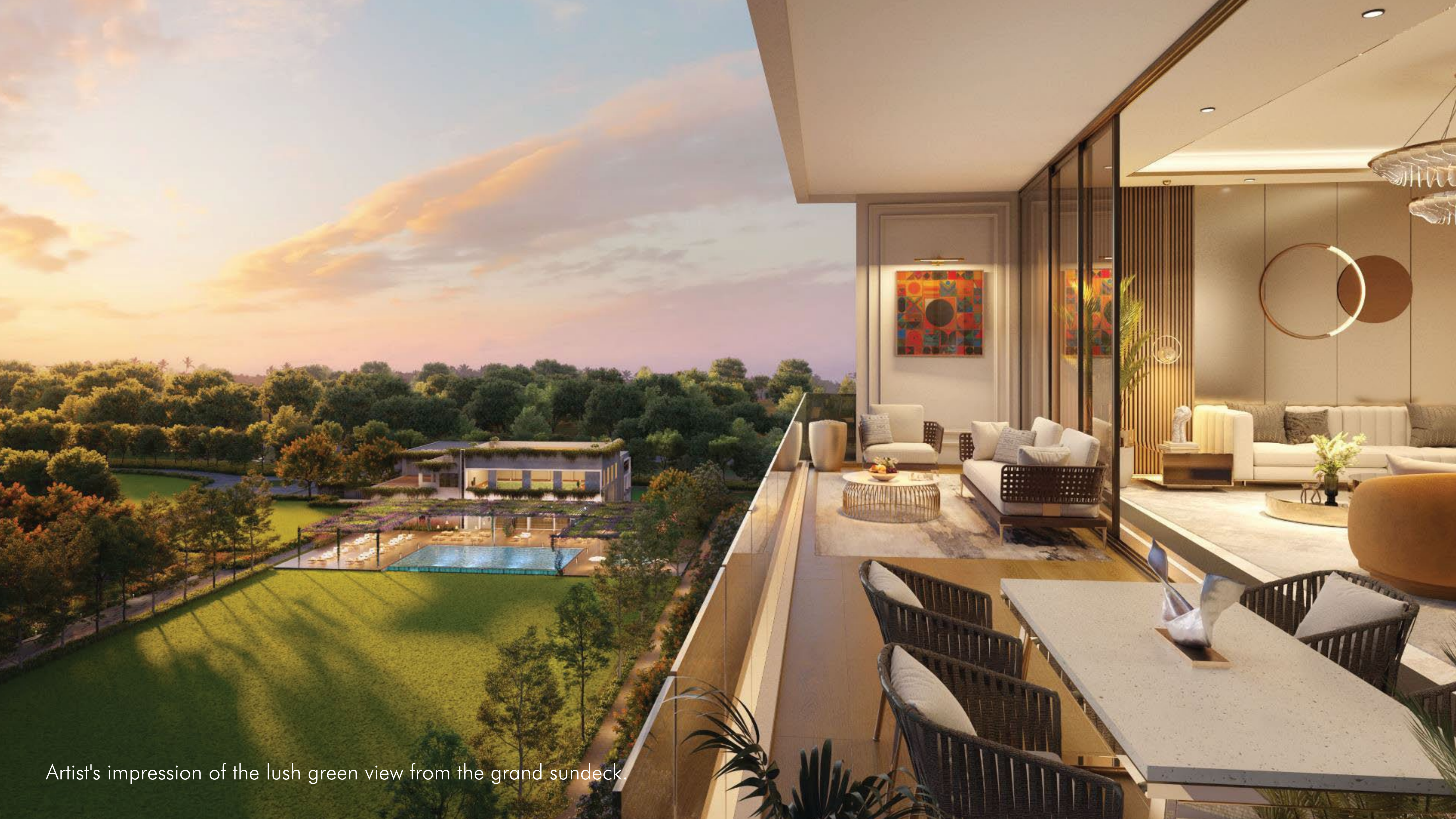
Artist's impression of the lush green view from the grand sundeck.