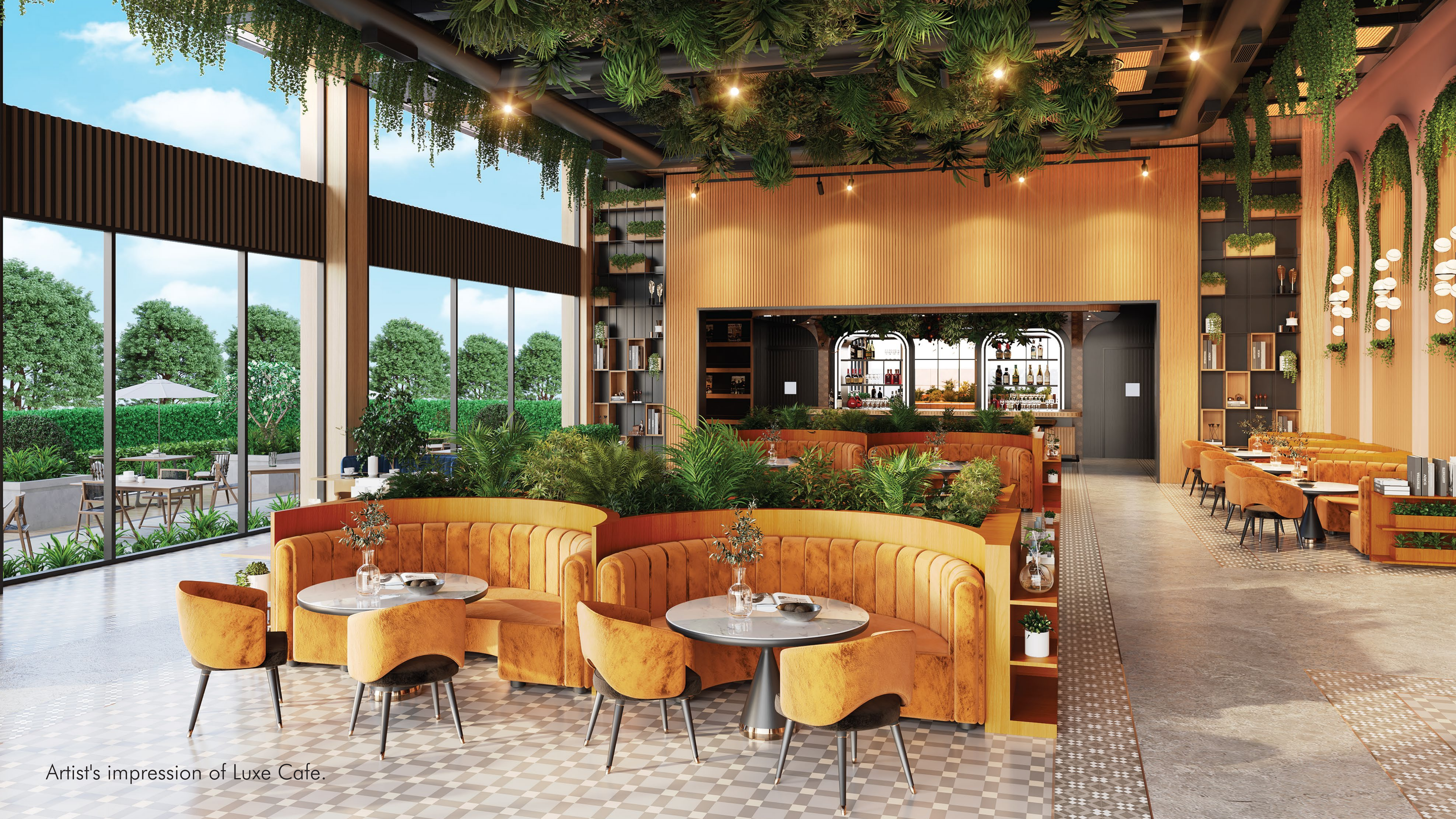
Artist's impression of Luxe Cafe.