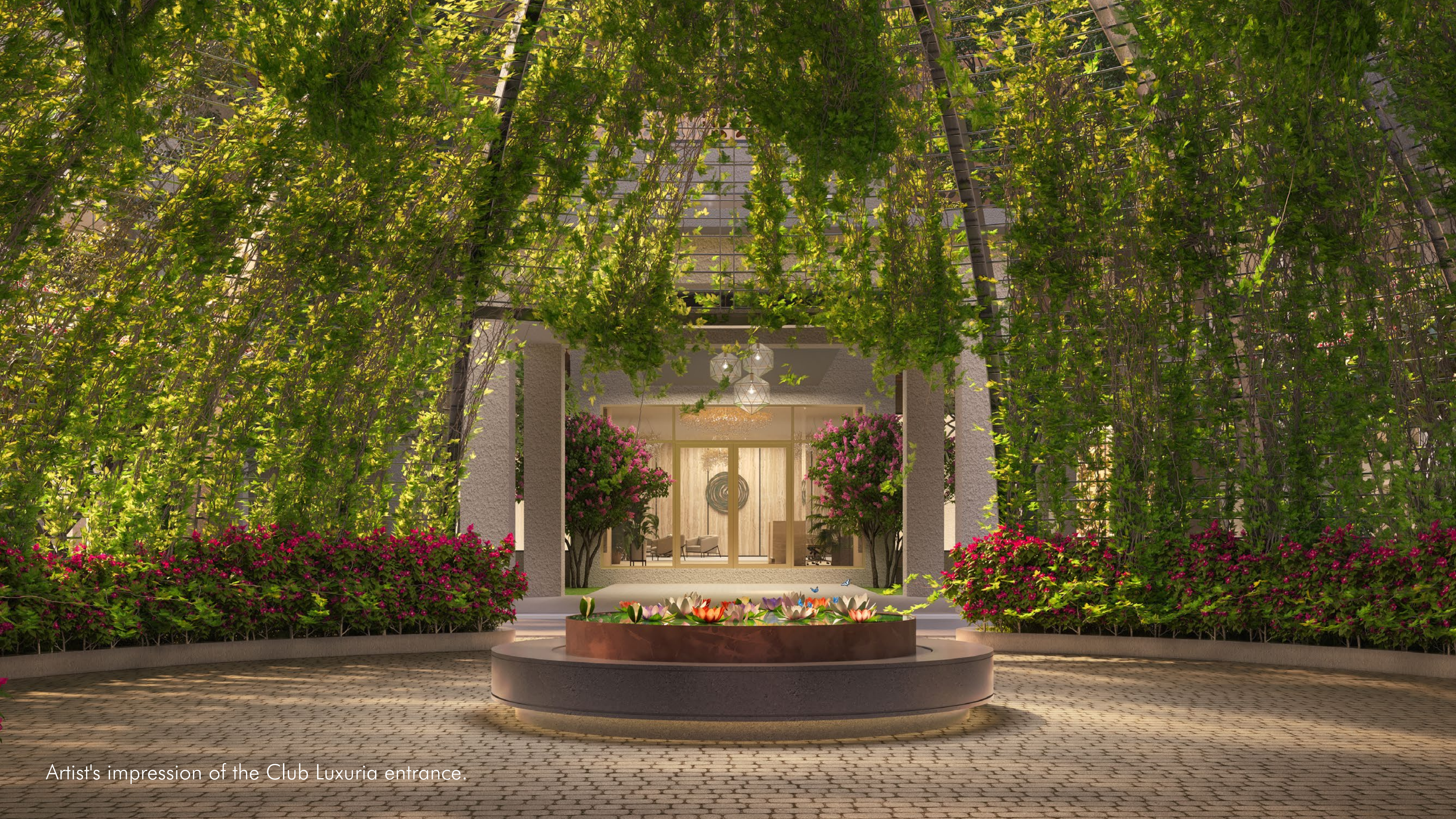
Artist's impression of the Club Luxuria entrance.