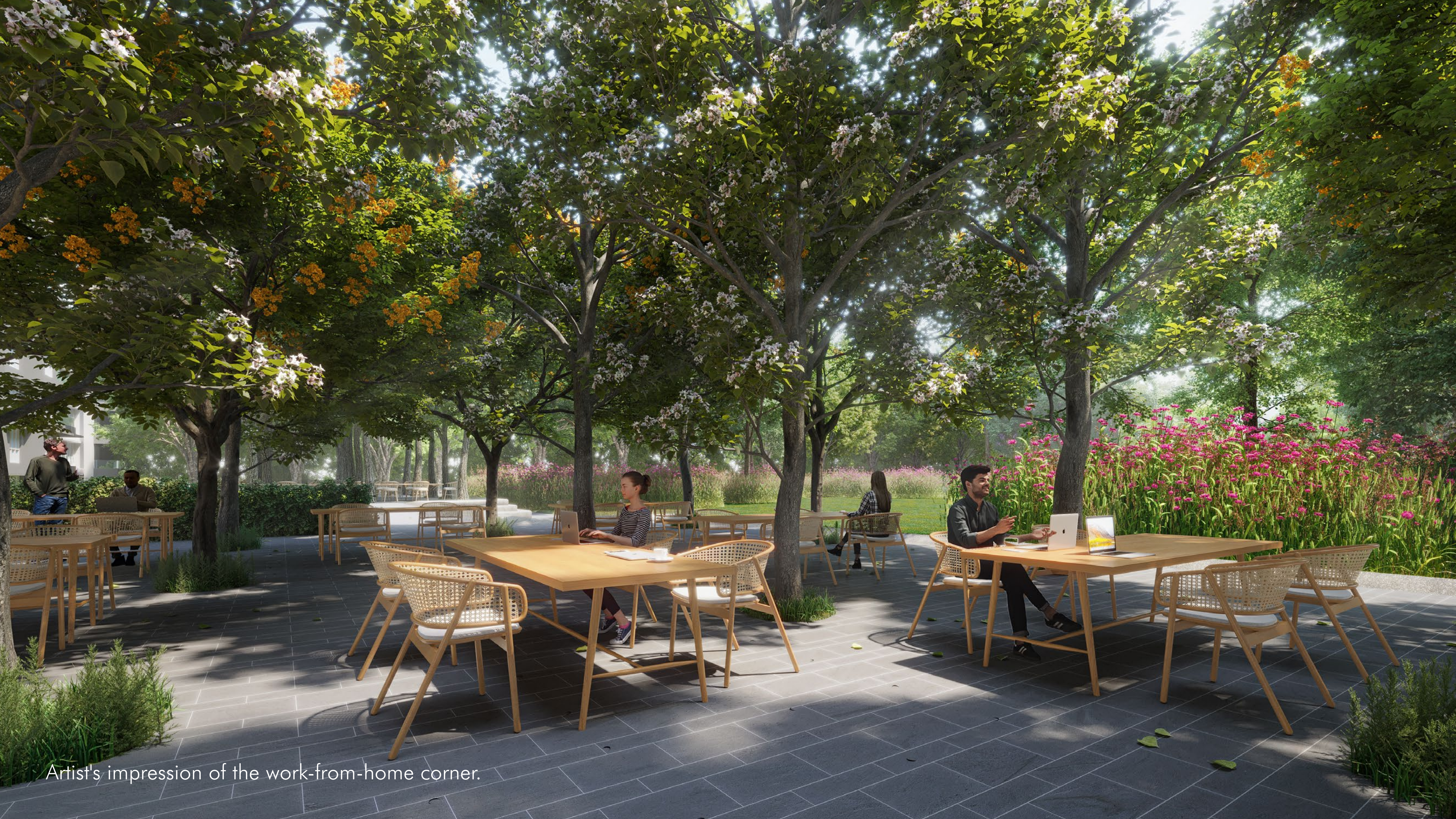
Artist's impression of the work-from-home corner.