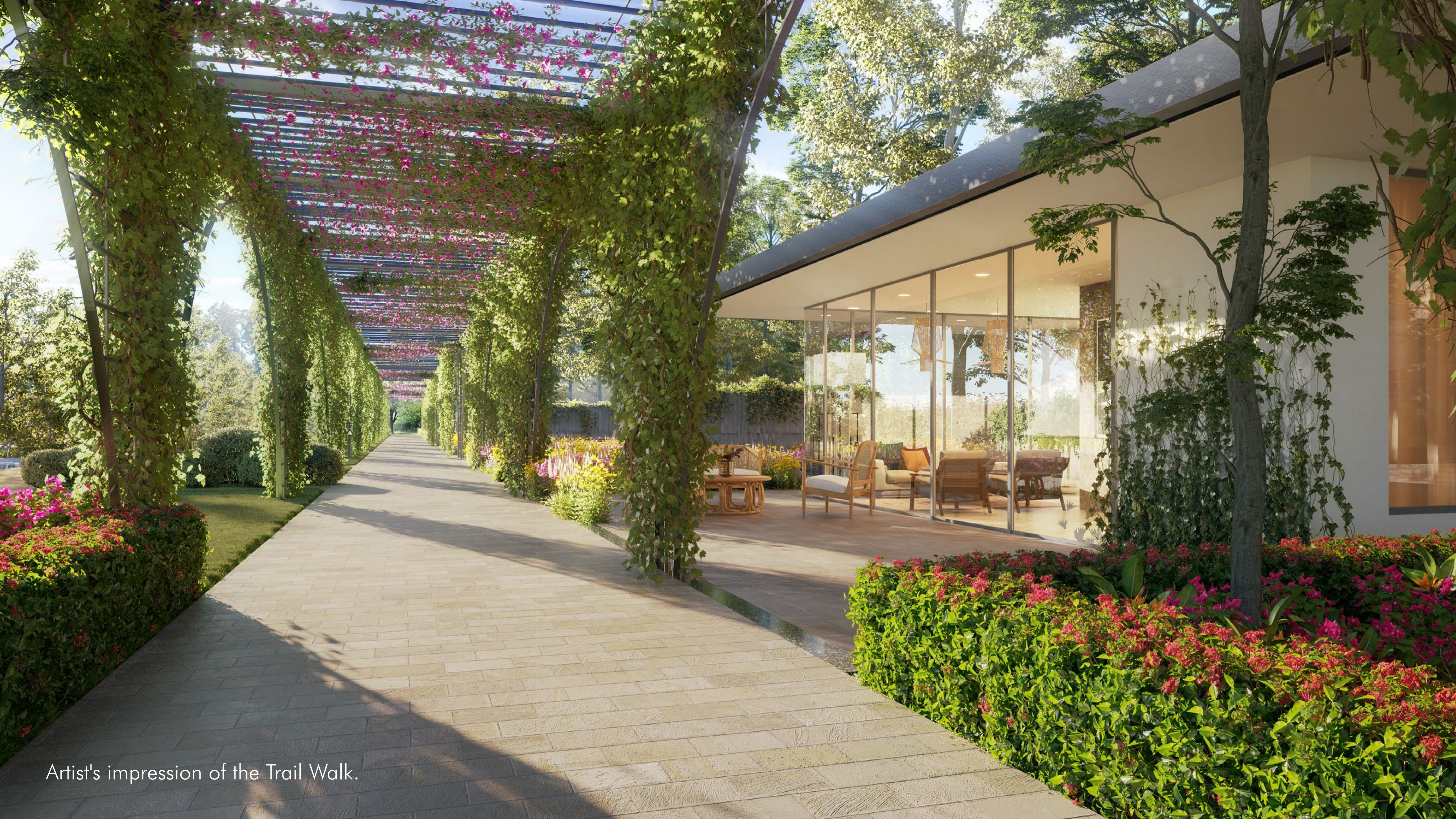
Artist's impression of the Trail Walk.