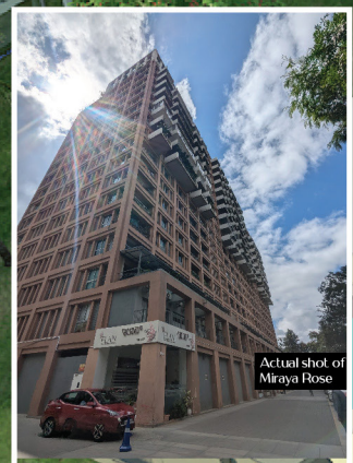
Actual shot of Miraya Rose Next to Miraya Rose, a community with luxury, retail and dining brands like Starbucks, Tony & Guy, Croma and more..