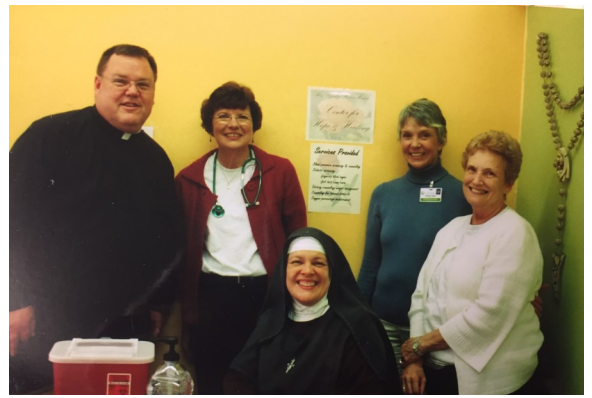
A clinic is born! The Center for Hope and Healing in it's early days, before the new location. We only had a small corner, but we made it work until we found a new home!