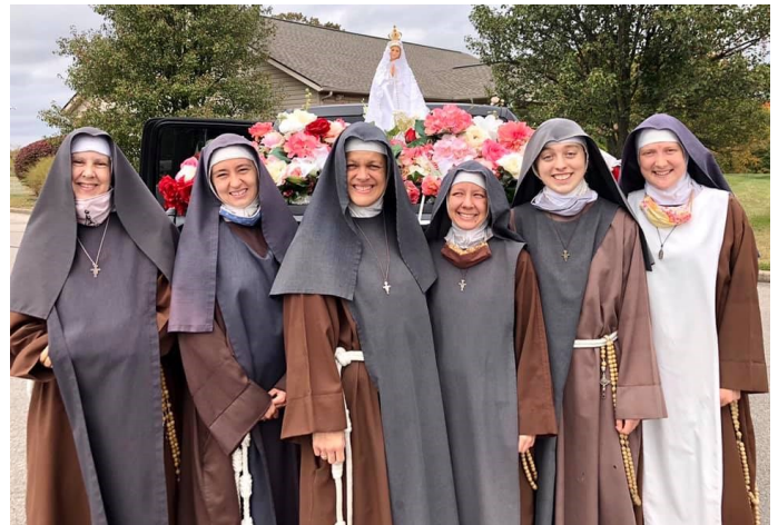
It was a truly glorious day in honor of Our Blessed Mother

brought us to Immaculate Heart of Mary, Burlington, followed by St. Thomas in Ft. Thomas, St. Joseph in Crescent Springs and St. Agnes in Park Hills.