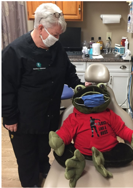
Talking to froggy about the importance of flossing!