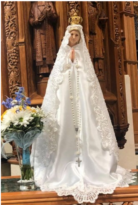
Our Lady at the Cathedral Basilica. We made her a new gown for the Novena using a wedding dress that a friend donated