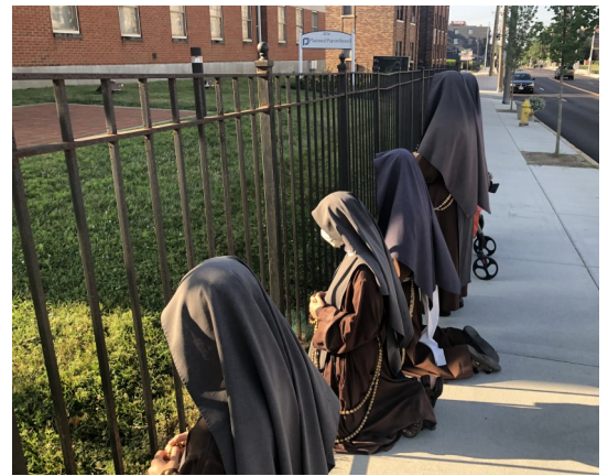
A witness to the sanctity of every human life, the sisters pray outside of Planned Parenthood in Cincinnati

At the time of the Consecration, Christ her Son is sacrificed, and we have an opportunity to ask the Lord that our children be washed in His Blood and kept safe for the Kingdom of Heaven.