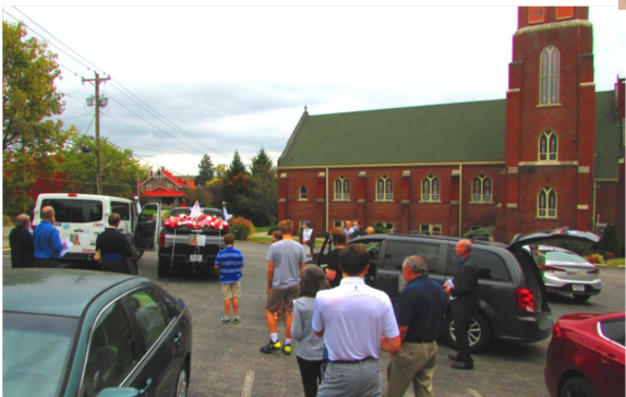
First Decade prayers outside of Our Lady of Lourdes