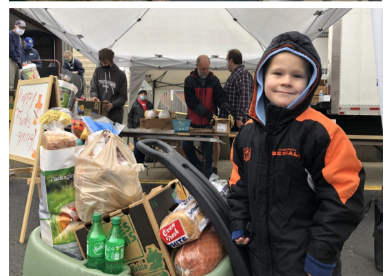
Little cutie pulling a wagon at Thanksgiving Gave-Away Nov. 24th.