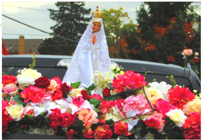
Our beautiful Mother surrounded by flowers led our procession through the neighborhoods to each church.

At each of the church parking lots, we all stood outside of our vehicles to maintain social distance, and prayed one decade of the Glorious Mysteries of the Rosary. At IHM, in addition to the Rosary, we prayed the Fatima