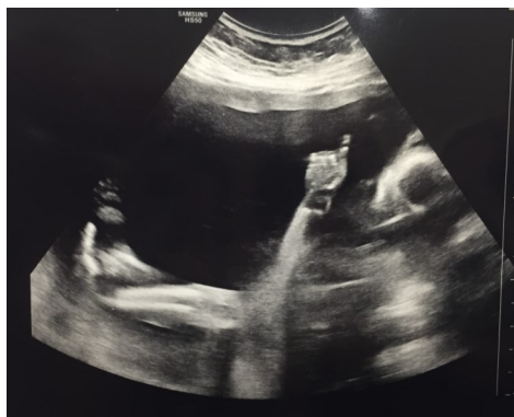
This little baby appears to be pointing to Heaven, think he knows the way?

This baby is pointing up with his finger!