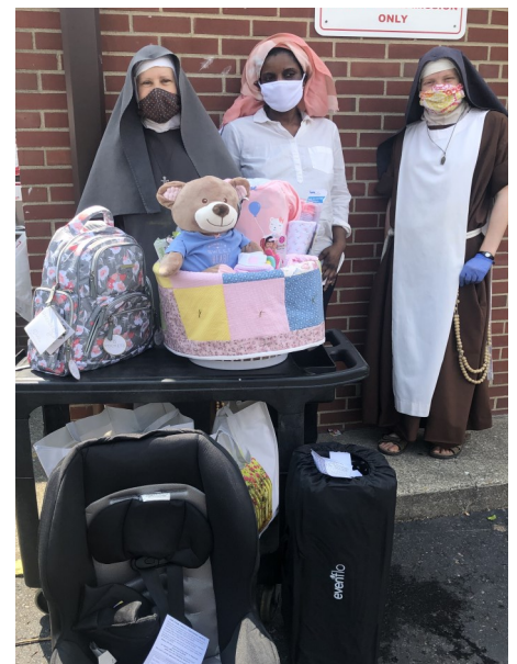
Mom receives everything she needs for her unborn child

We pray for an end to the pandemic and the stressors that are associated with it. But thanks be to God, we are able to see His gentle and caring hand throughout it all.