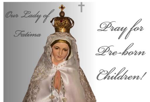
Above is one of 7 magnetic bumper signs we had made for everyone in the procession. The text on the right for the other 6: Pray the Rosary, Pray for Our Church, Pray for Our Priests, Pray for Peace, Pray for Families, Pray for Our Nation.

Many people we know expressed an interest in participating but were unable. So that they could participate with us in some way, we had families and individuals send us videos of them praying one Hail