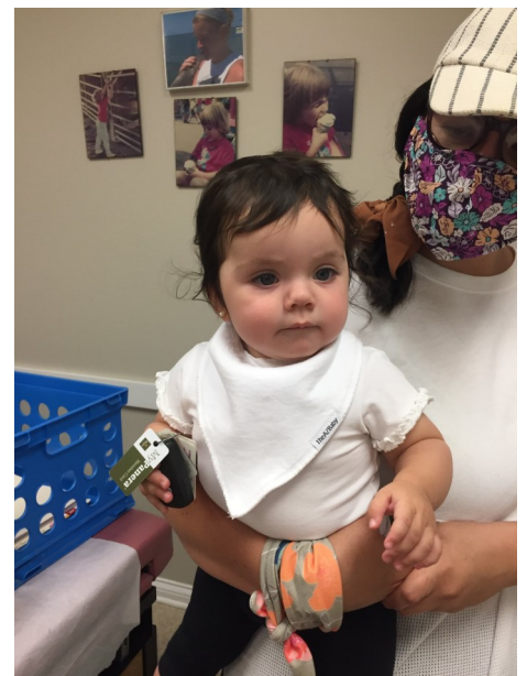
I'll drive home mom!