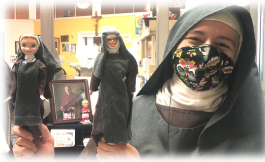
Sister rejoices as these Barbies forsake their worldly life of glamour for a simpler and more austere path.