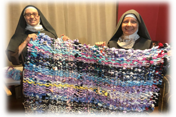
The Sisters wove a blanket from strips of material from "rejected" clothing—too well soiled or ripped, etc.