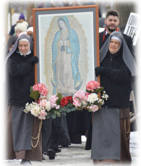
Our Lady of Guadalupe leading the Mini March for Life in Cincinnati

We then processed to Planned Parenthood a few blocks from the church, with groups of 10-20 at a time pausing in front of the abortion mill to offer a private prayer.