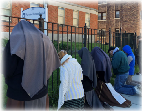
Praying in front of Planned Parenthood, Cincinnati