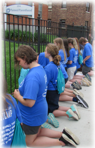
Campers kneel in front of Planned Parenthood & pray the Rosary