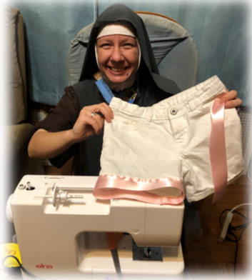
Sister lengthened a pair of "Short Shorts" to make them more modest .

Ever wonder what Sisters do in their Spare Time?