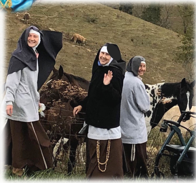
Sisters love to visit the horses on a day of prayer in the country