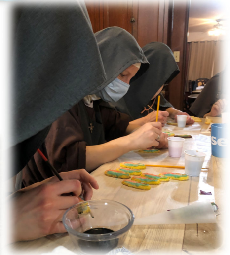
Decorating "Our Lady of Guadalupe" Cookies for a celebration