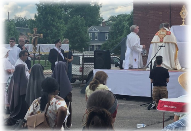
The sisters kneel in prayer at a Corpus Christi procession in Hamilton Ohio