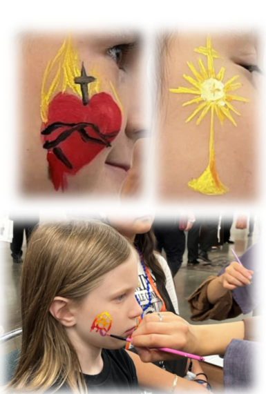
Facepainting "Holy images" at the National Eucharistic Congress

Please join us for an Anniversary Mass - October 4th, 6pm at the Cathedral Basilica of the Assumption Reception to follow at St. Joseph's convent. All are welcome!