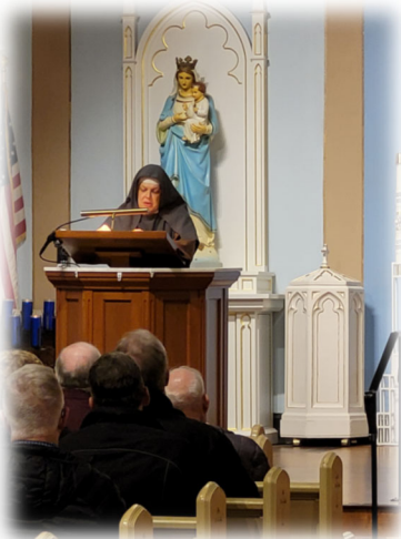
Mother gives a talk on fasting for "Catholics United for the Faith"