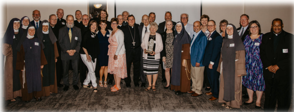
Dinner Committee, Honored Guests and Friends of the Rose Garden Board Members