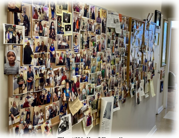
The “Wall of Fame”

If you can't pay for a doctor's office visit, you don't go. If you have some medicine, you ration it to make it last longer. It is really difficult initially to understand that our clinic is here to provide the things you cannot afford until you can afford them.