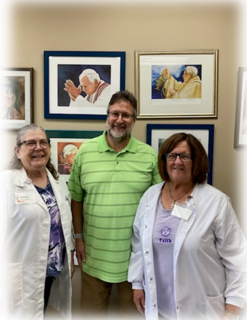
Our Staff; the Craniotomy team