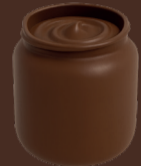
Chocolate sauce (sugar-free)