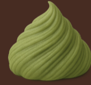
Dubai chocolate (sugar-free)