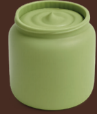
Pistachio & white chocolate sauce (sugar-free)