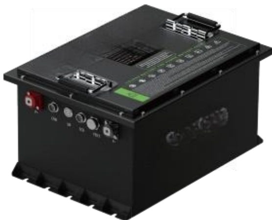
01. Battery Pack