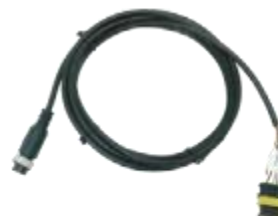
05. Charging communication cable