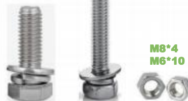
06.M8 screw 07.M6 screw 08.M6 nut

M8x16/SUS*3 M6x20/SUS*2 M8x30/SUS*4 M6x30/SUS*8