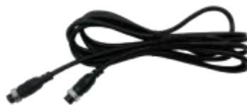
02. Communication Cable