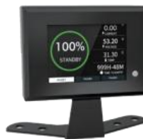
03. Display Screen