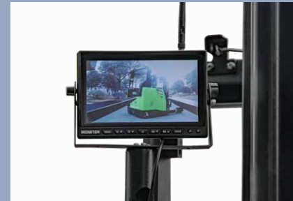
Camera systems for driving and pallet handling