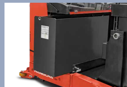
Battery side roll out