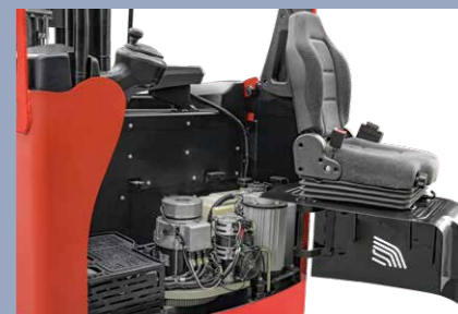
Fully open door enables easy repair and maintenance