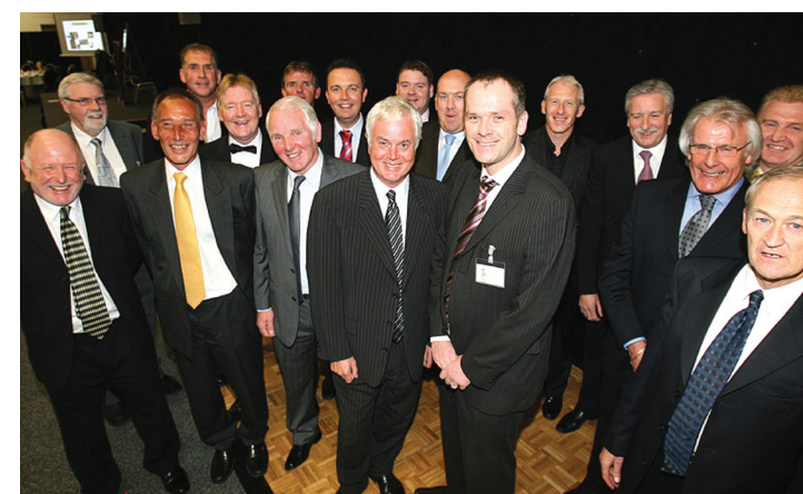
SFU Raised over £3,000 at the sportsmans dinner held at the John Fretwell Sporting Complex on 24th September 2008