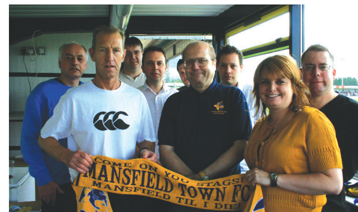
SFU sponsored Hucknall pre season friendly