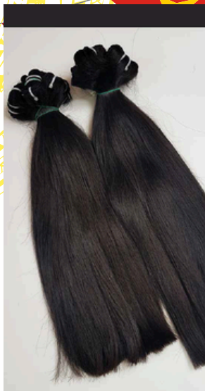
#1B Natural Black