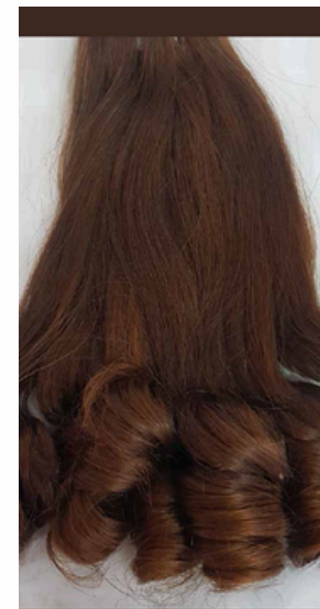
#6 Light Brown