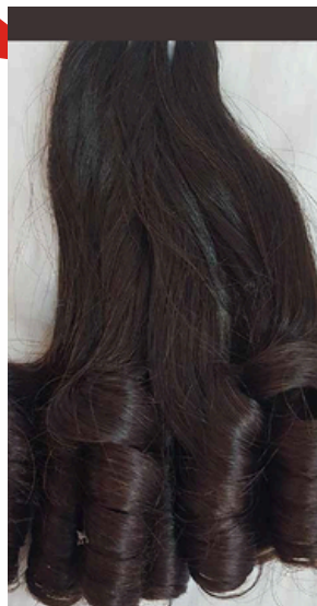
#2 Dark Brown