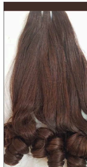
#4 Medium Brown