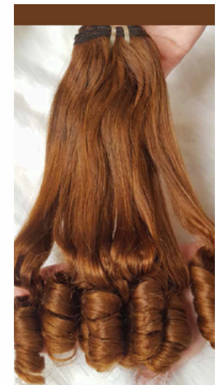
#8 Light Brown Blonde