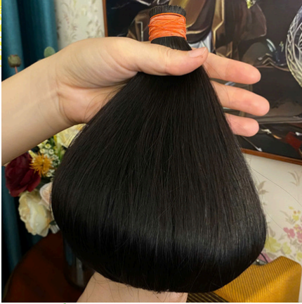
✓ bulk hair