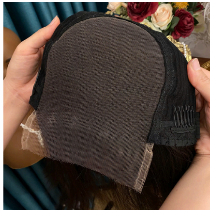
✓ HD Lace Wig