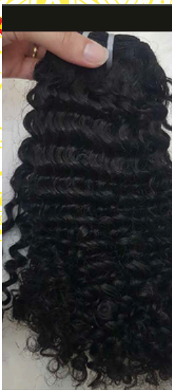
#1 Jet Black