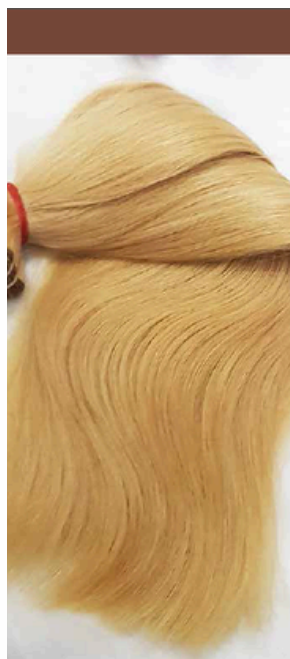
#613 Platinum Blonde