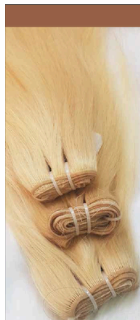
#60 Light Blonde