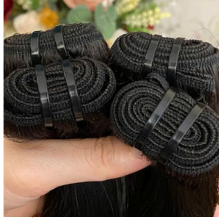
✓ wefted hair