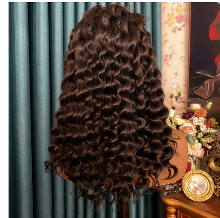
✓ Transparent Lace Wig