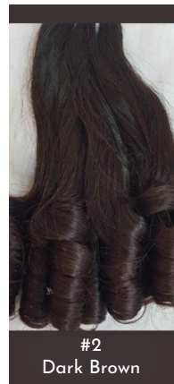
#2 Dark Brown