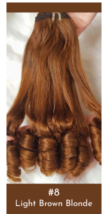
#8 Light Brown Blonde