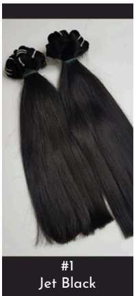
#1 Jet Black

From Natural Black to Platinum Blonde (#613), we use a gentle coloring process to protect hair health.