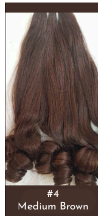
#4 Medium Brown