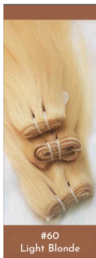
#60 Light Blonde