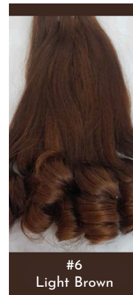
#6 Light Brown