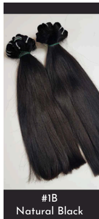
#1B Natural Black