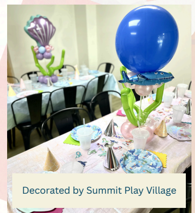
Decorated by Summit Play Village