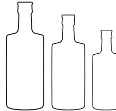
AVAILABLE FORMATS 750ML 25,4. FL. OZ 500ML 17.FL. OZ 250ML 8,5.FL. OZ