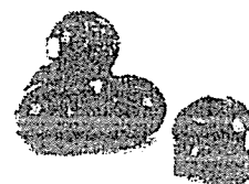
Photo Story Creation