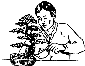
Caring for a Bonsai